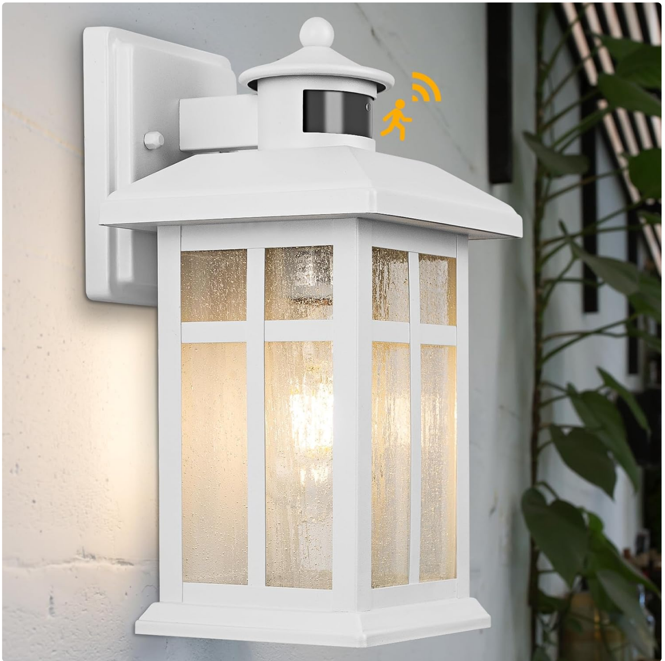
Image 1.1: The Brilvibera Dawn to Dusk Motion Sensor Wall Light Fixture in white, showcasing its design and motion sensor.