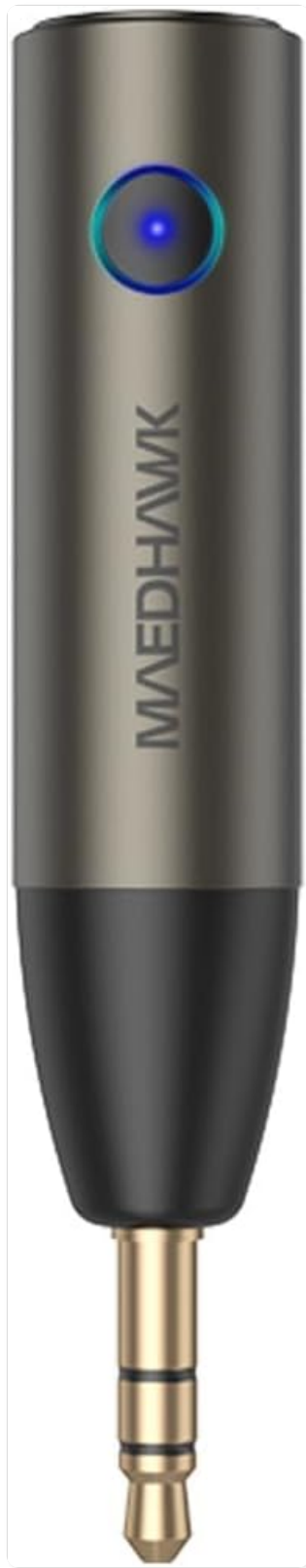
Image: The MaedHawk Bluetooth 5.3 AUX Adapter, a compact device with a 3.5mm jack and a single control button.