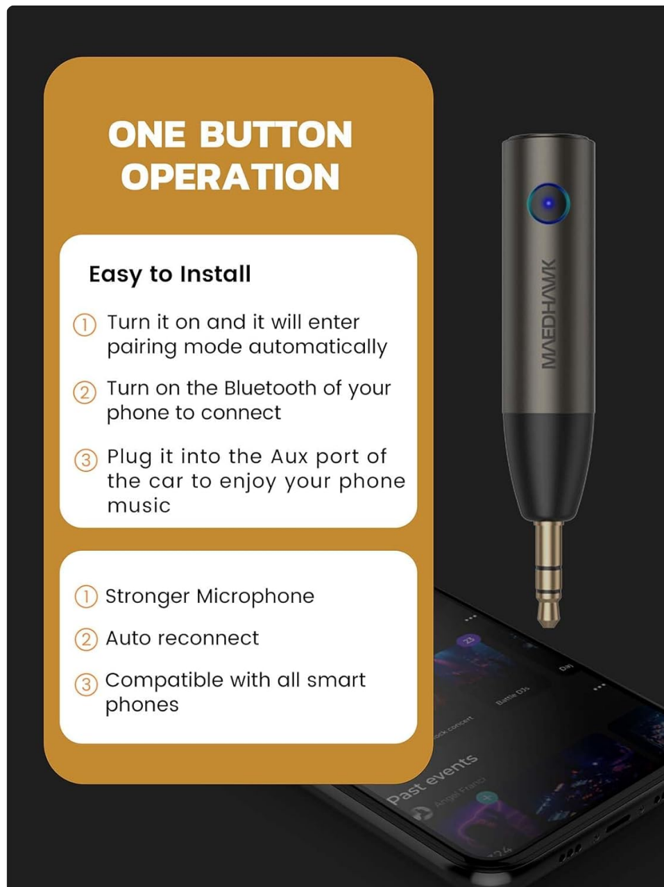
Image: Visual guide for the one-button operation, illustrating the easy installation steps.

Follow these simple steps to set up and connect your MaedHawk Bluetooth AUX Adapter.