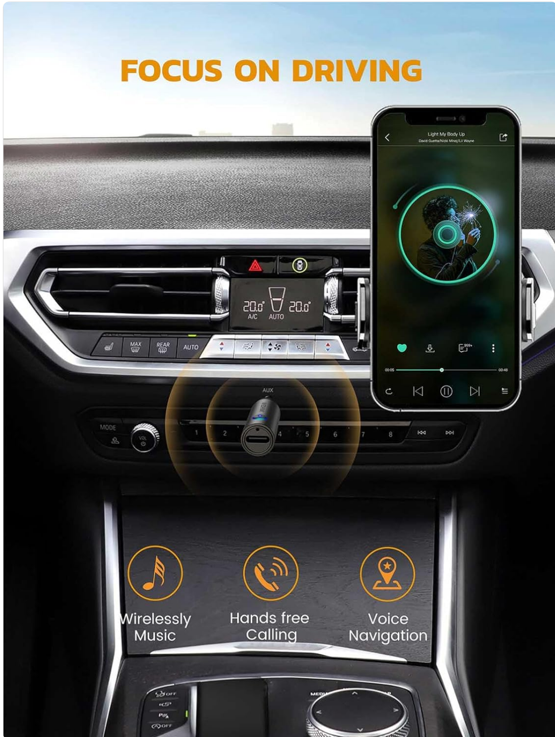
Image: The Bluetooth adapter plugged into a car's AUX port, with a smartphone mounted nearby, illustrating hands-free music, calls, and navigation for a focused driving experience.

Receive voice notifications and directions from your navigation applications directly through your car's audio system when connected.