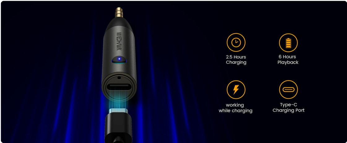
Image: Visual summary of charging and playback features, including 2.5 hours charging, 6 hours playback, working while charging, and Type-C charging port.