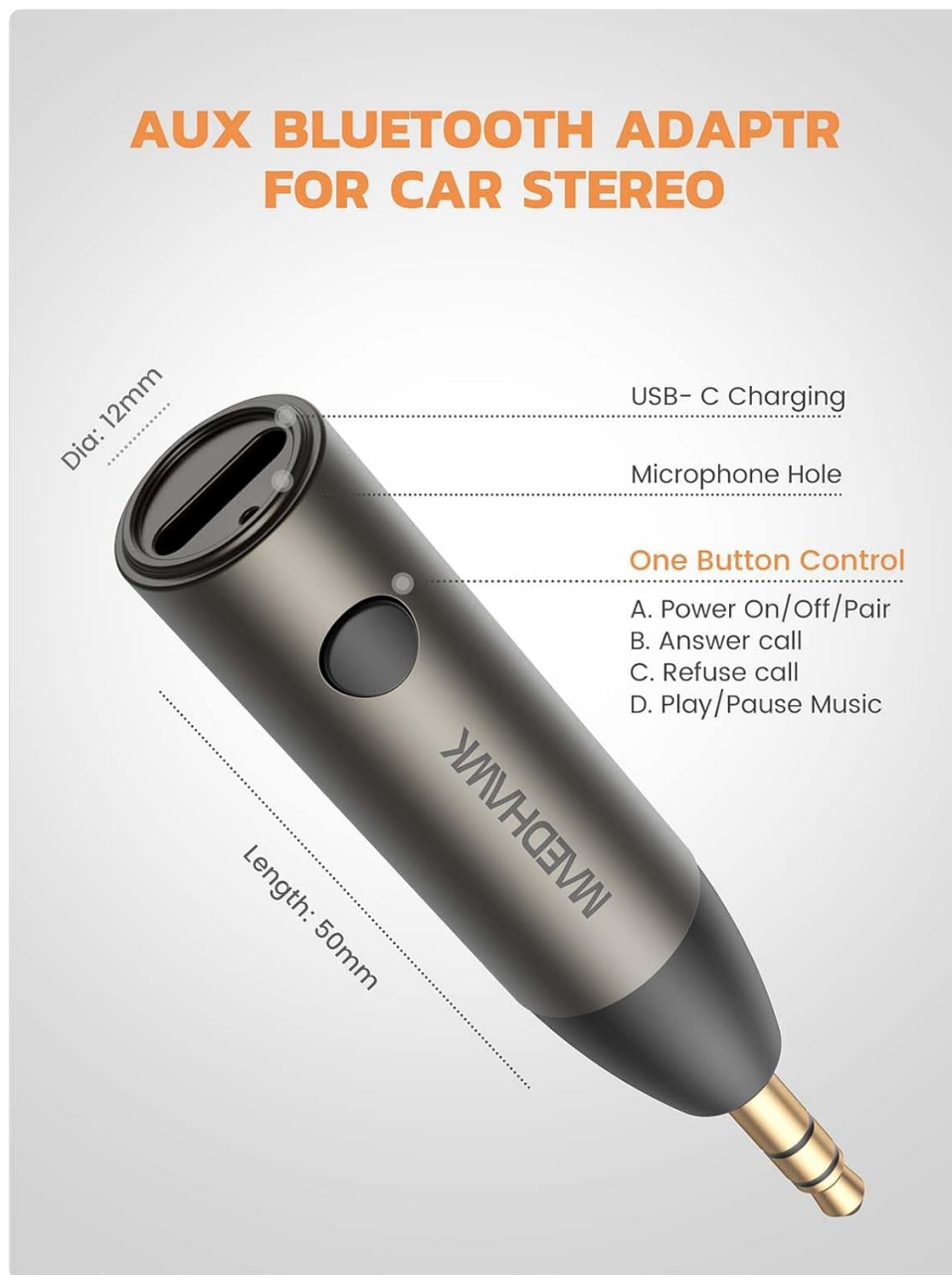
Image: Diagram of the MaedHawk Bluetooth AUX Adapter showing its components and dimensions. The adapter is 50mm long and 12mm in diameter. It features a USB-C charging port, a microphone port, and a multi-function button.

Familiarize yourself with the components and controls of your MaedHawk Bluetooth AUX Adapter.