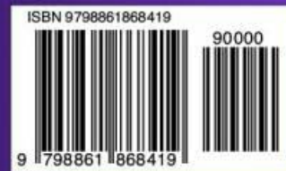
Image: Back cover of the "CRICUT EXPLORE 3 HANDBOOK". It features text emphasizing the guide's comprehensive nature and includes the ISBN barcode (979-8861868419).

Within these pages, you'll find step-by-step instructions, practical tips, and inspiring project ideas that will motivate you to push the boundaries of your creativity.