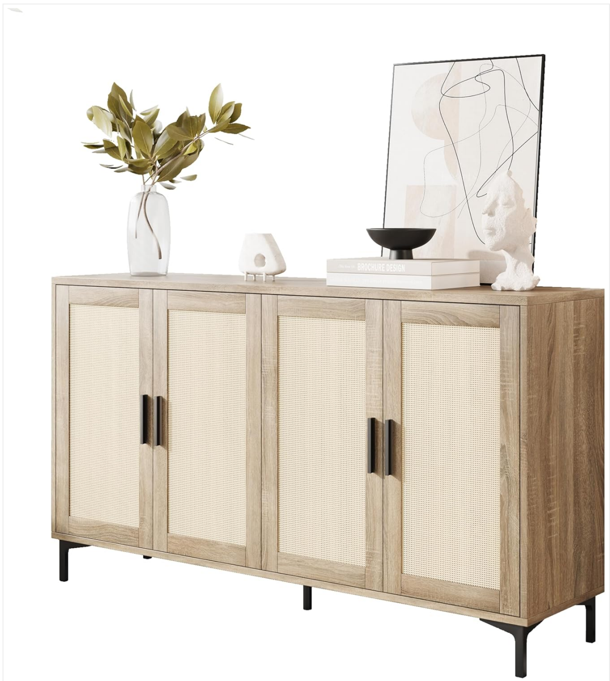
Figure 1: JASIWAY Sideboard Model BG002 in a natural finish.

Your browser does not support the video tag.