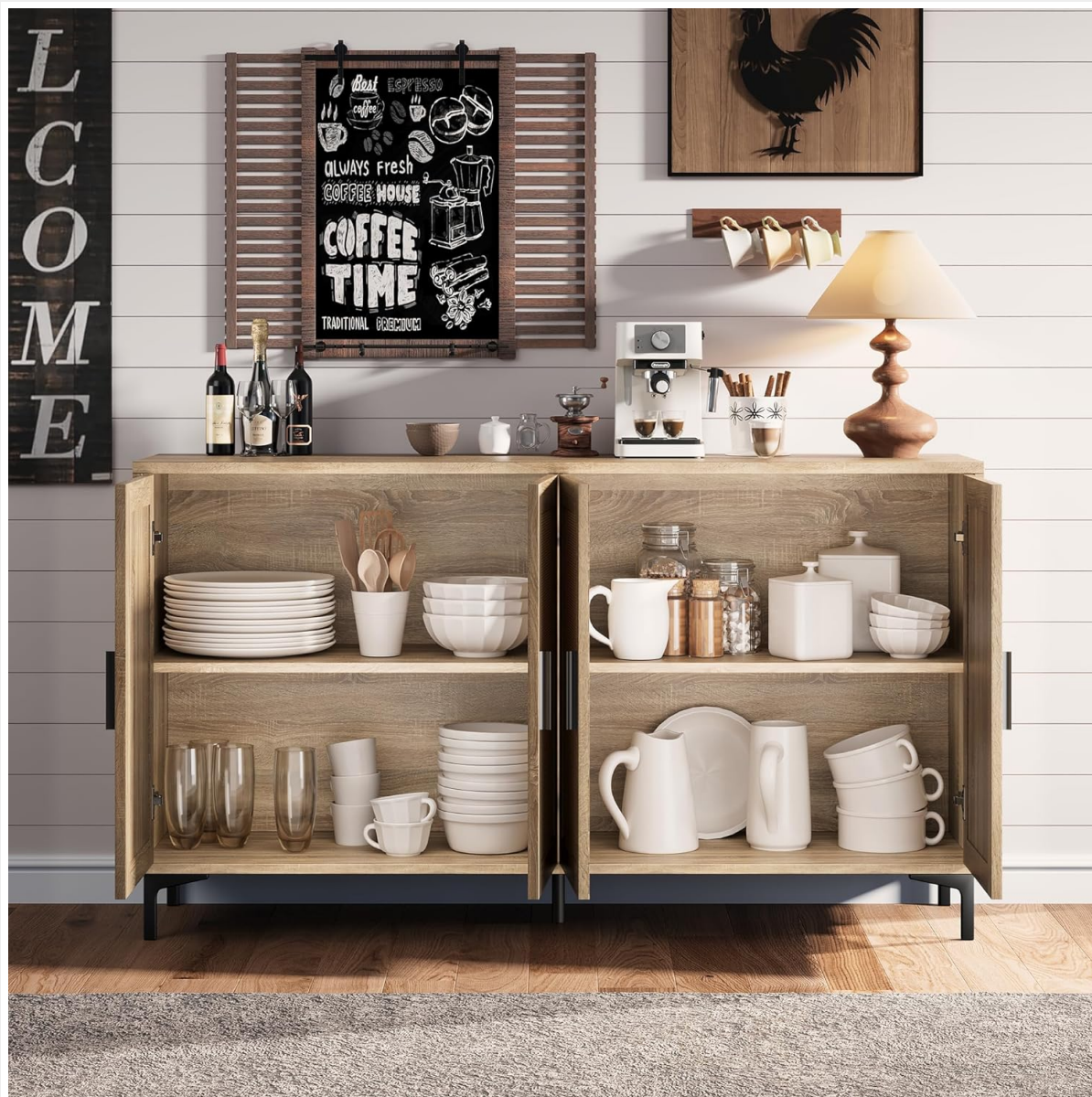
Figure 3: Interior view demonstrating the adjustable shelving for customized storage.