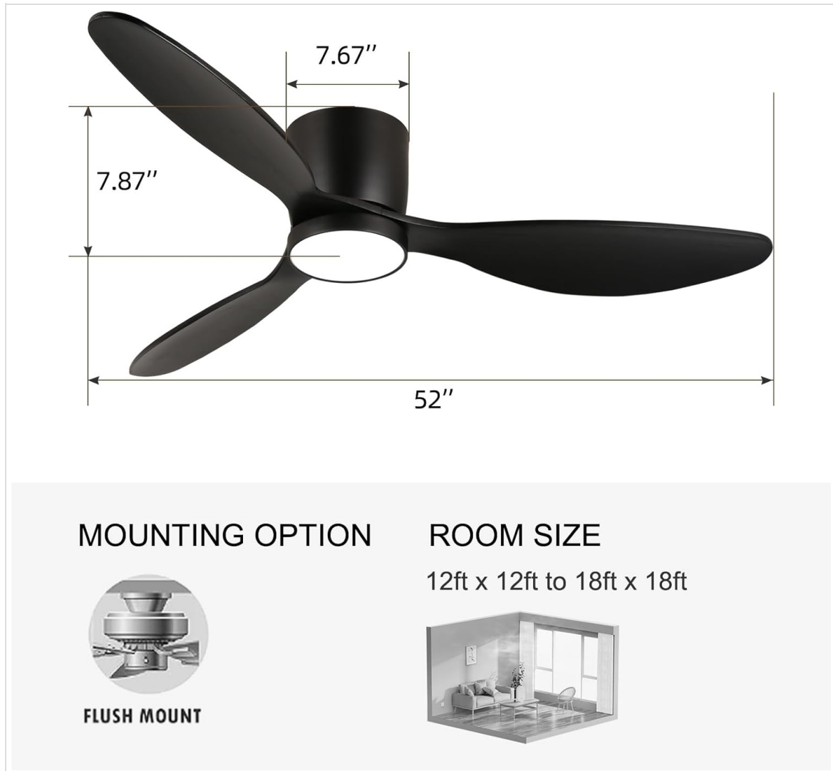
Image: Diagram illustrating fan dimensions and recommended room size for optimal performance.