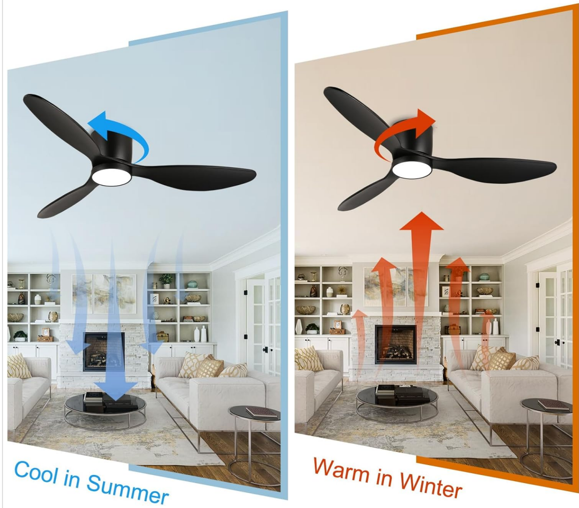
Image: Reversible airflow for year-round comfort.