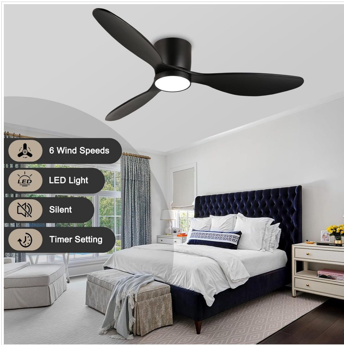
Image: reiga 52-inch flush mount ceiling fan with three black blades and integrated LED light, installed in a bedroom.