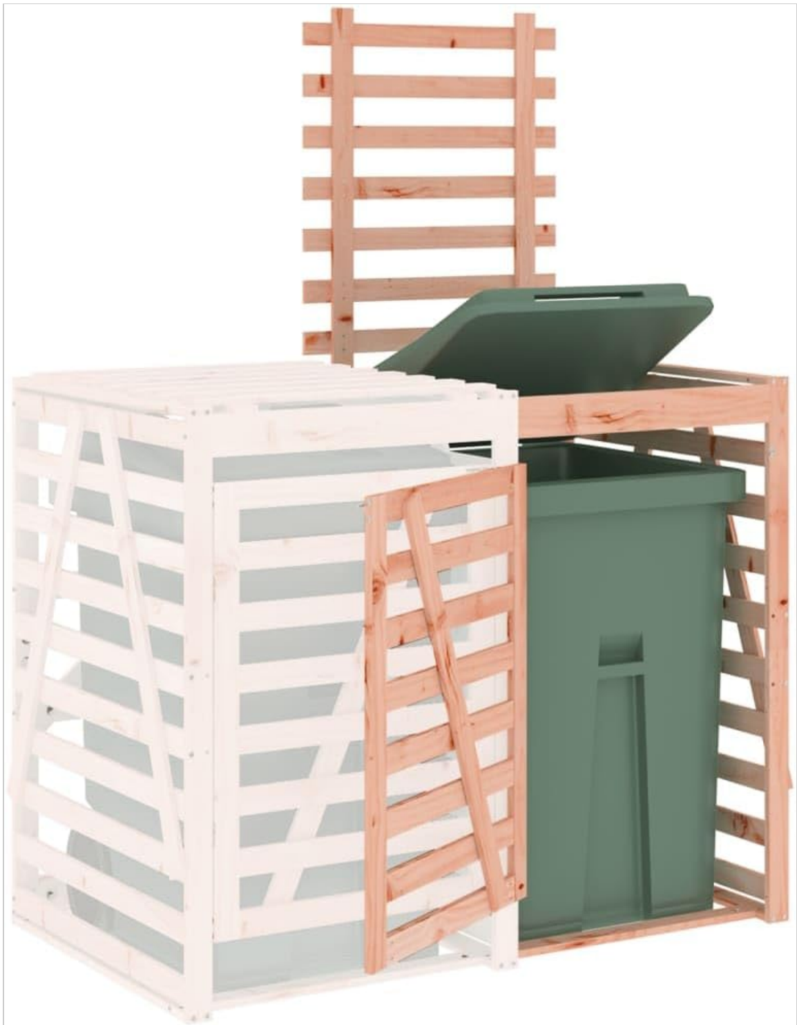
Image 3.1: The bin storage extension with its top lid open, providing access to the wheelie bin for waste disposal.