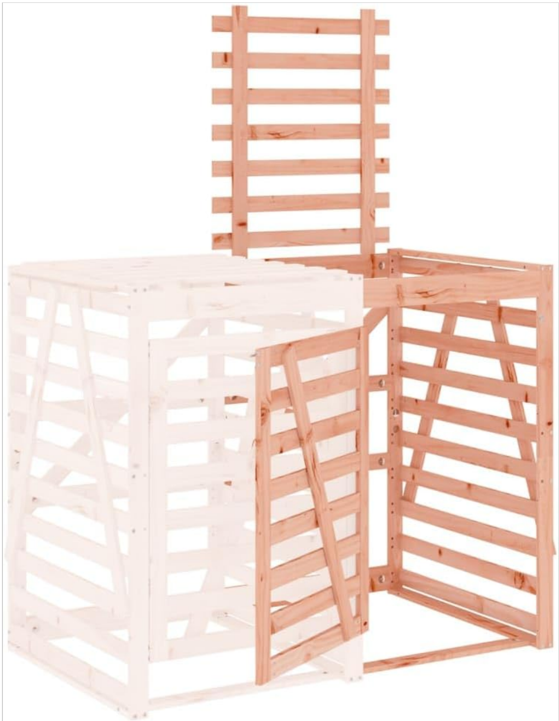
Image 2.1: Illustration of the extension being connected to a primary bin storage unit.