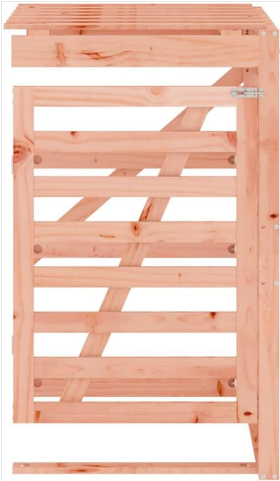
Image 2.2: Depiction of the door and lid installation process for the extension unit.