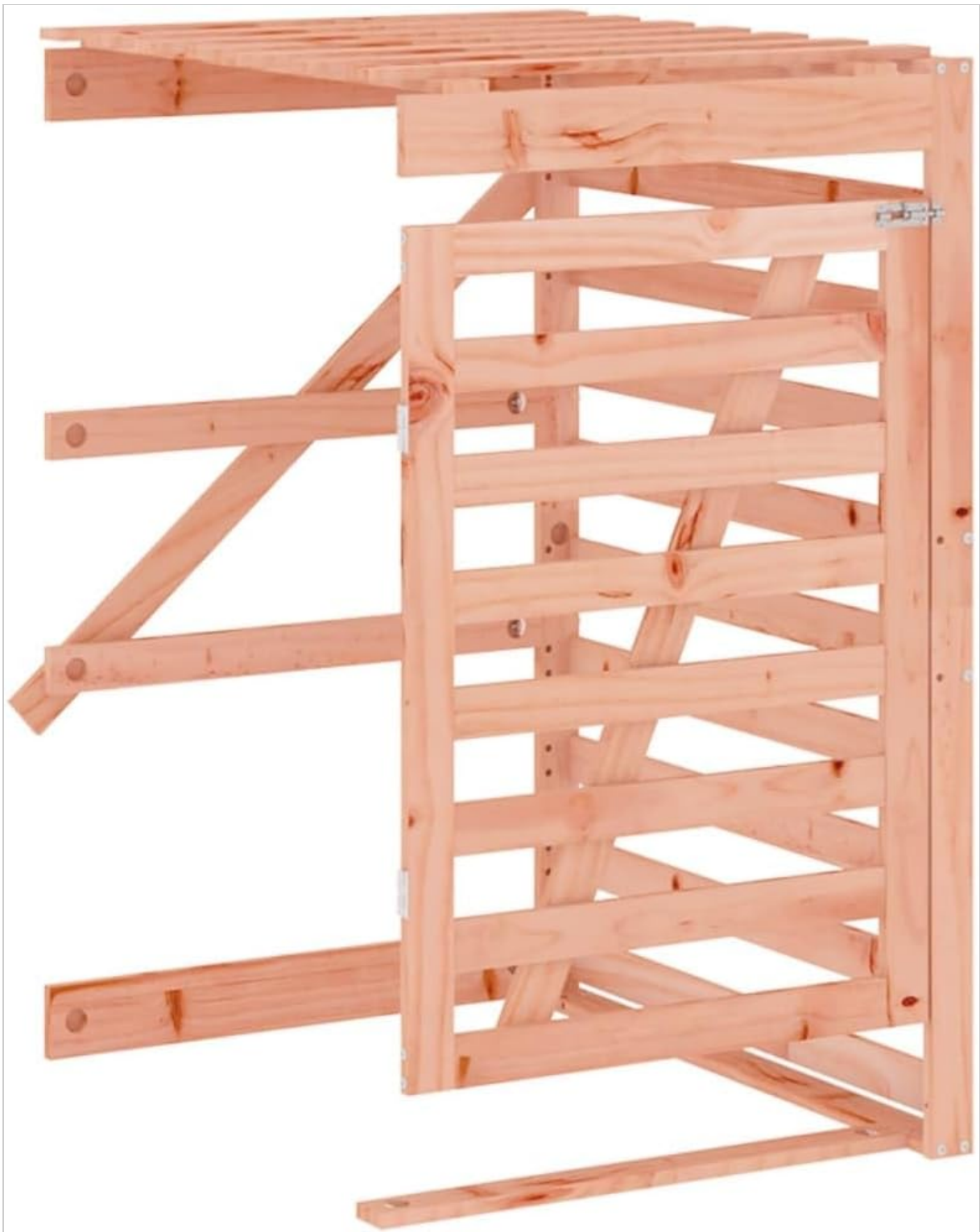
Image 1.1: Front view of the vidaXL Wheelie Bin Storage Extension, showcasing its slatted wooden design.