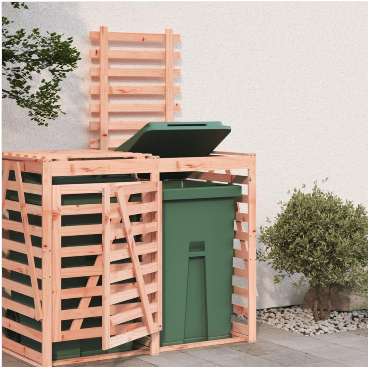
Image 2.3: The assembled bin storage extension shown with a wheelie bin placed inside, demonstrating its function.