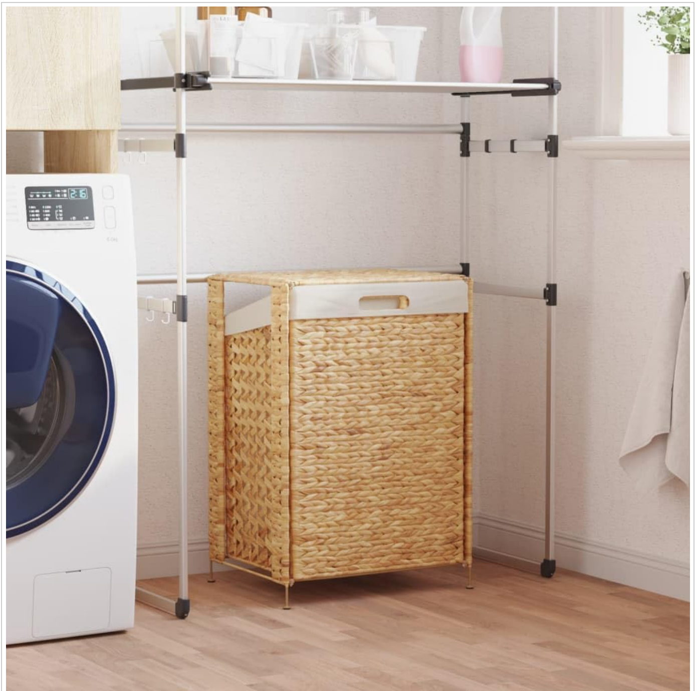
Figure 4: The laundry basket positioned in a bathroom next to a washing machine. This image demonstrates a typical placement for the product in a home environment.