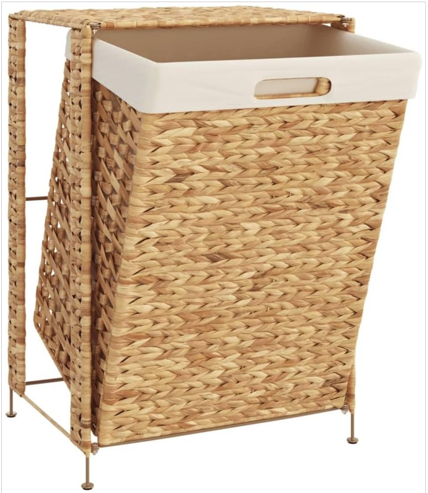
Figure 1: Assembled vidaXL Laundry Basket with Lid. This image shows the complete laundry basket, highlighting its woven water hyacinth exterior, metal frame, and integrated lid with a handle.