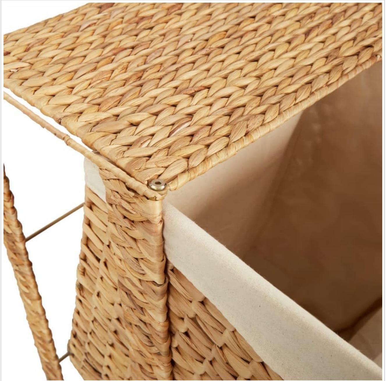
Figure 3: Detail of the metal frame connection point. This close-up illustrates how the water hyacinth basket attaches to the metal support frame.