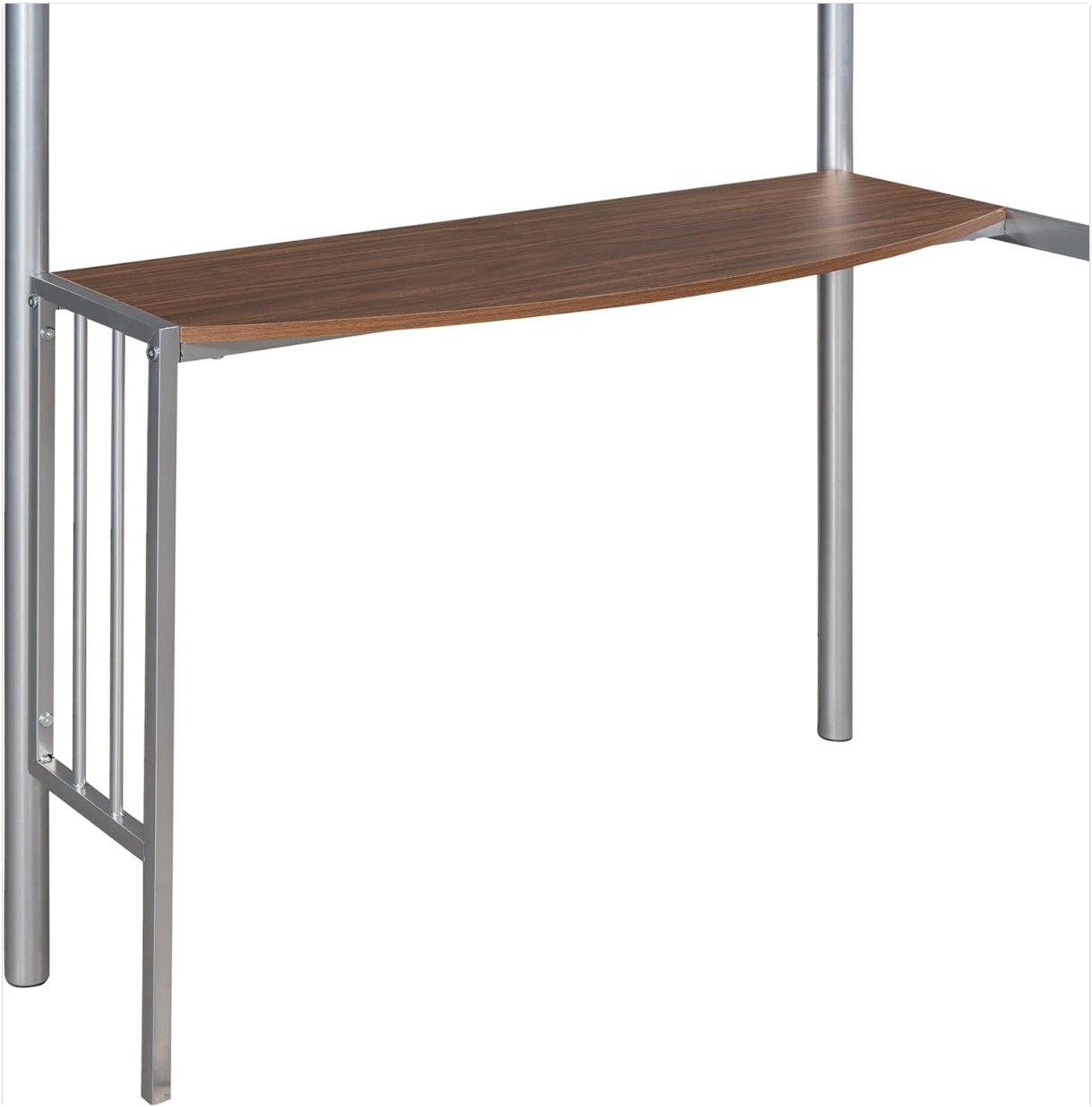
Figure 4: Close-up of the sturdy MDF desk surface, providing a dedicated workspace.