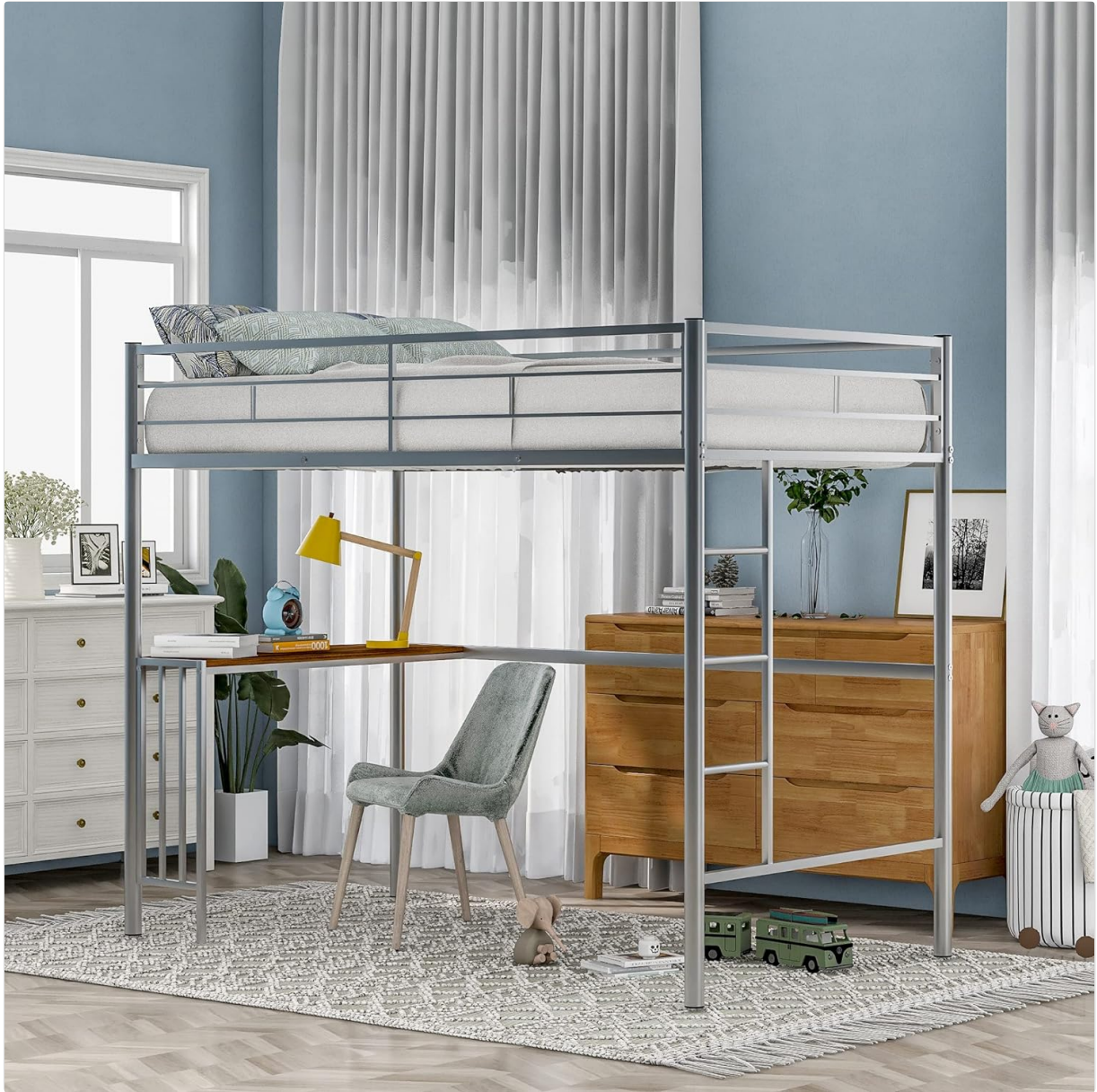
Figure 1: Overall view of the BOVZA Twin Metal Loft Bed with Desk in Silver.

The following images provide a visual overview of the BOVZA Twin Metal Loft Bed with Desk, including its key features and dimensions.