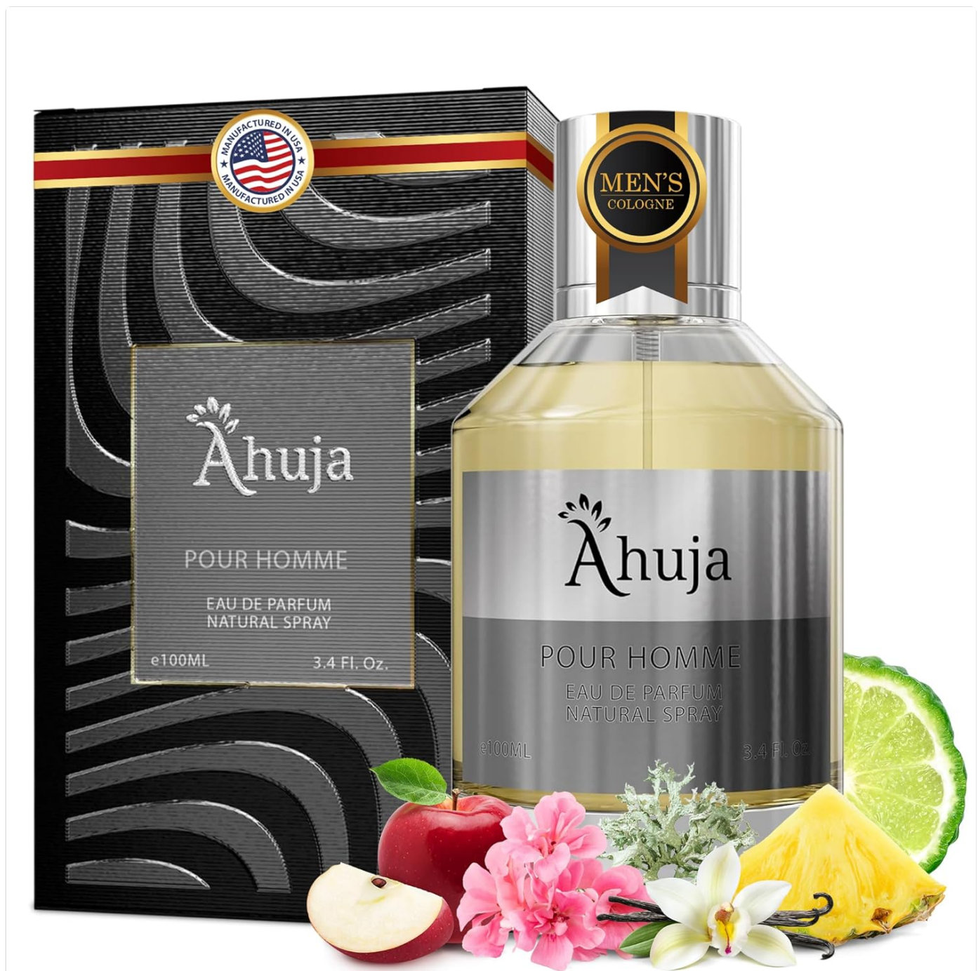
Image: The AHUJA Pour Homme Eau de Parfum bottle alongside its elegant black and silver packaging, with various fragrance notes like citrus, apple, pineapple, vanilla, and oakmoss depicted around it.