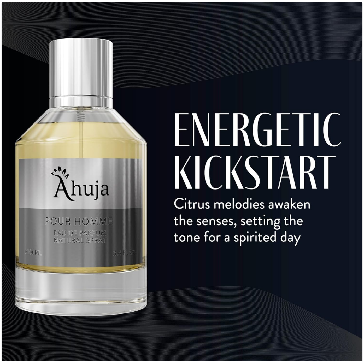
Image: The AHUJA Pour Homme bottle with text highlighting its 'Energetic Kickstart' citrus notes, symbolizing the invigorating initial scent.

Image: A man applying AHUJA Pour Homme Eau de Parfum to his neck, demonstrating a typical application method for men's fragrance.