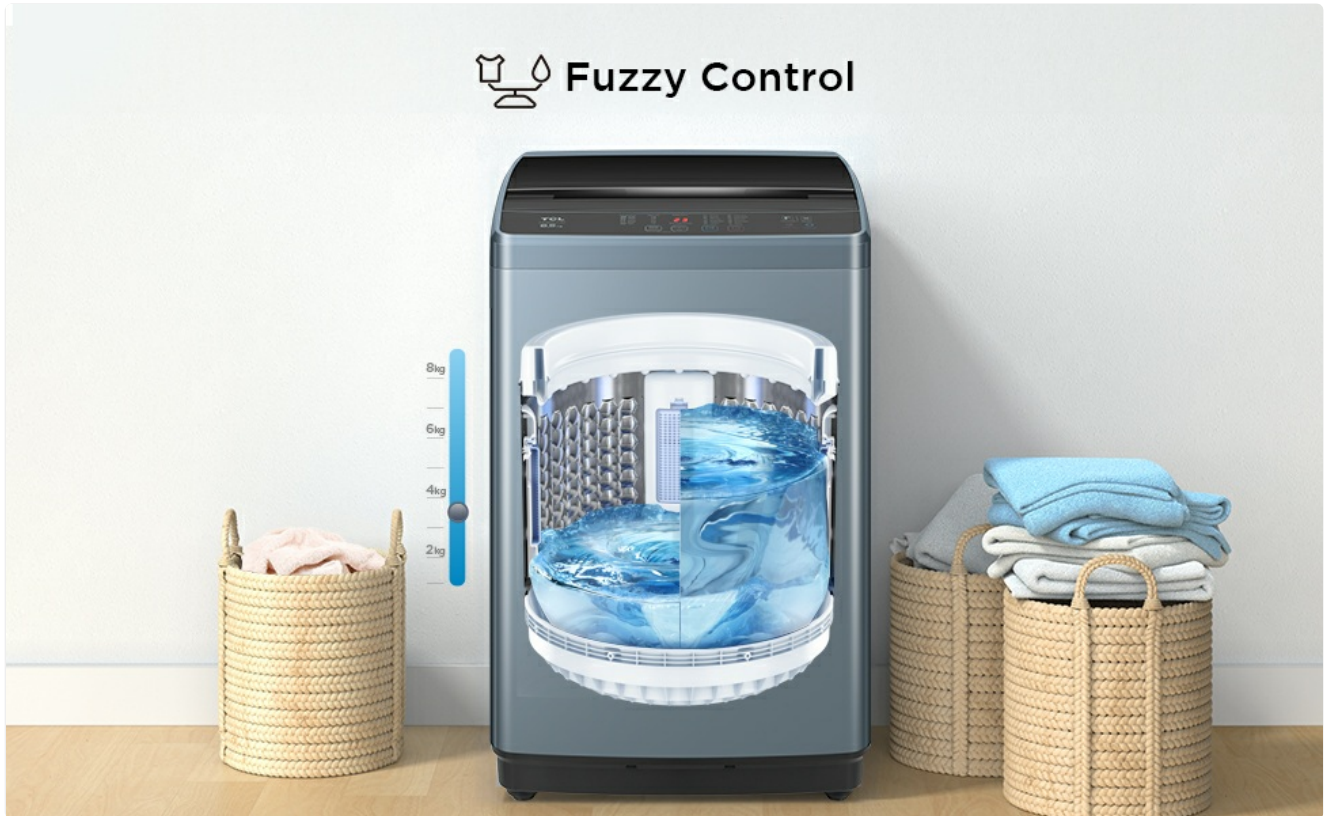
Image: Illustration of Fuzzy Control automatically adjusting water levels based on laundry weight.