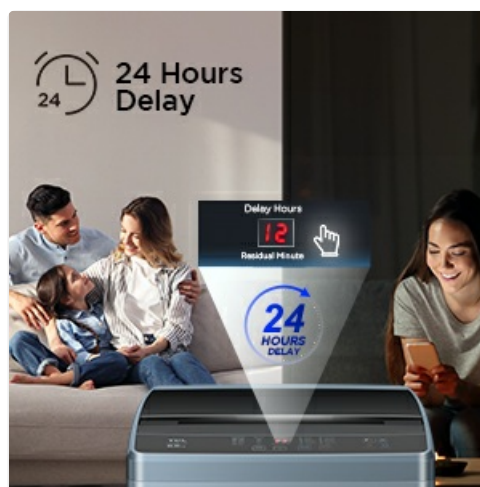
Image: Icon representing the 24 Hours Delay function.