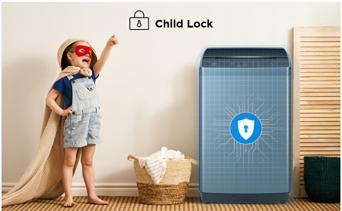
Image: Illustration of the Child Lock feature, showing a child near the washing machine with a lock icon.