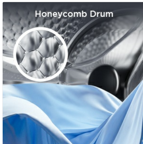
Image: Close-up of the Honeycomb Crystal Drum texture.