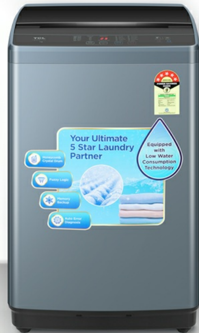
Image: Overview of features including Magic Filter, Memory Backup, 24 Hours Delay, Fuzzy Control, One Click Spinning, and Child Lock.