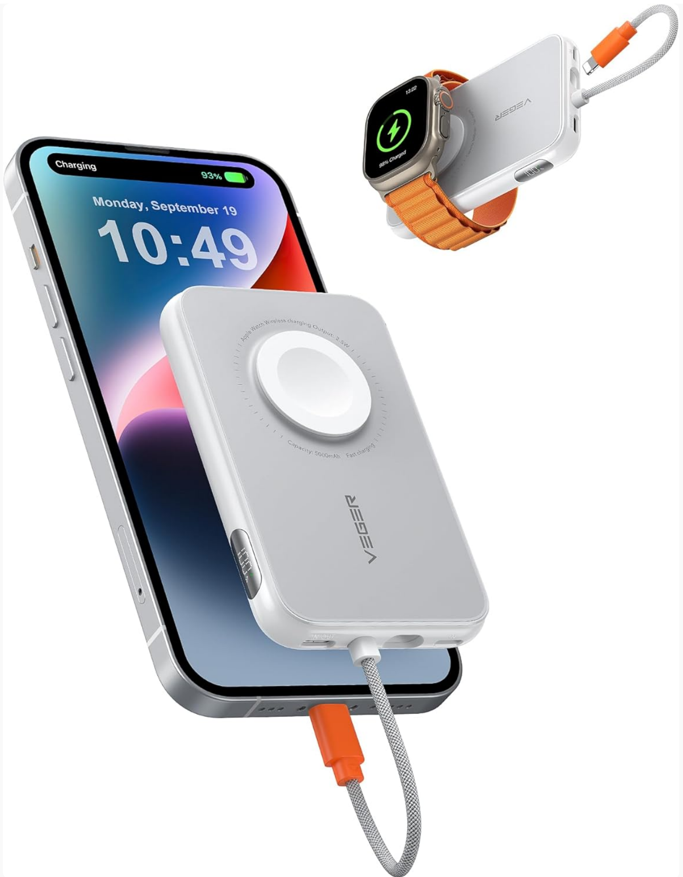
Image: The VEGER portable charger simultaneously charging an iPhone and an Apple Watch, highlighting its multi-device capability.