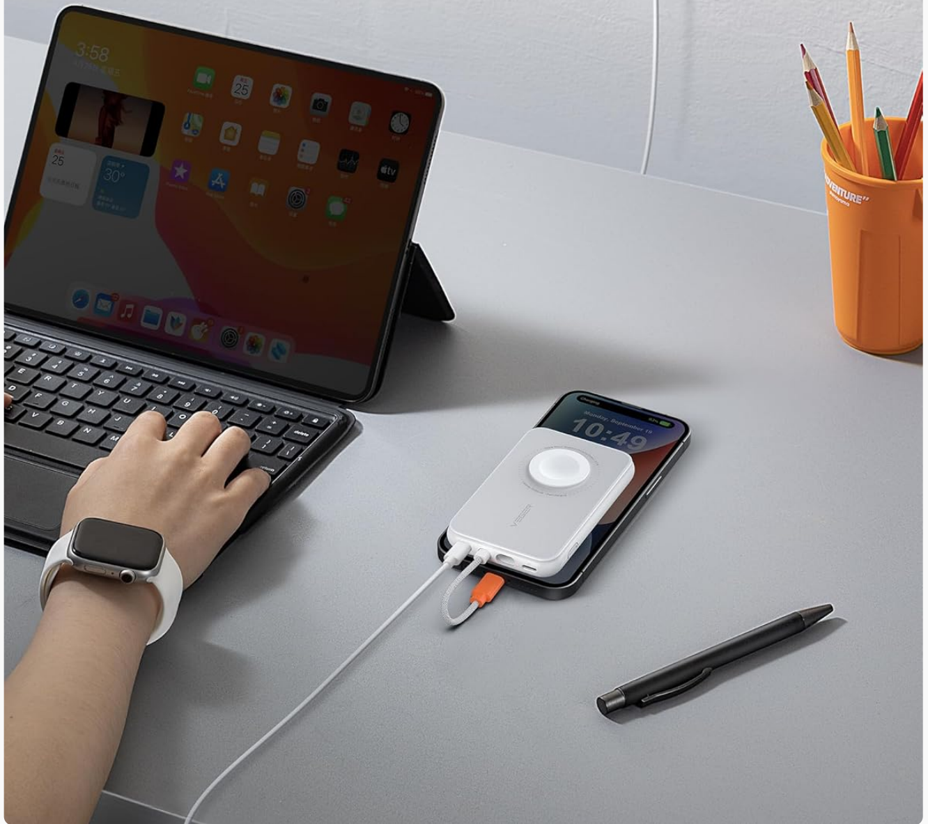
Image: The VEGER portable charger plugged into a wall adapter for recharging, while simultaneously charging an iPhone and an Apple Watch, illustrating pass-through charging.