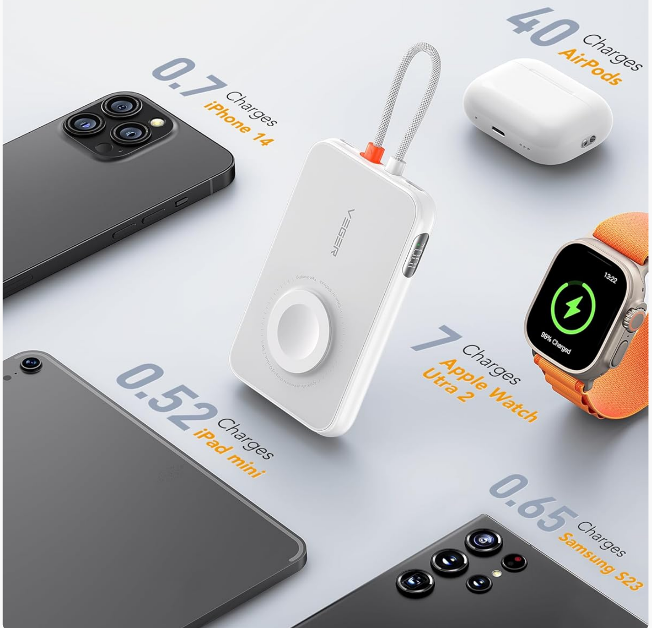
Image: An infographic detailing the VEGER portable charger's universal compatibility with iPhone, Apple Watch, iPad mini, AirPods, and Samsung S23, along with estimated charge capacities.