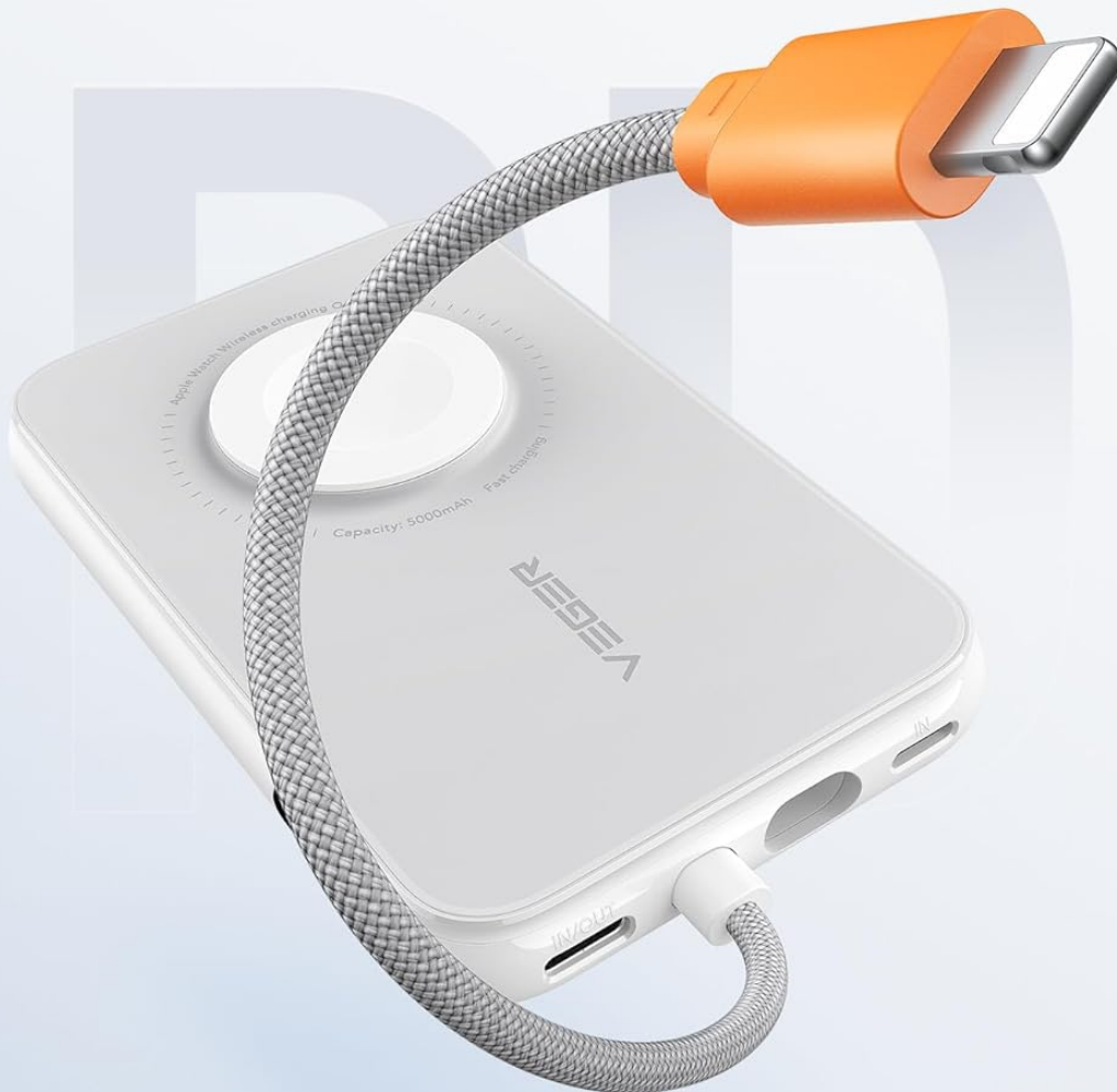
Image: A close-up view of the VEGER portable charger, highlighting the built-in iPhone cable with PD 20W output and its woven design.

The portable charger features a built-in cable for Apple devices (Lightning connector), a USB-C input/output port, and a magnetic charging pad for Apple Watch.