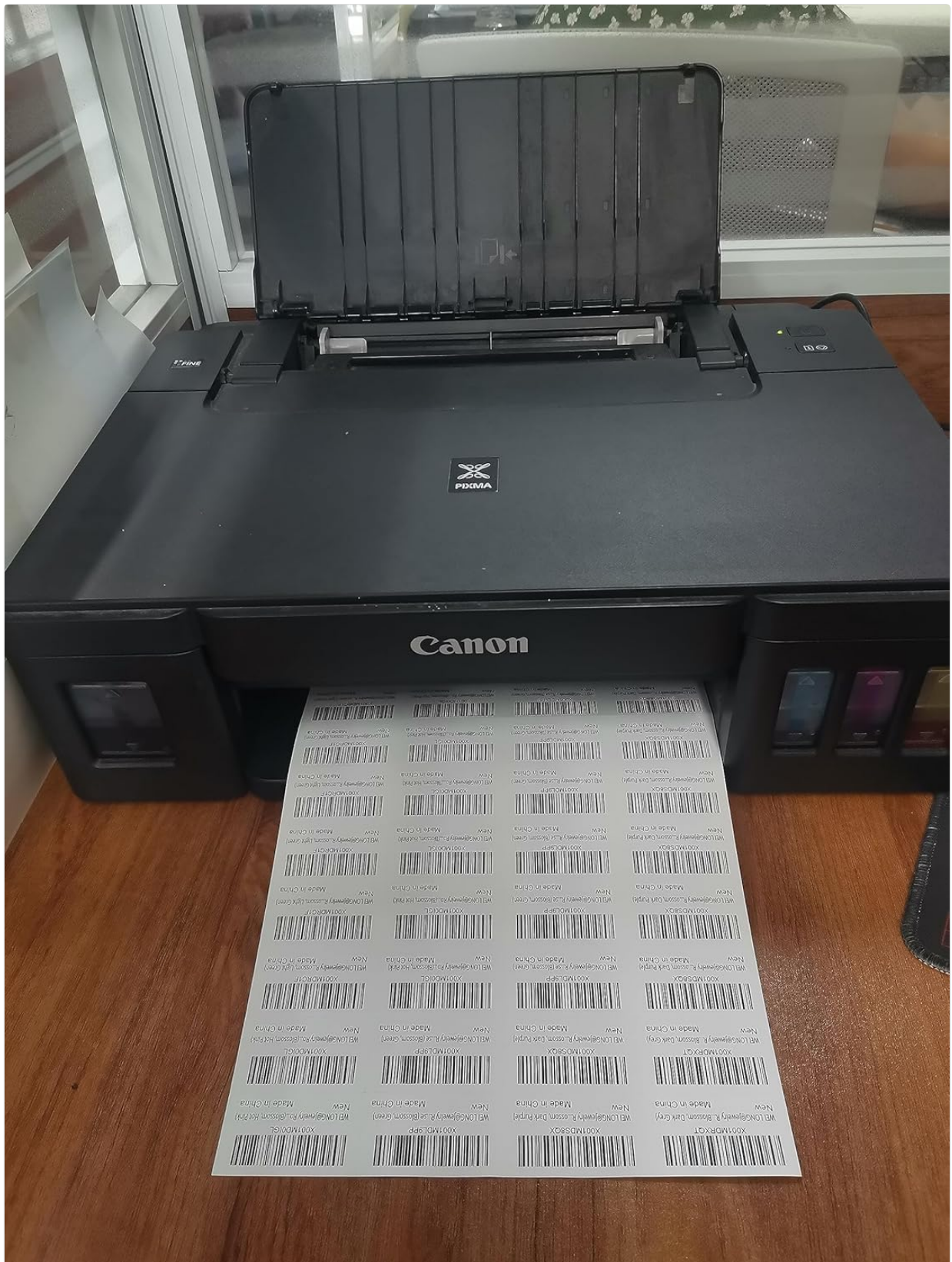
Image 3.1: A Canon printer actively printing FBA labels on a Wei Long label sheet.