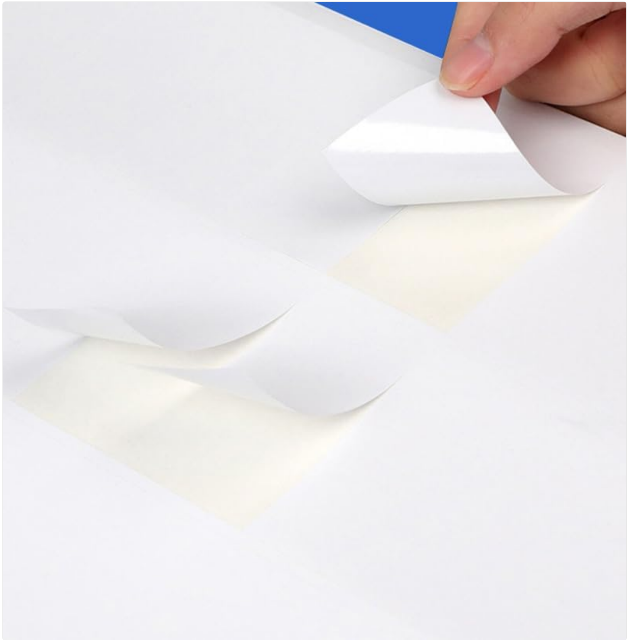
Image 4.2: A hand demonstrating the easy-peel feature by lifting a label from its backing sheet.