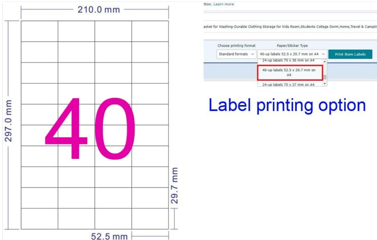
Image 4.1: A visual representation of the 40-up label layout on an A4 sheet with dimensions, alongside a screenshot showing the '40-up labels 52.5 x 29.7 mm on A4' selection in a printing interface.