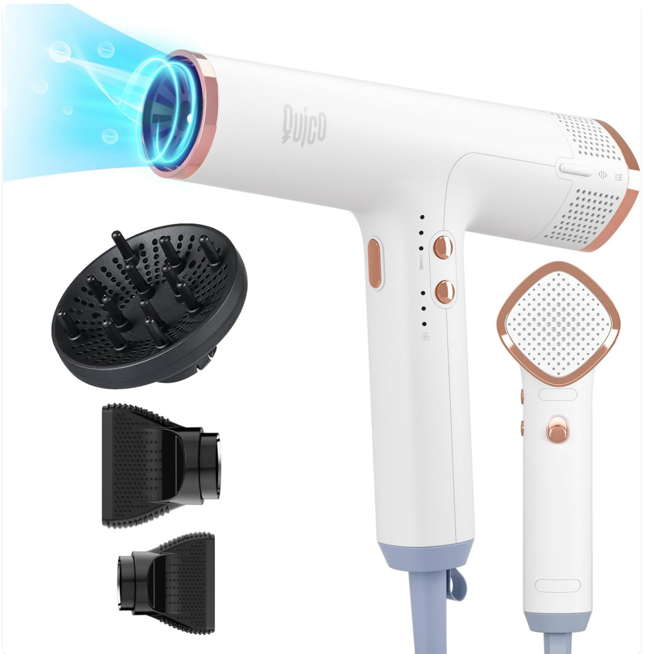
Figure 1: Quico Hair Blow Dryer with included attachments.