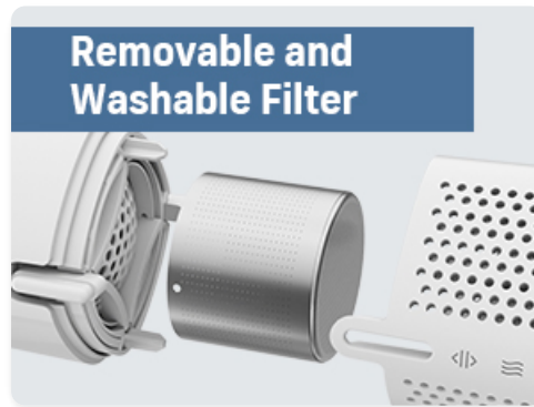
Figure 5: The removable and washable air inlet filter for easy cleaning.