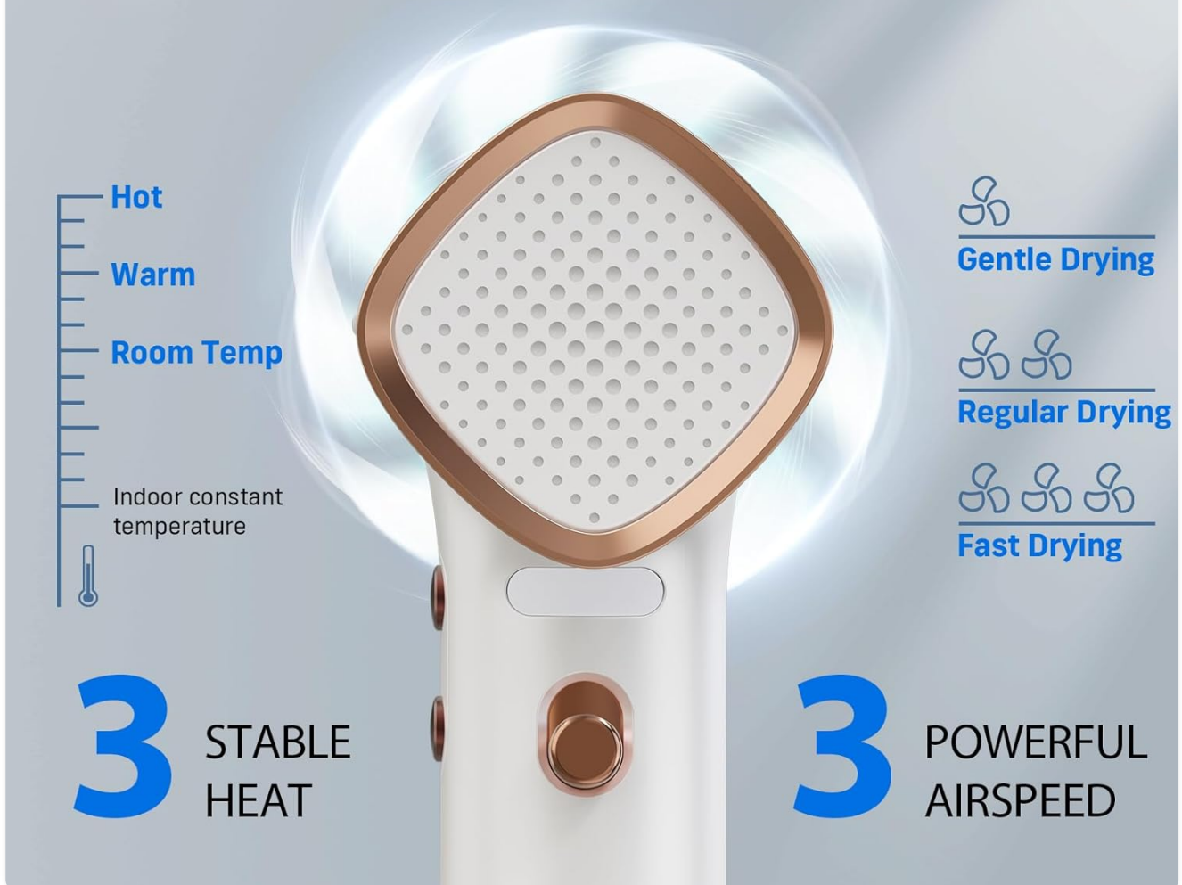
Figure 4: Control panel with indicators for heat and speed settings.

Your browser does not support the video tag.