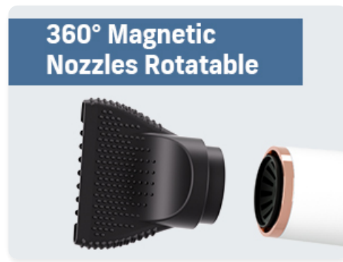
Figure 3: Magnetic nozzle attachment for easy and secure fitting.