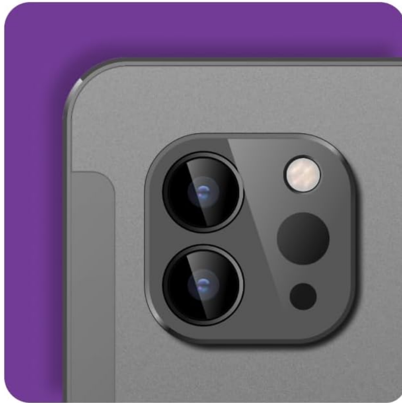
Detail of the INOI Tablet's rear camera module, featuring a 13 MP sensor and LED flash.

Keep in touch with your loved ones with 8 MP front-facing camera which is perfect for video calls. Share the videos made on 13 MP rear camera with autofocus and an LED flash.