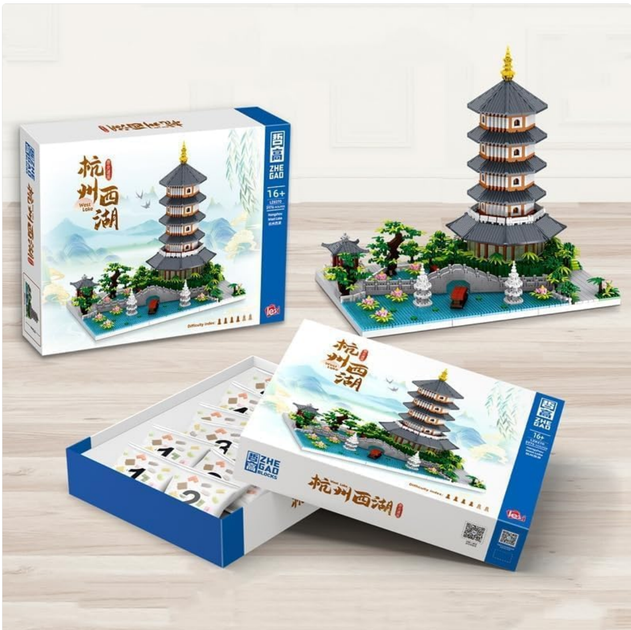
Image: The product box and individually packaged building block components, ready for assembly.