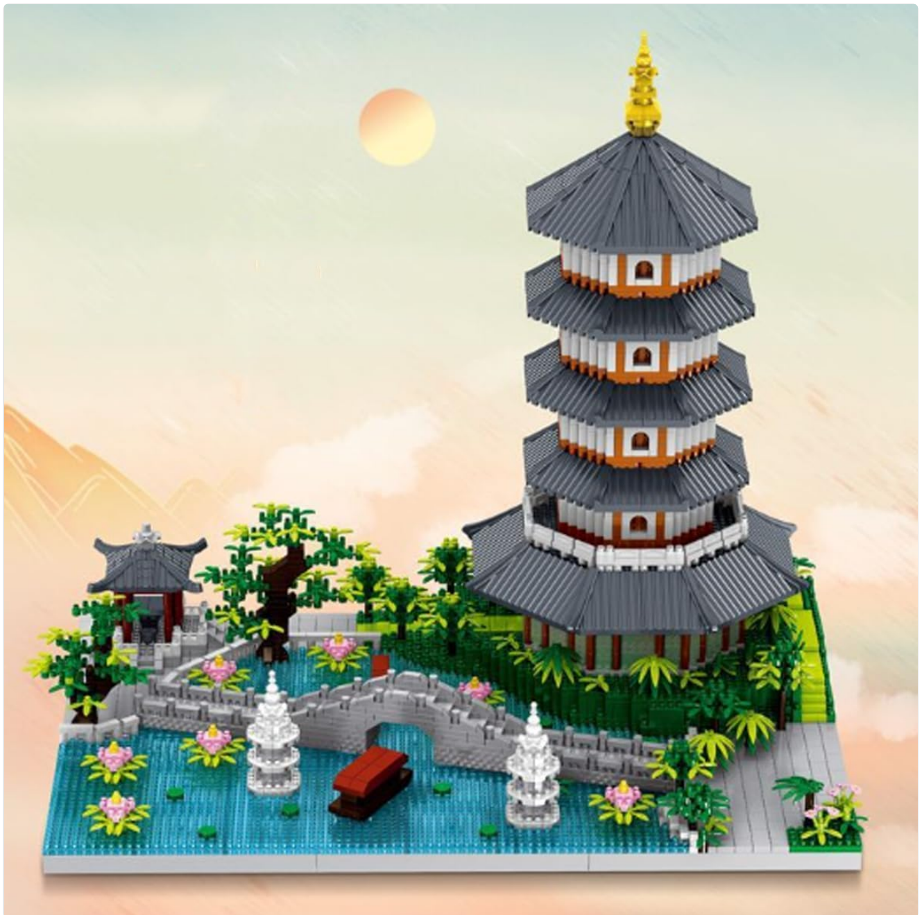
Image: A fully assembled JOMIOD West Lake model, featuring a multi-tiered pagoda, a curved bridge, and simulated water with lotus flowers.

trees, and water features that characterize the West Lake complex.