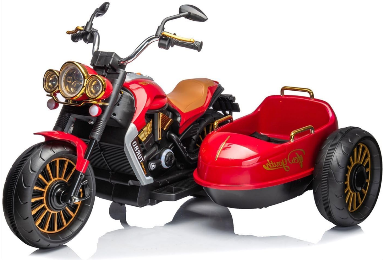
Figure 1: The red Chipolino Duo TRON electric motorcycle with its attached side-car, viewed from the front-left. The motorcycle features gold accents on the headlights and wheels, a brown seat, and black tires. The side-car is also red with gold handles and a black base.