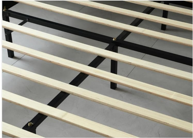
12 PLYWOOD slats