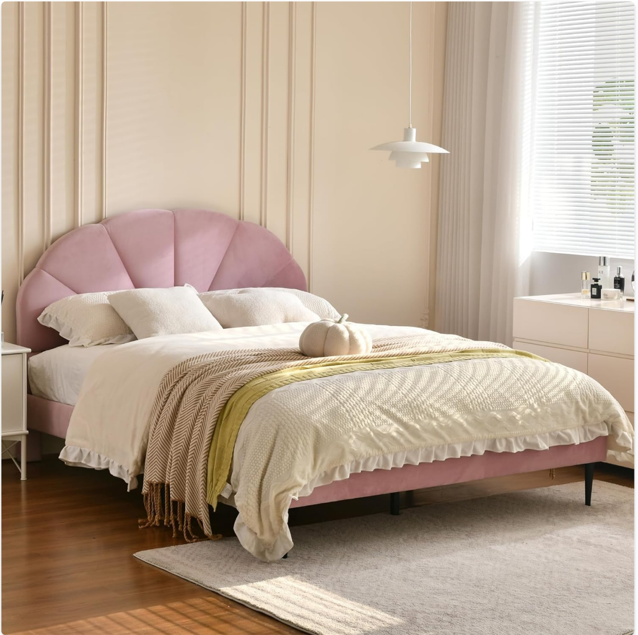
Image 1.1: The VELOCAVA Pink Full Size Bed Frame, showcasing its seashell headboard and velvet upholstery in a bedroom setting.