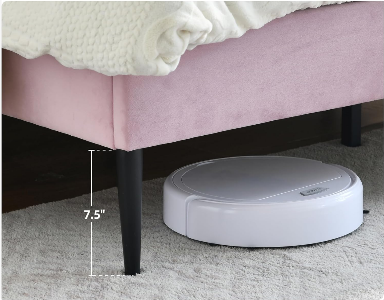
Image 5.2: The 7.5-inch under-bed clearance allows for convenient storage or easy cleaning access for robotic vacuums.