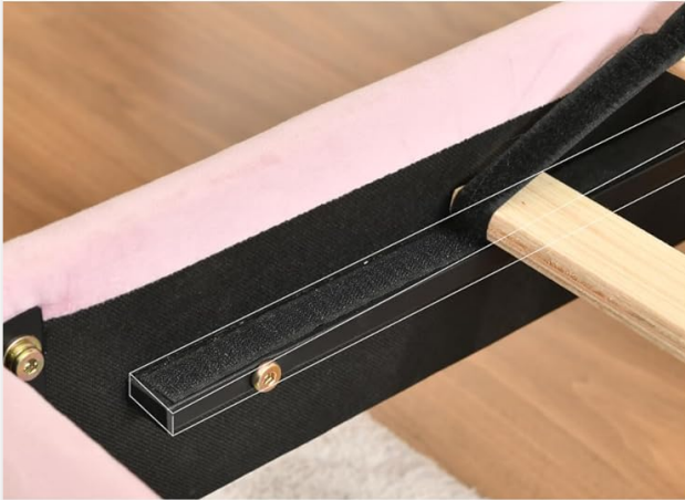
METAL side support bar