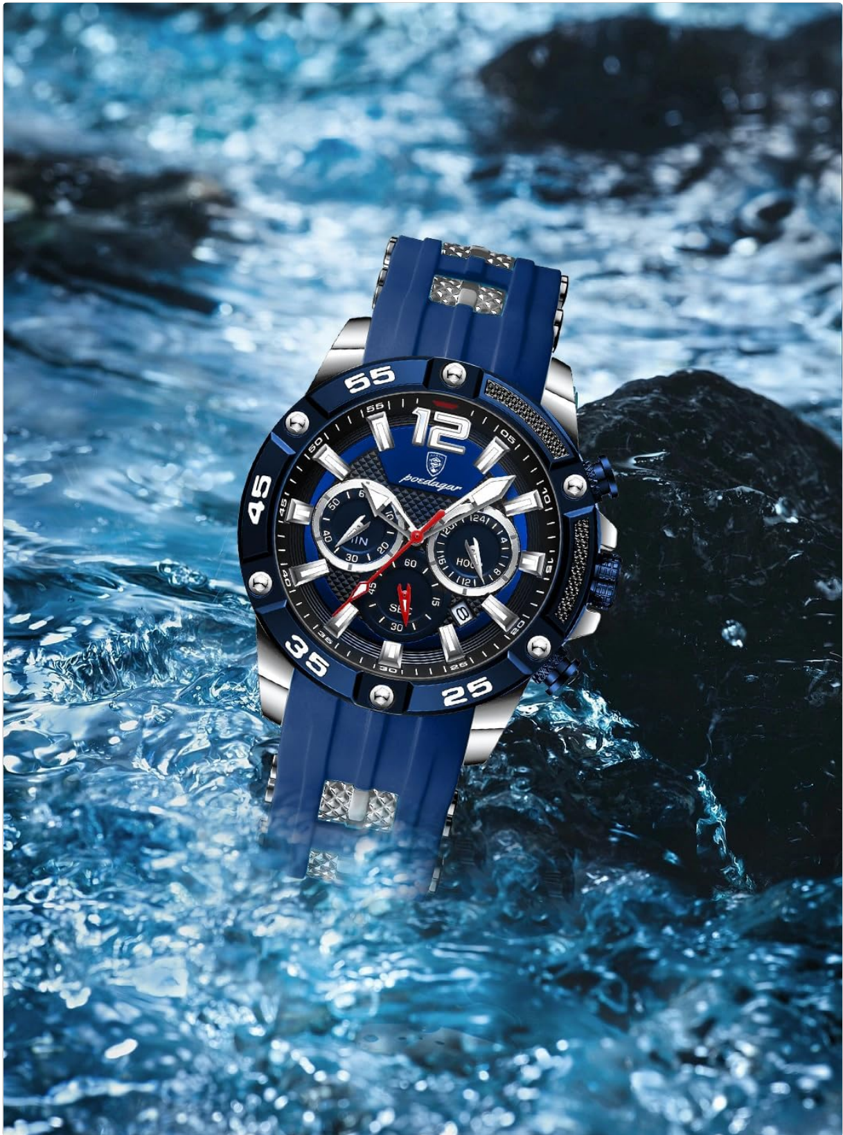
Image: The Gosasa watch in water, demonstrating its water-resistant design.