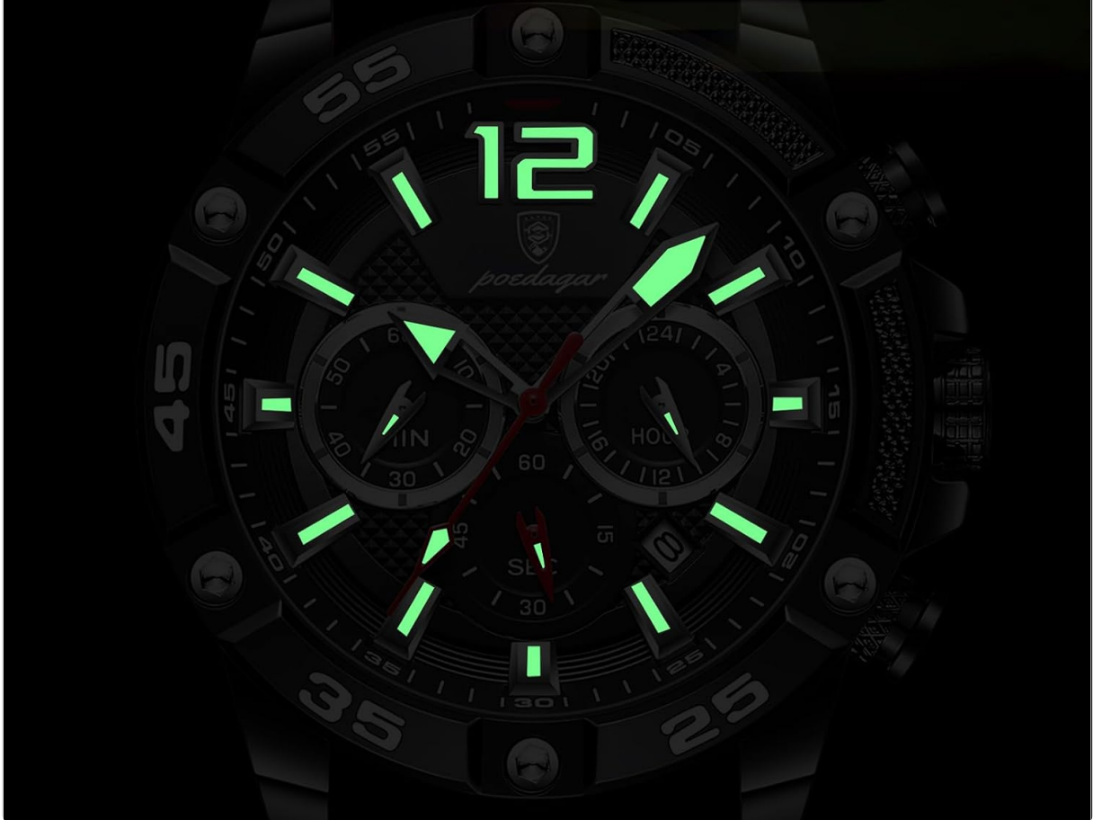
Image: The watch face demonstrating its luminous properties in a dark environment.

Nature light powder absorbs light quickly and emits light at night