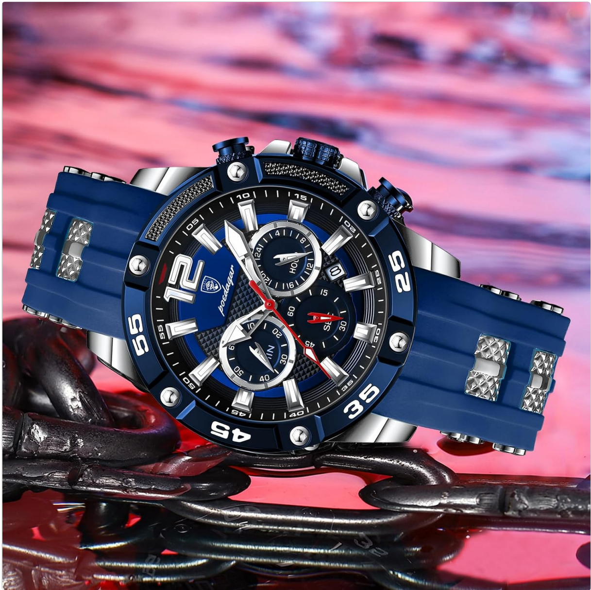
Image: Front view of the Gosasa Chronograph Military Sport Quartz Watch, highlighting its design and features.