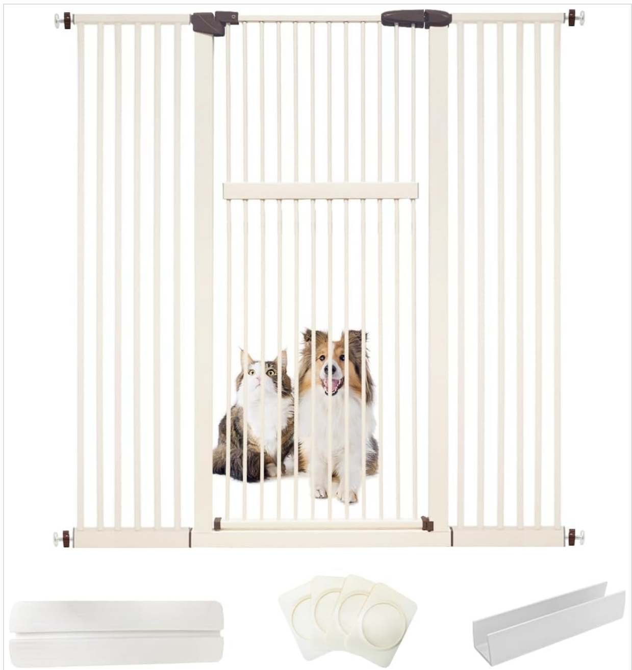
Image: The Lumizone Extra Tall Pet Gate in Cream White, showing the main gate, extension panels, and pressure adjustment bolts. A cat and dog are visible behind the gate.