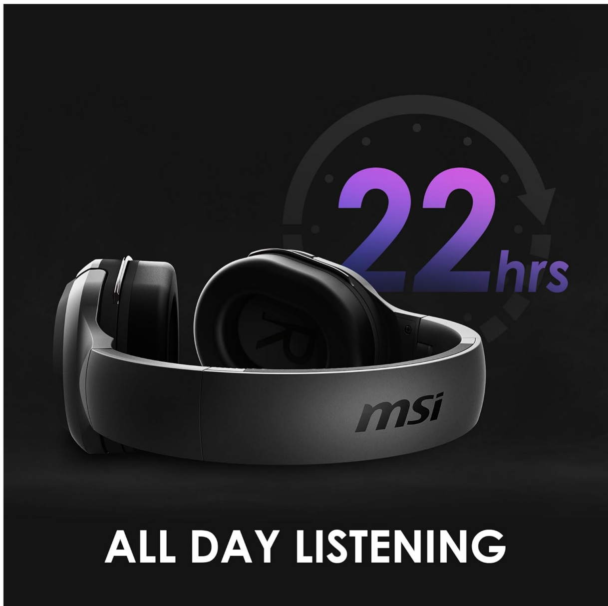
Figure 8: The headset offers up to 22 hours of battery life for all-day listening.