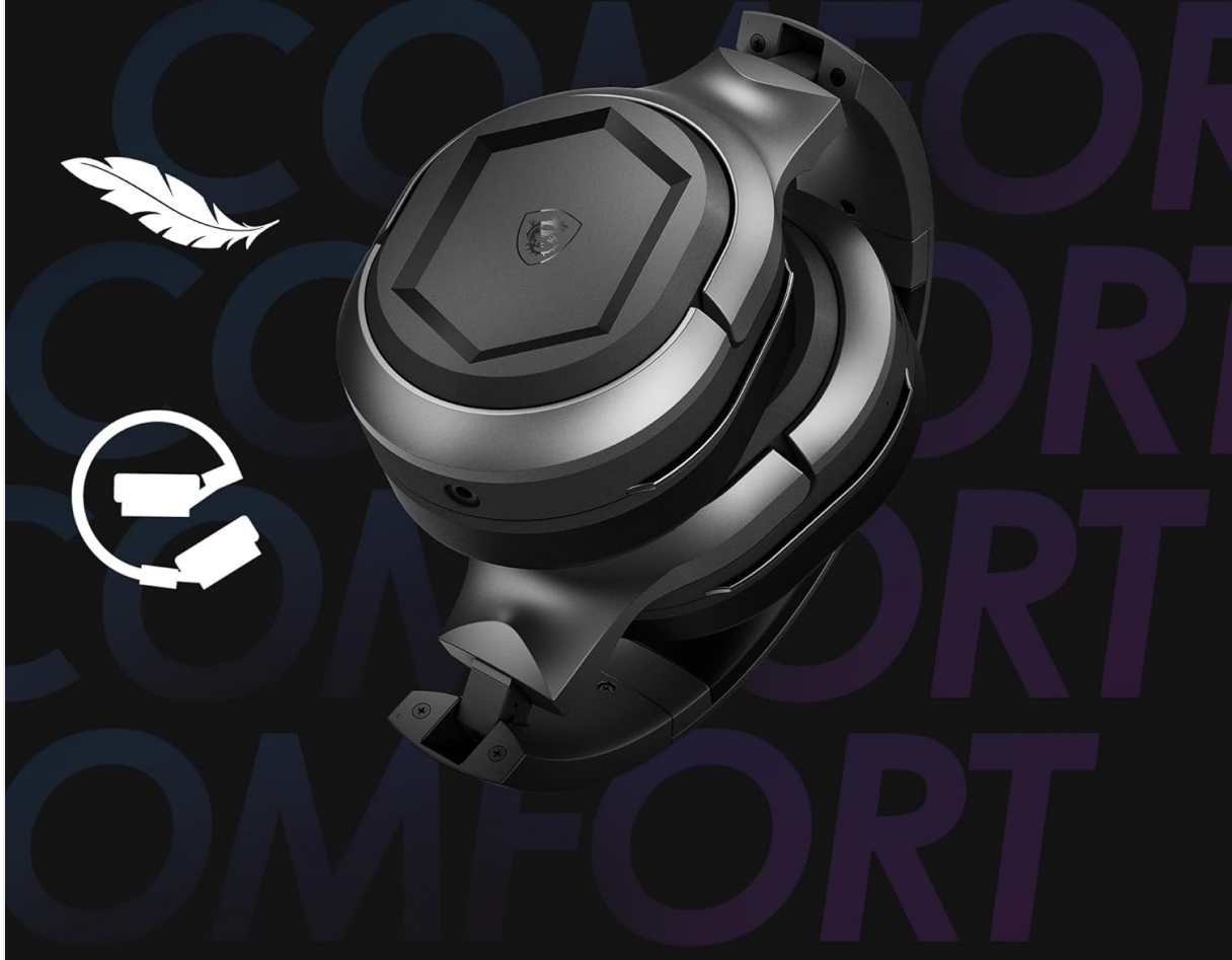
Figure 9: The headset's foldable design for enhanced portability.