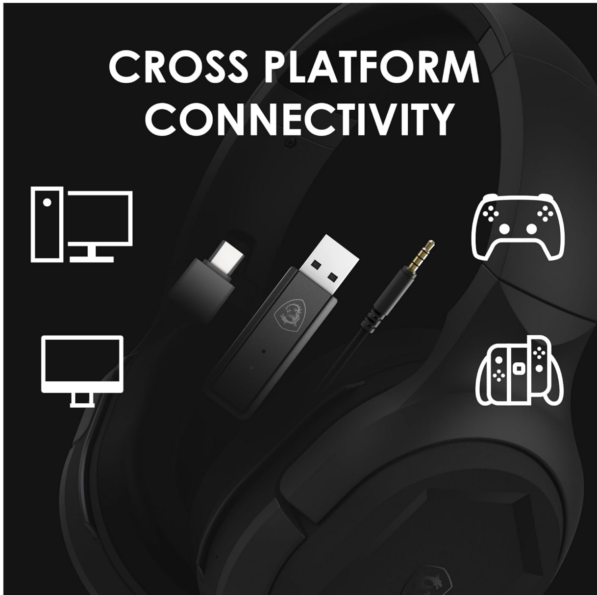
Figure 3: Visual representation of cross-platform connectivity for the headset.