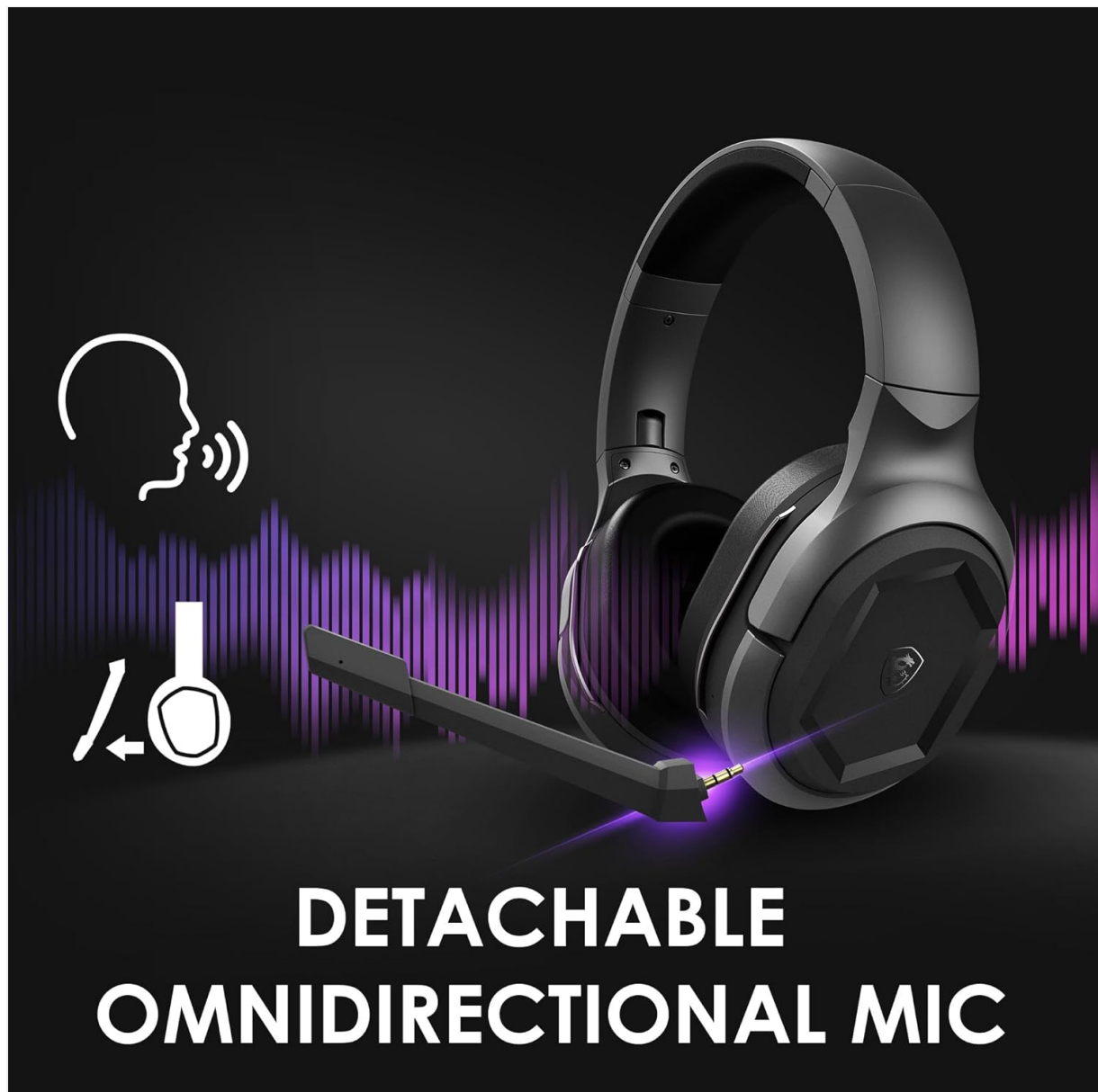
Figure 6: The detachable omnidirectional microphone for clear communication.