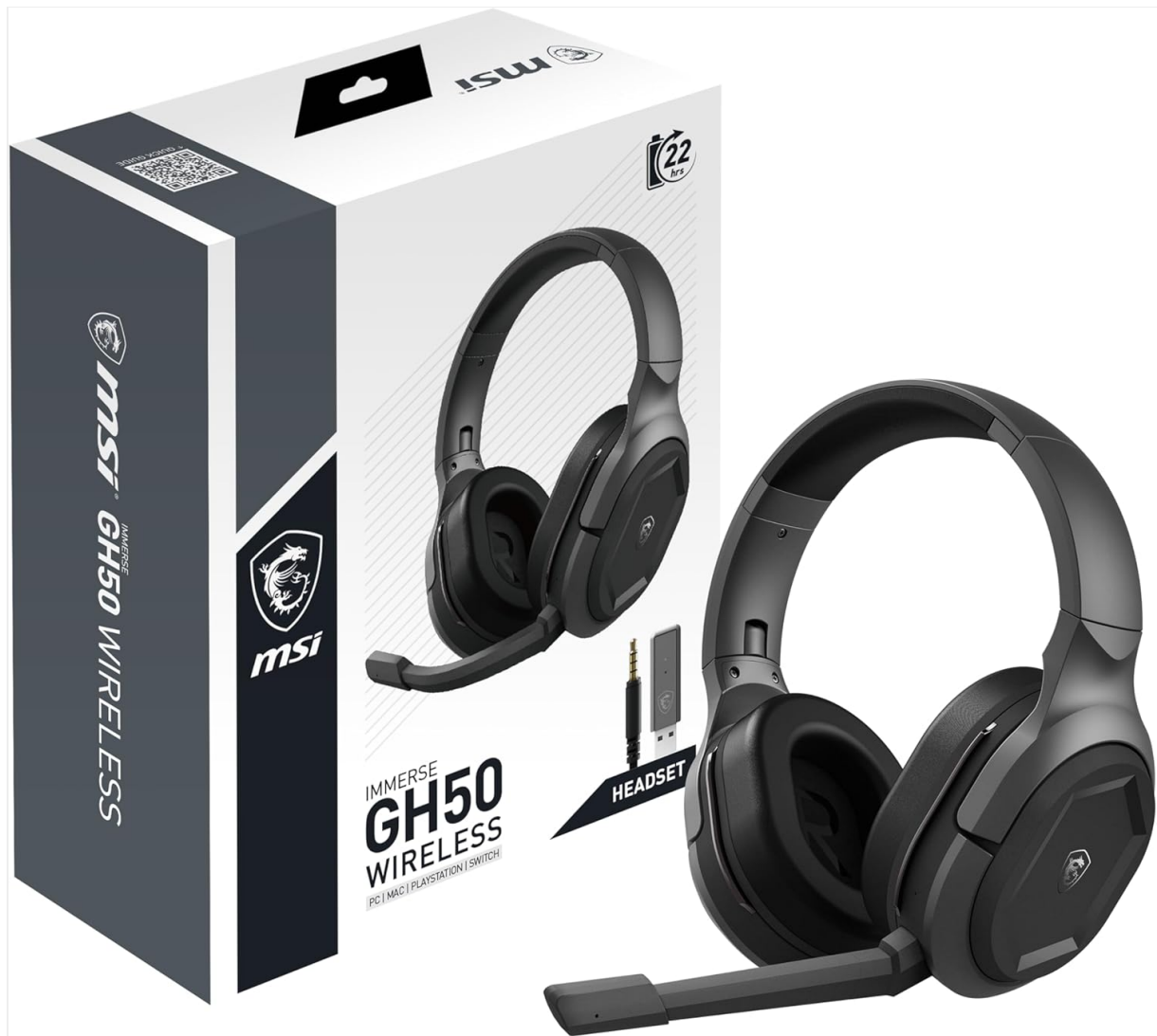
Figure 1: MSI Immerse GH50 Wireless Gaming Headset and its retail packaging.