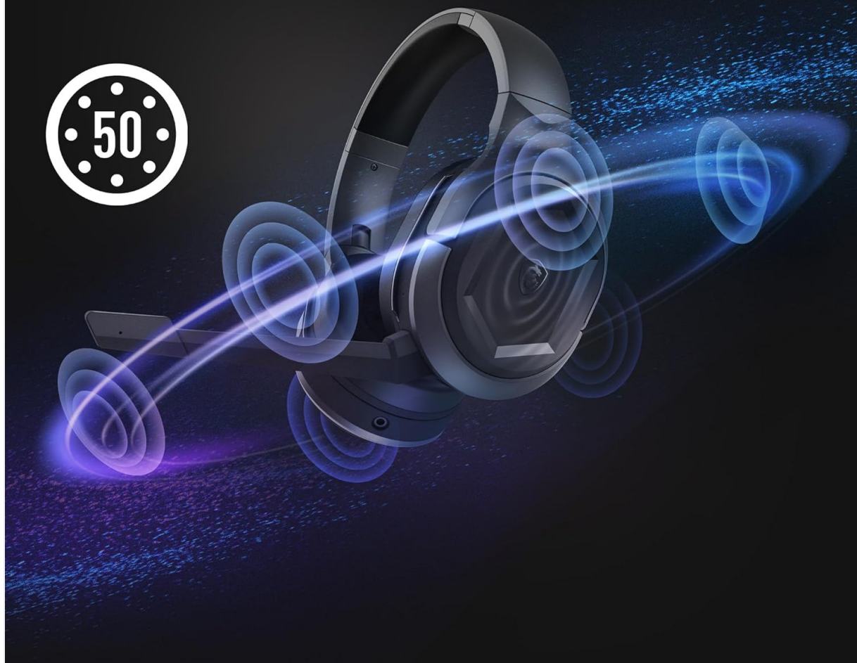
Figure 7: Illustration of the 50mm Neodymium drivers and their sound output.