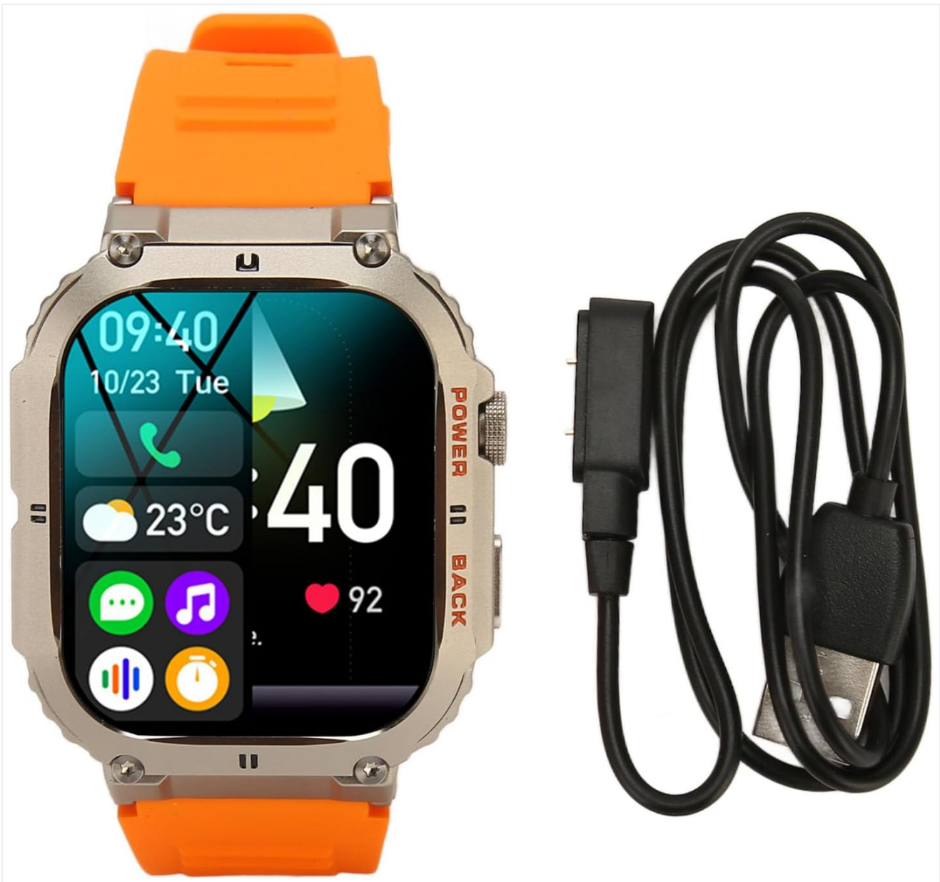
Image: K57pro Smart Watch and its included charging cable.