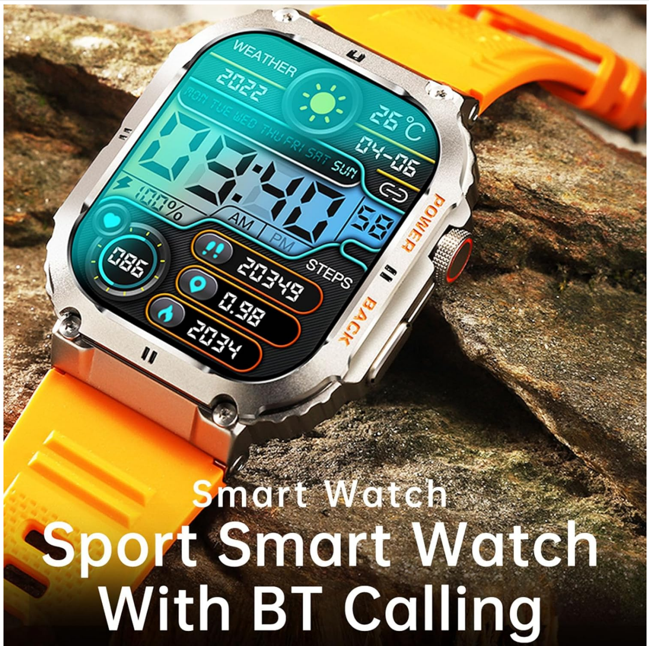
Image: The K57pro Smart Watch showing a display with various sports tracking metrics.