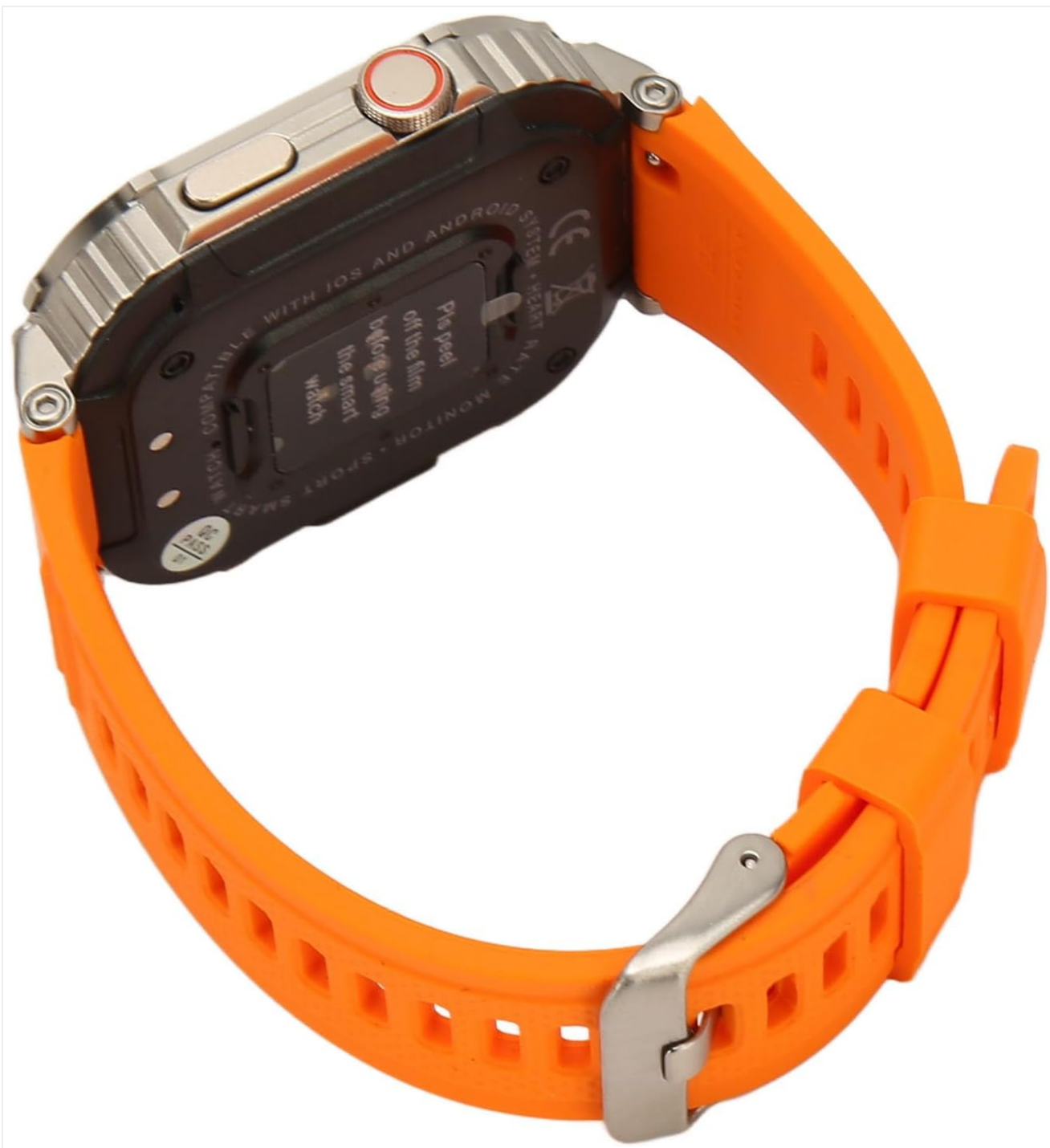
Image: Close-up of the back of the K57pro Smart Watch, showing the charging contacts and sensors.