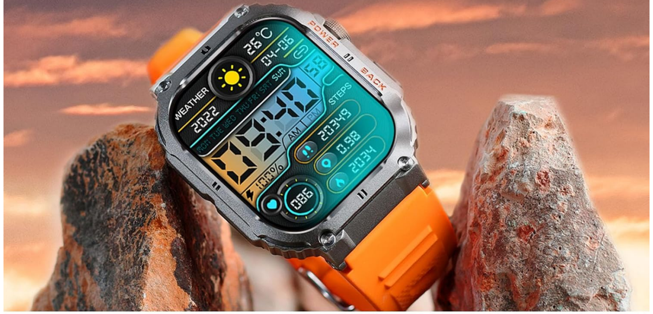
Image: The K57pro Smart Watch positioned on rocks, illustrating its robust and anti-fall design.

Polycarbonate, glass fiber and zinc alloy metal table frame, with the characteristics of high strength and high hardness, long-term use does not degum, does not change color, with excellent waterproof, anti-fall, dust-proof three anti-performance, so that it is still able to use normally even in the harsh dust water immersion environment