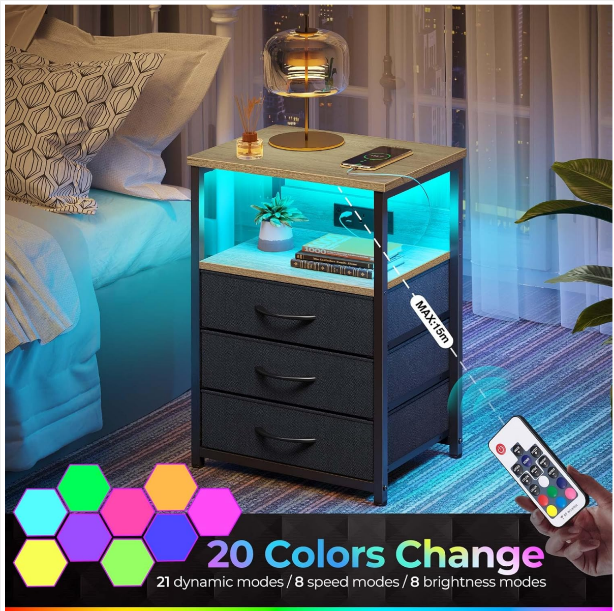
Image: Nightstand illuminated with blue LED light, showing the remote control for color and mode selection.