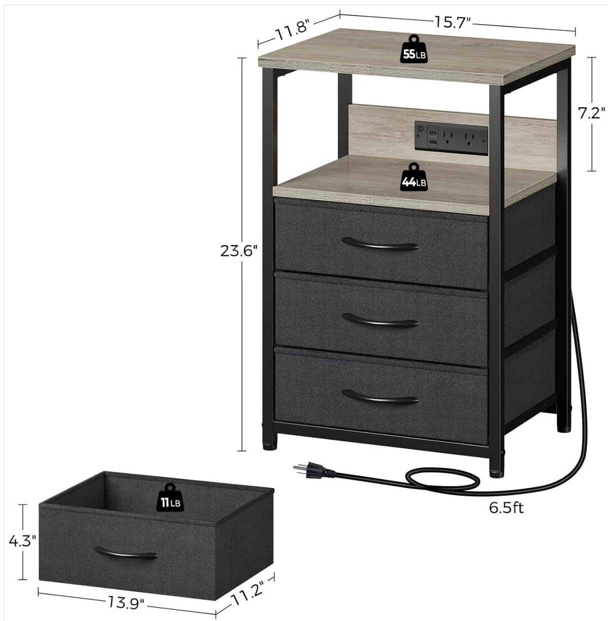
Image: Diagram showing the nightstand's dimensions and the individual components, including the fabric drawer and power cord length.