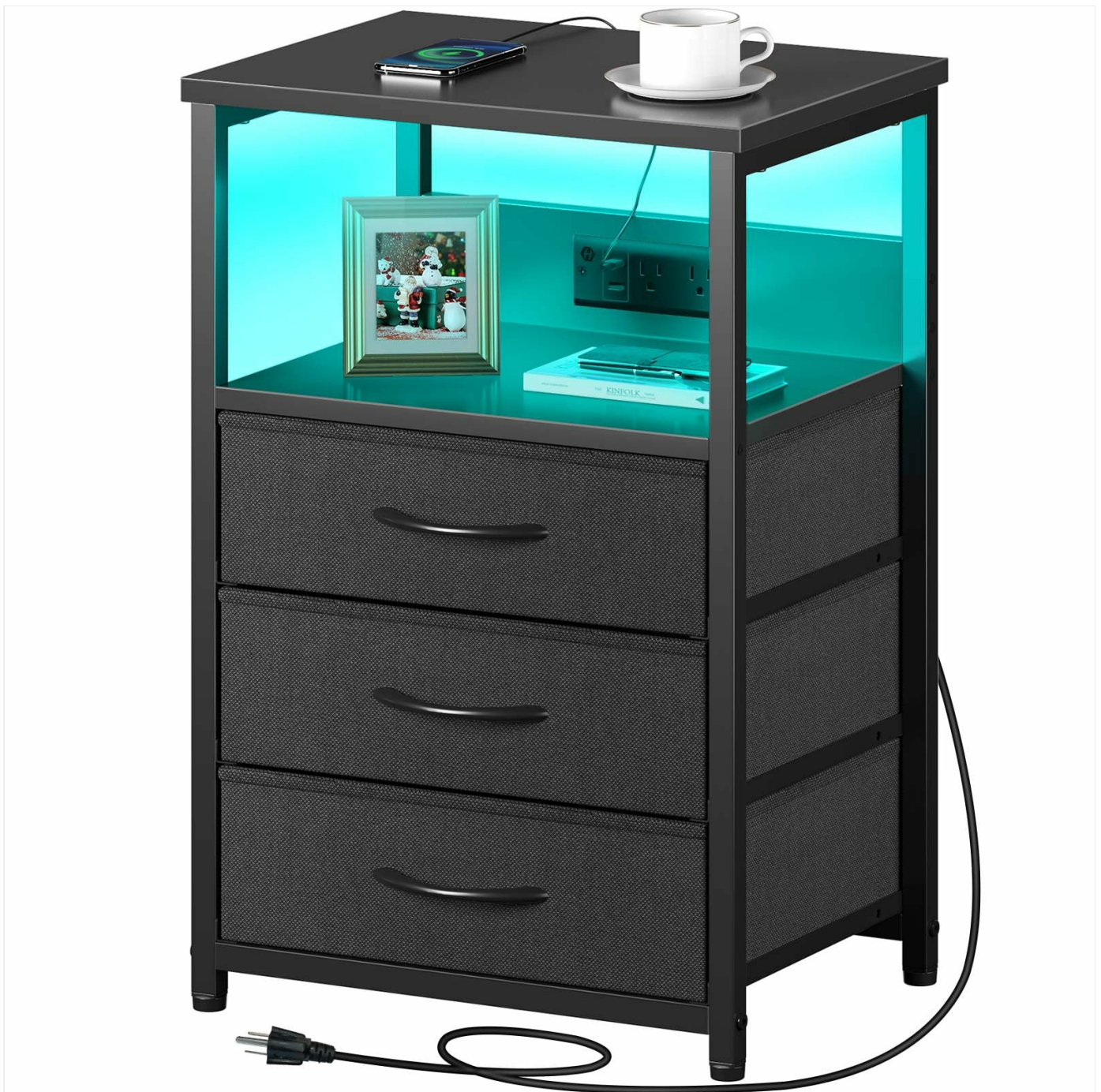
Image: The Seventable ED014 Nightstand, featuring its integrated LED lighting and charging station, positioned next to a bed.