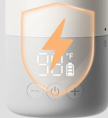
Image: The portable milk warmer connected to a Type-C charging cable, illustrating the charging process.