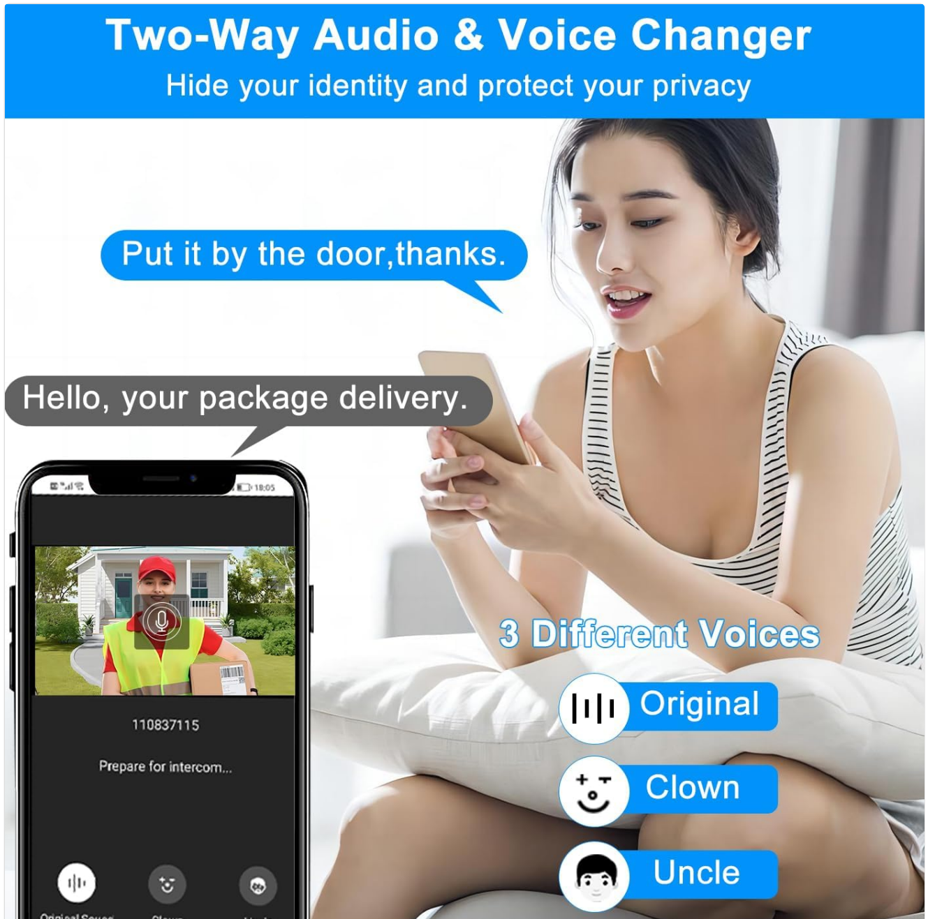
Image: Illustration of the two-way audio and voice changer function, showing a user interacting with a delivery person via the app.

Engage in real-time conversations with visitors using the built-in speaker and microphone. The voice changer feature allows you to alter your voice for privacy.