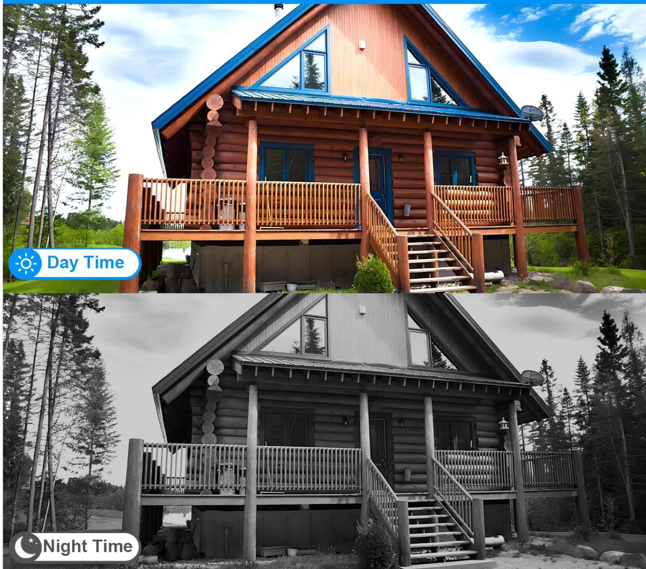
Image: Comparison of day and night vision capabilities of the doorbell camera, showing clear images in both conditions.

This image demonstrates the doorbell's 1080P Full HD and IR Night Vision. It shows a split view of a house, with one side displaying a clear, colorful daytime image and the other a sharp, black-and-white night vision image, highlighting the camera's ability to capture details in low light.