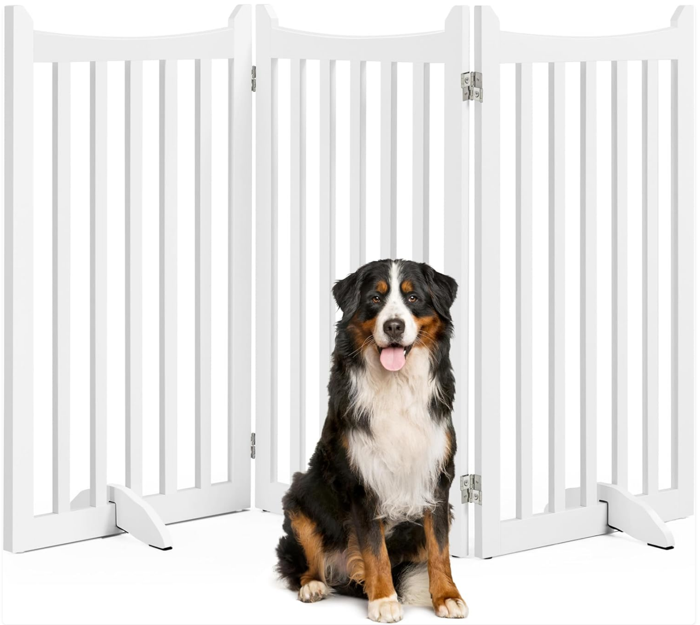
Image: The Yaheetech 3-Panel Freestanding Wooden Dog Gate in white, with a Bernese Mountain Dog sitting in front, showcasing its elegant design and functionality.