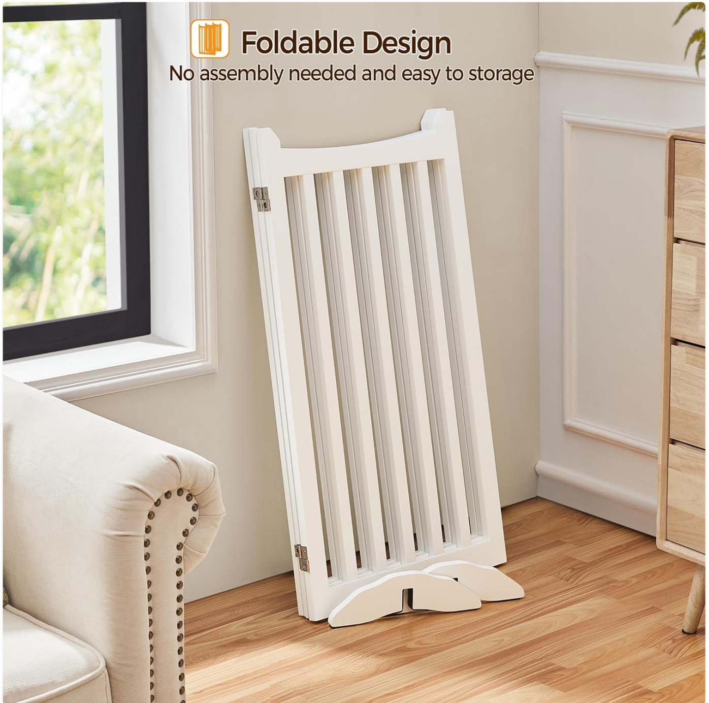
Image: The gate's foldable design allows for easy storage when not in use.