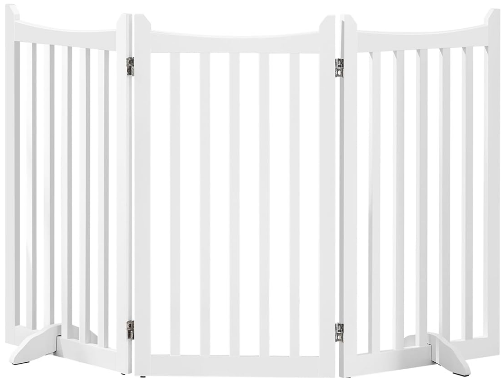
Image: Detailed view highlighting the gate's features, including its sturdy construction, flexible hinges, and anti-slip support feet.