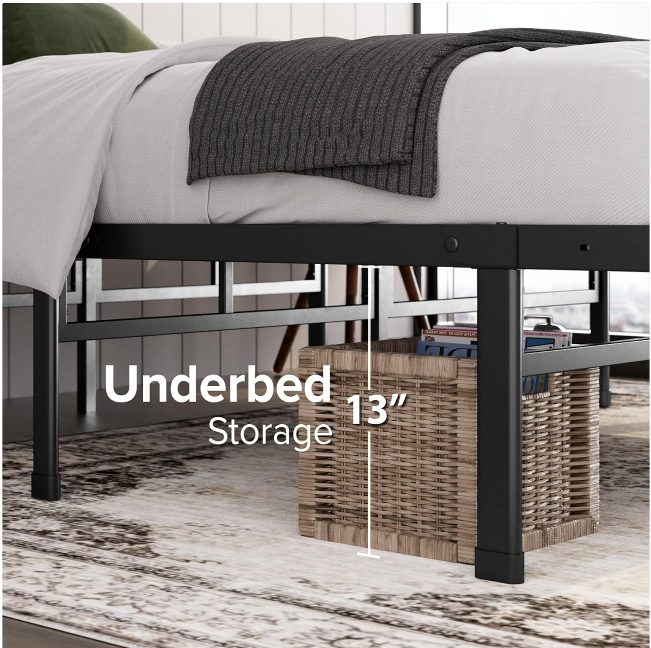
Figure 6: Product dimensions (75"L x 54"W x 14"H for Full size) and a maximum weight capacity of 1500 lbs.