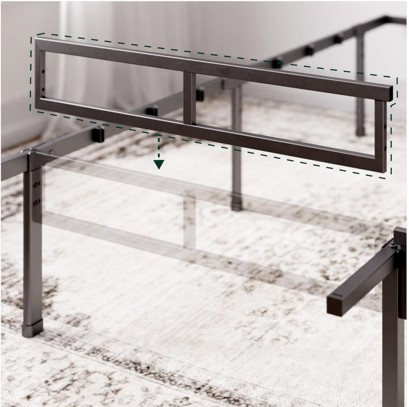
Figure 3: Visual guide illustrating the easy three-step assembly process for the foundation.