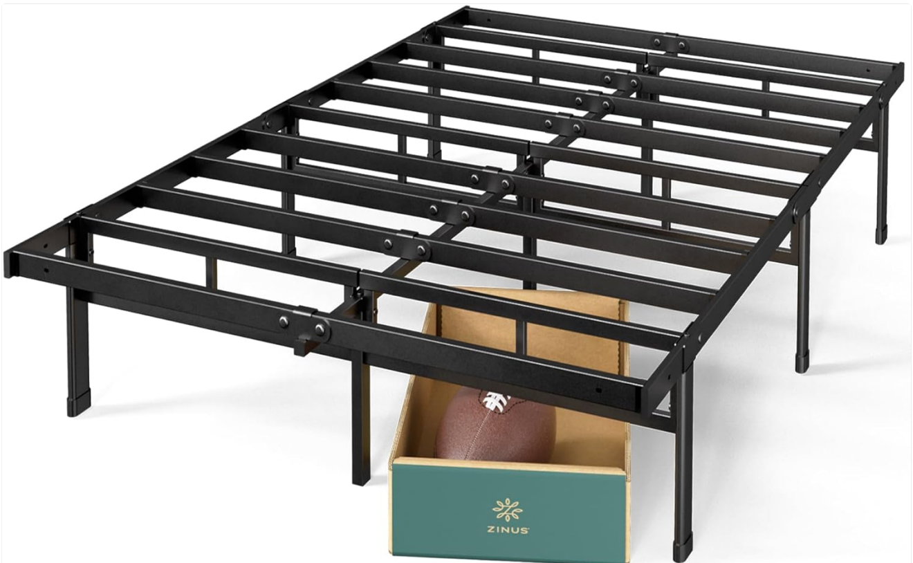
Figure 1: ZINUS Justin 14 Inch Easy to Assemble Mattress Foundation, showcasing its steel frame and under-bed storage potential.

The ZINUS Justin 14 Inch Easy to Assemble Mattress Foundation provides a durable, fully-steel framework with supportive slats, designed for dependable mattress support. Its robust construction includes multiple sturdy legs with plastic caps to protect flooring. This foundation offers 13 inches of under-bed clearance, providing ample storage space. It is engineered for easy assembly and long-lasting use.