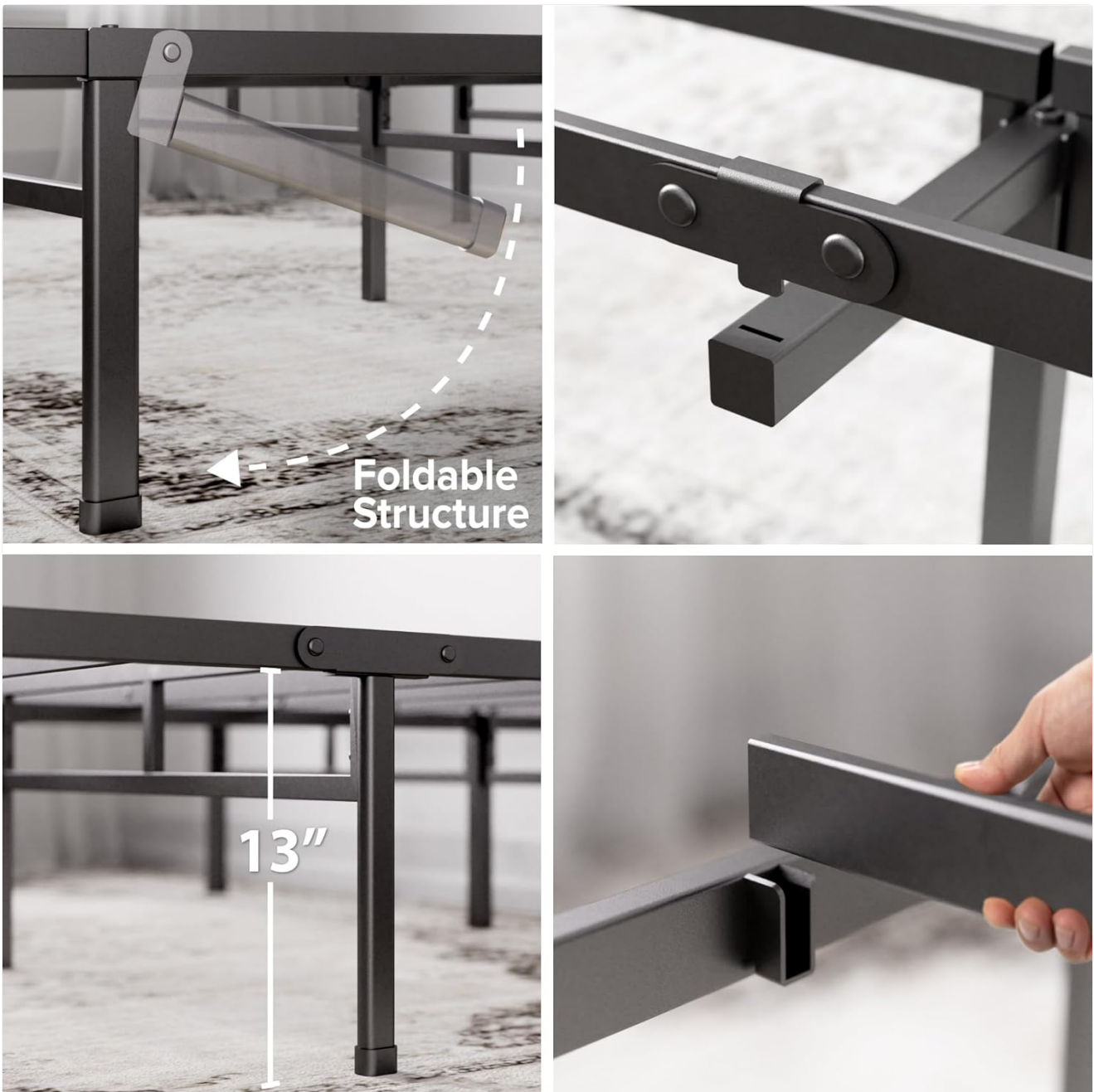
Figure 4: Detailed view of the foldable structure, secure connections, and recessed legs with floor protection caps.