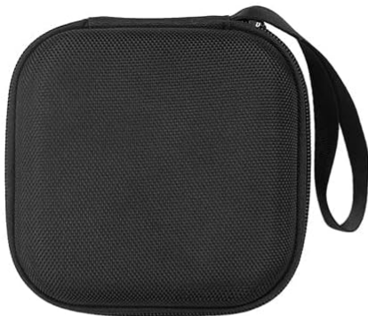
Portable Carry Case*1