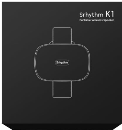
Gift Box Packing*1