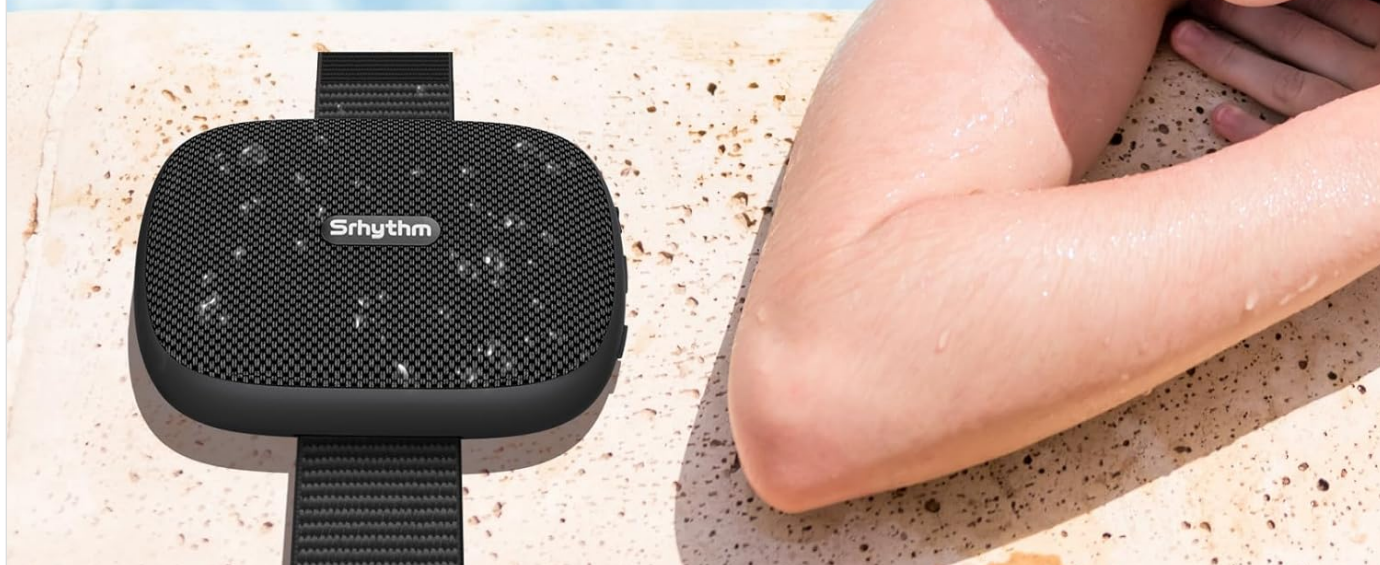
Image: The Srhythm K1 speaker demonstrating its IPX7 waterproof capability.

Enjoy the music without worries even when you are in the pool