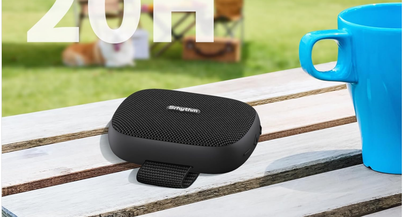
Image: The Srhythm K1 speaker highlighting its 20-hour battery life.