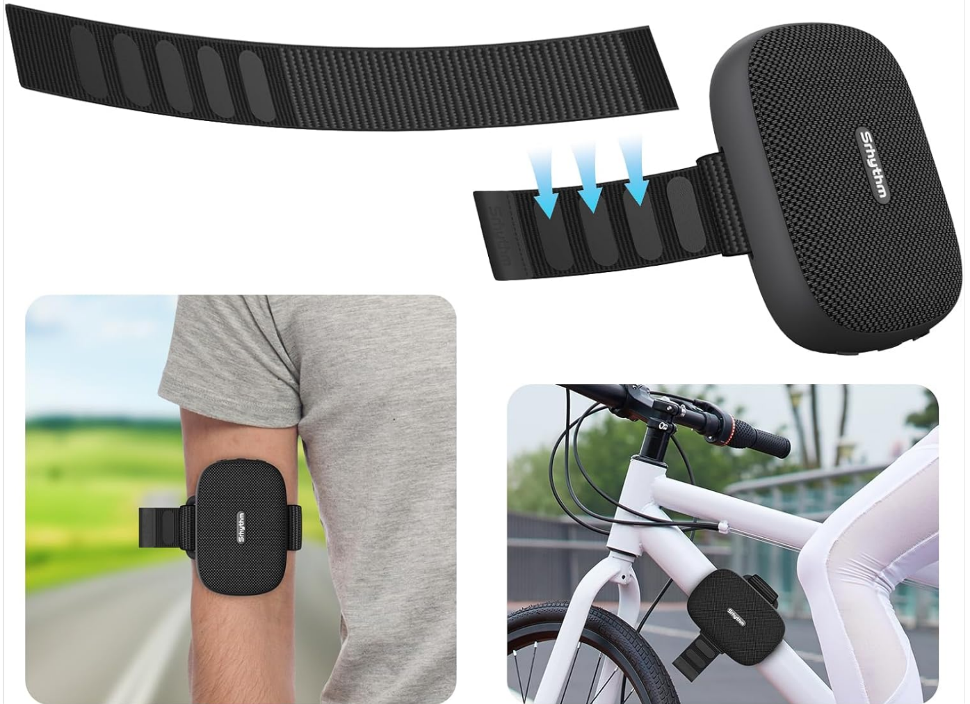
Image: Detailed view of the adjustable wrist strap and how it attaches to the speaker.

Comes with an extender velcro strap,wrap it around your arm, backpack,or bike handlebar conveniently.