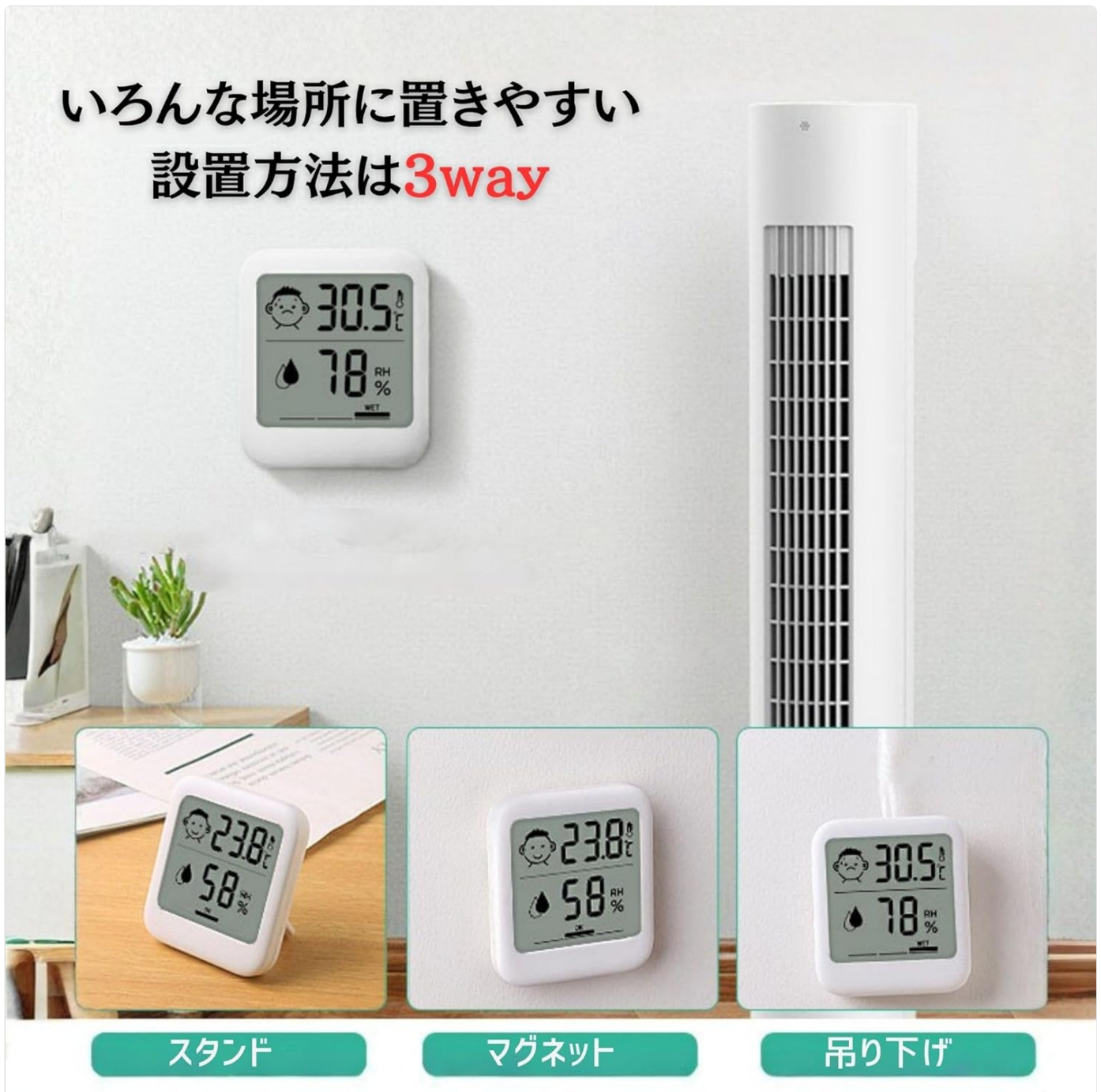
Image: Illustration of the three placement methods: using the stand, magnetic attachment, and hanging from a hook.