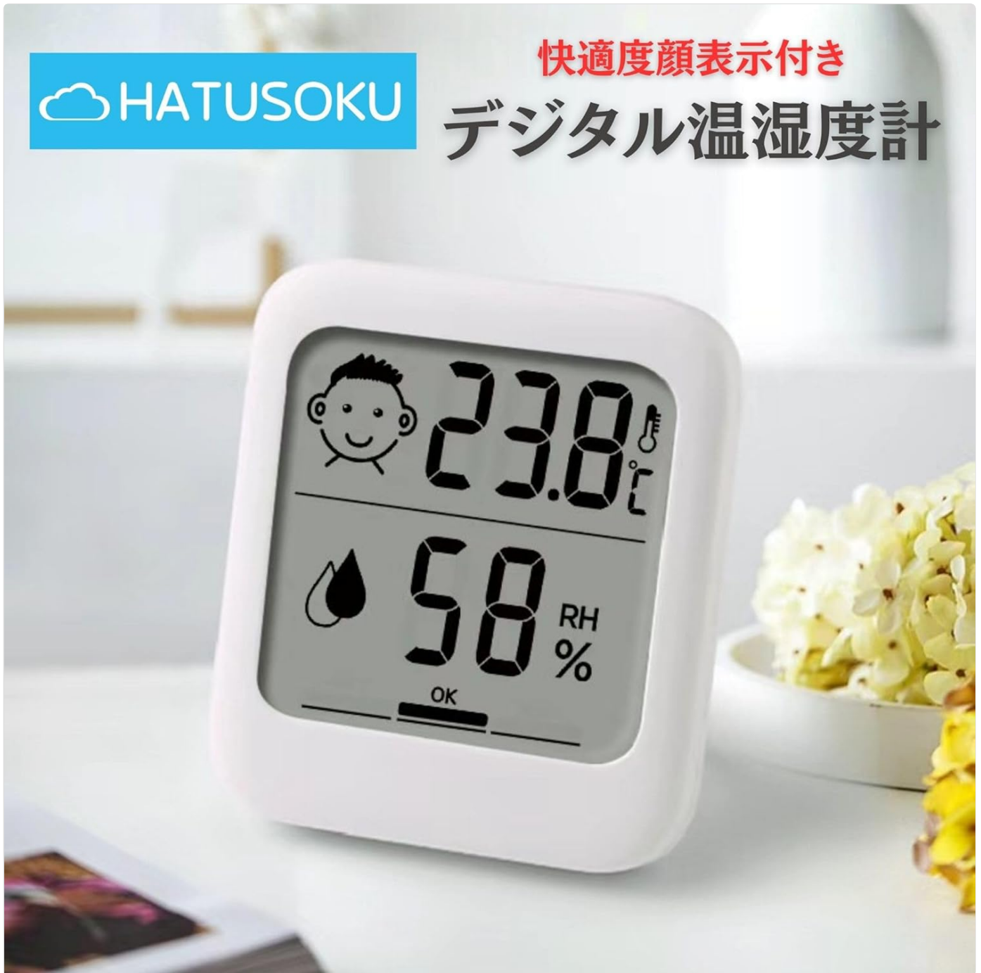
Image: Front display showing temperature, humidity, and the comfort level icon.