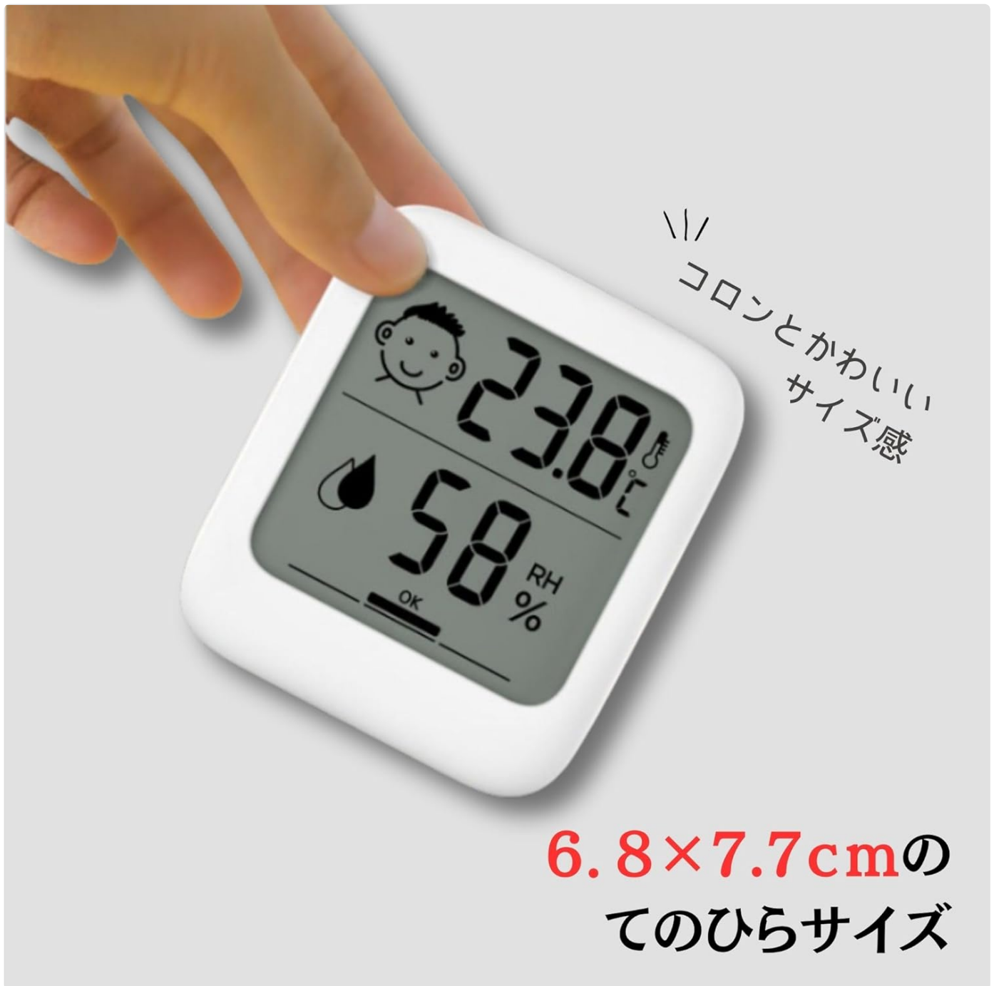
Image: The HATUSOKU Digital Thermometer Hygrometer held in a hand, illustrating its compact and palm-sized dimensions (6.8 x 7.7 cm).