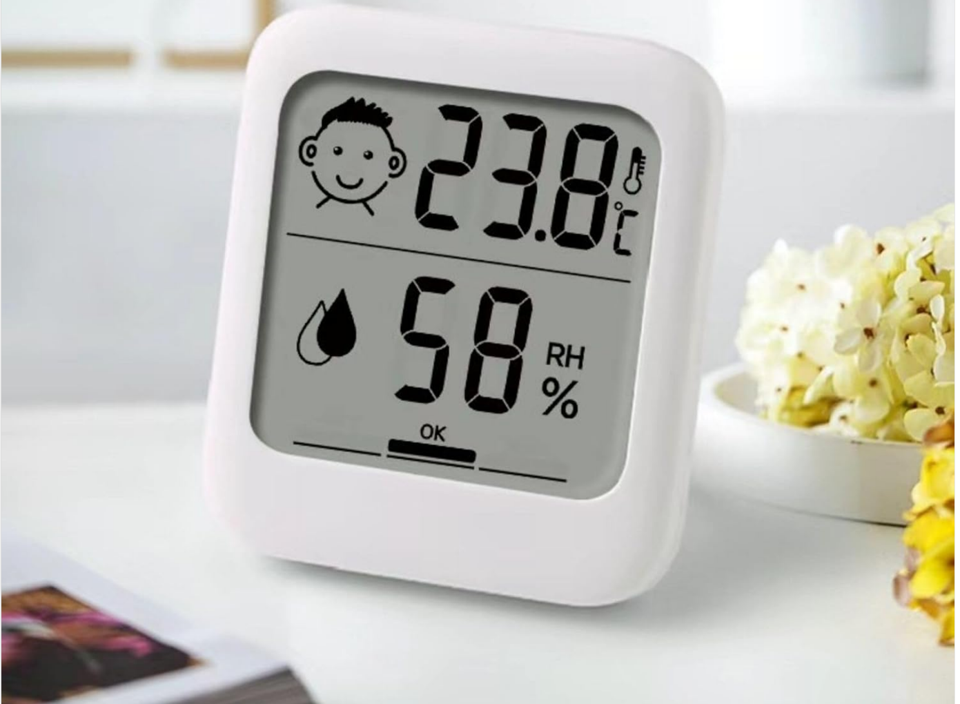
Image: Front view of the HATUSOKU Digital Thermometer Hygrometer showing temperature and humidity readings with a comfort level icon.

Your browser does not support the video tag.