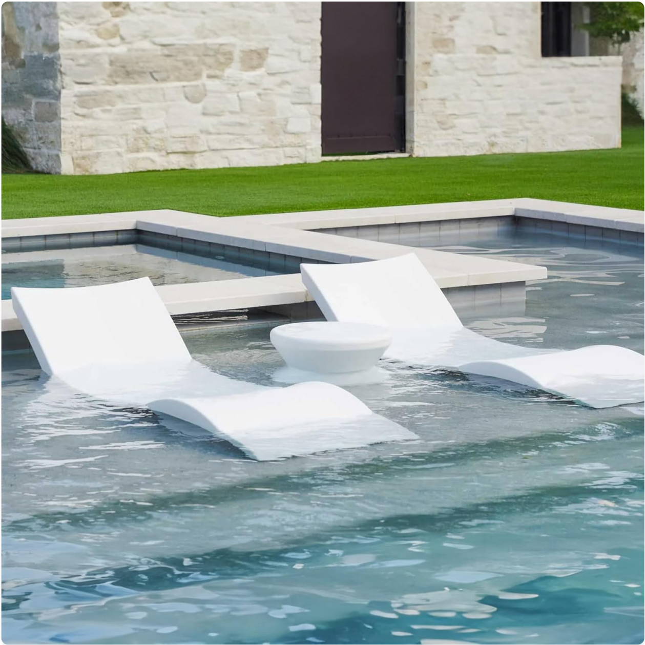
Image: Two white Ledge Lounger Signature Chaises and a matching side table positioned on a pool's sun shelf, partially submerged in clear blue water.