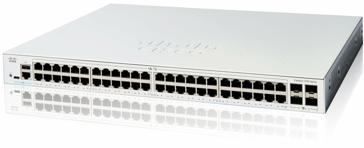
Image: Various models of the Cisco Catalyst 1200 Series Smart Switches, showcasing different port configurations.