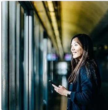
Image: A person interacting with the Cisco Business mobile app on a smartphone, demonstrating the ease of network management.