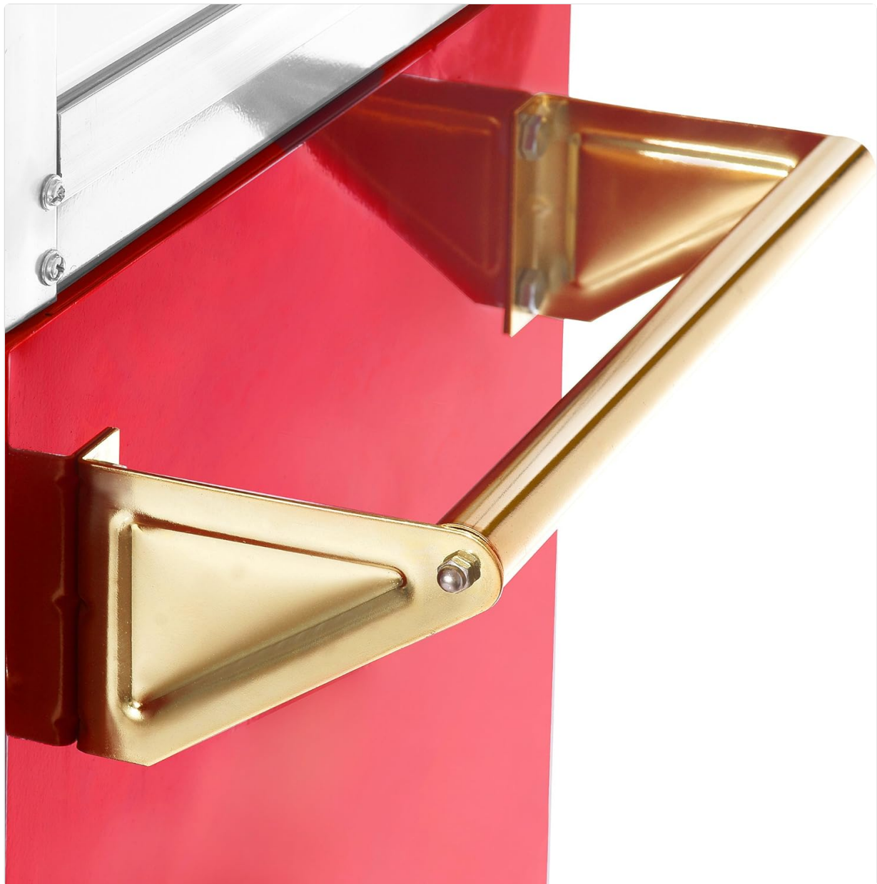
Figure 4.2: Detail of the working platform shelf.