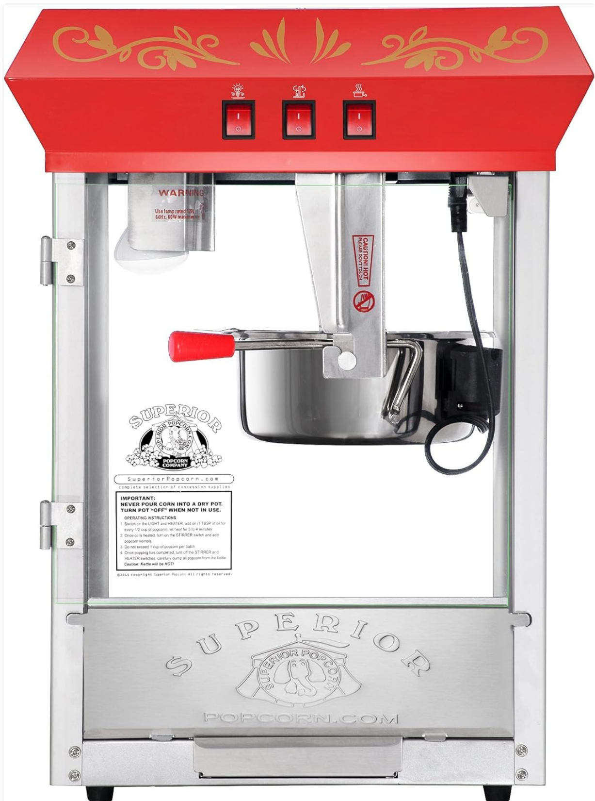
Figure 2.1: Front view of the popcorn machine.