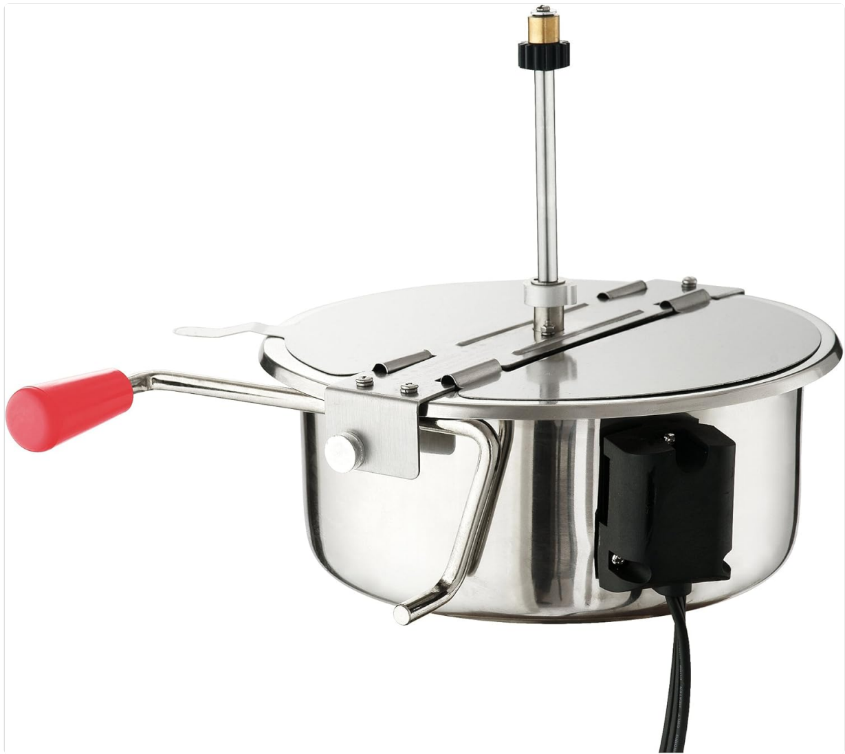
Figure 5.1: The 8oz stainless steel kettle.