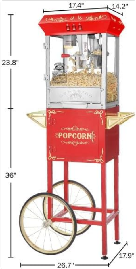
Figure 8.1: Product dimensions.