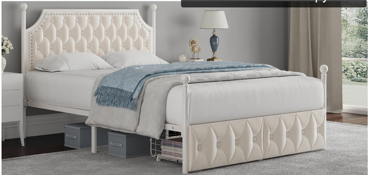
Image: The Keyluv bed frame demonstrating its two-purpose design, showing how the canopy posts can be attached for a canopy bed or removed for a standard platform bed.

The canopy posts are detachable, allowing you to convert the bed frame between a four-poster canopy bed and a standard platform bed according to your preference.