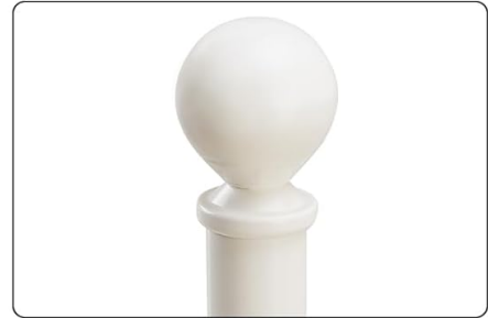
White Ball Design