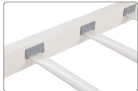
Easy to Assemble and Stable

Image: Exploded view highlighting key design features: anti-slip foam tape on slats for noise reduction, the decorative white ball finials on the posts, and plastic silent clips for securing metal slats.