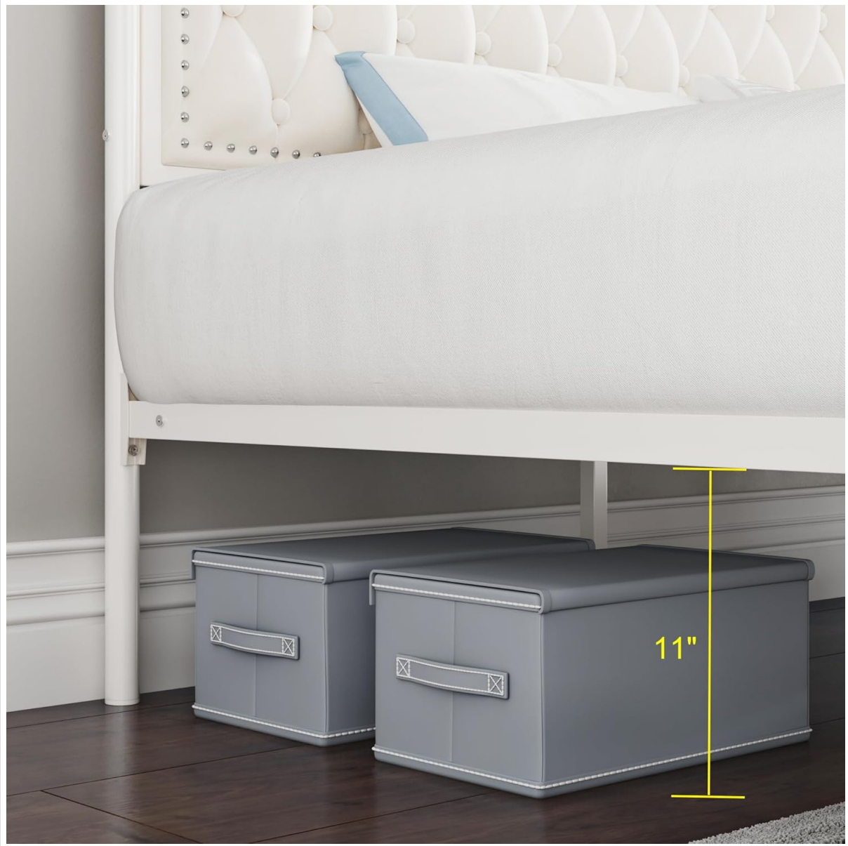
Image: A view under the bed frame, illustrating the 11-inch clearance, which allows for additional storage space and easy access for robot vacuums.

The 11-inch clearance under the bed provides ample space for additional storage solutions and facilitates easy cleaning, including convenient access for robot vacuums.