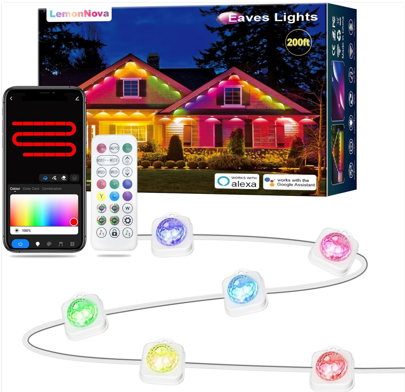
Image: Overview of the LemonNova Permanent Outdoor Lights, including the packaging, remote control, and individual light units.