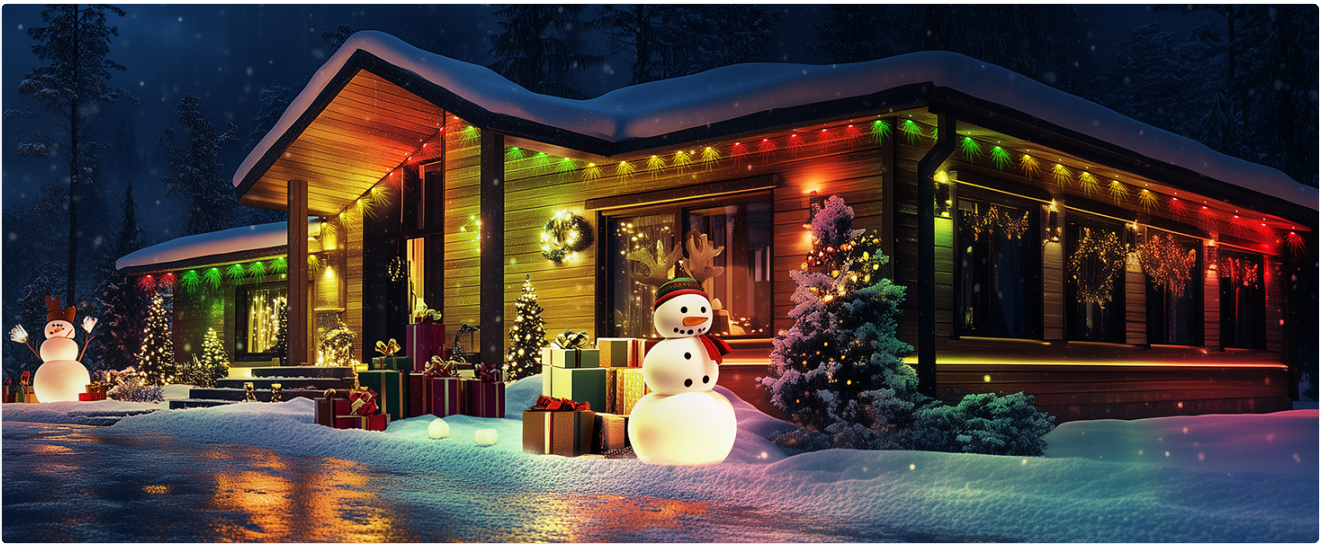
Image: Illustration highlighting the compatibility of the lights with various house materials for effortless DIY setup.