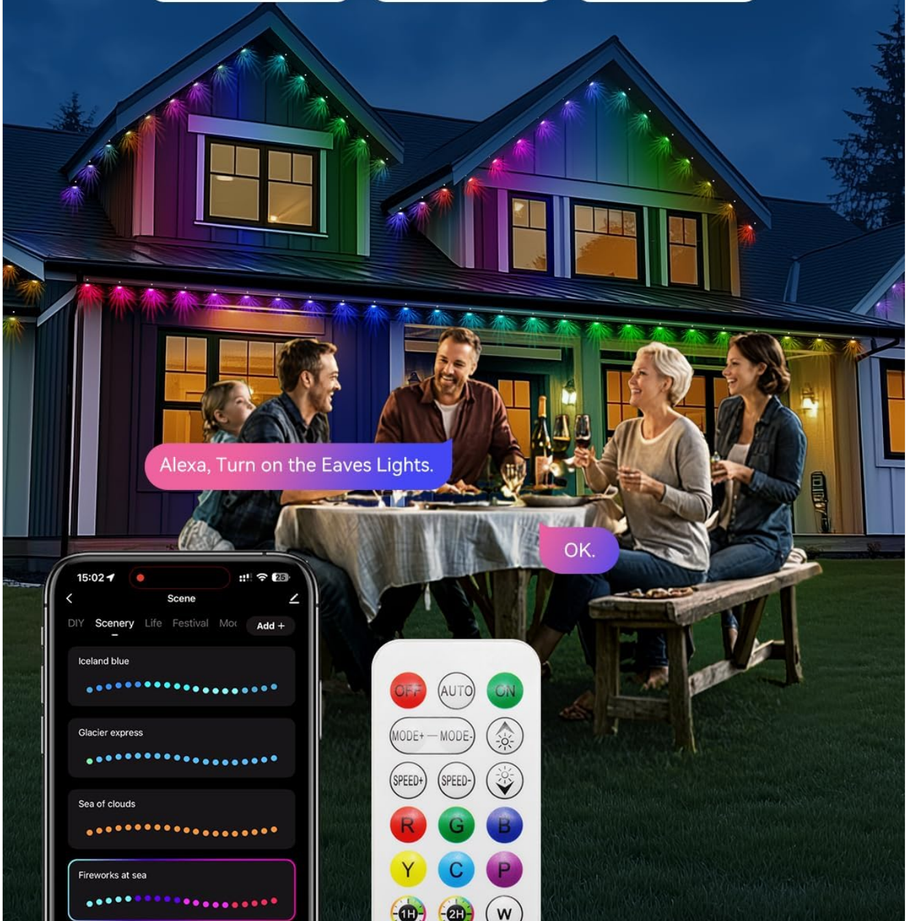
Image: Smart App and Voice Control in action, showing a family enjoying the lights controlled by a smartphone and voice assistant.