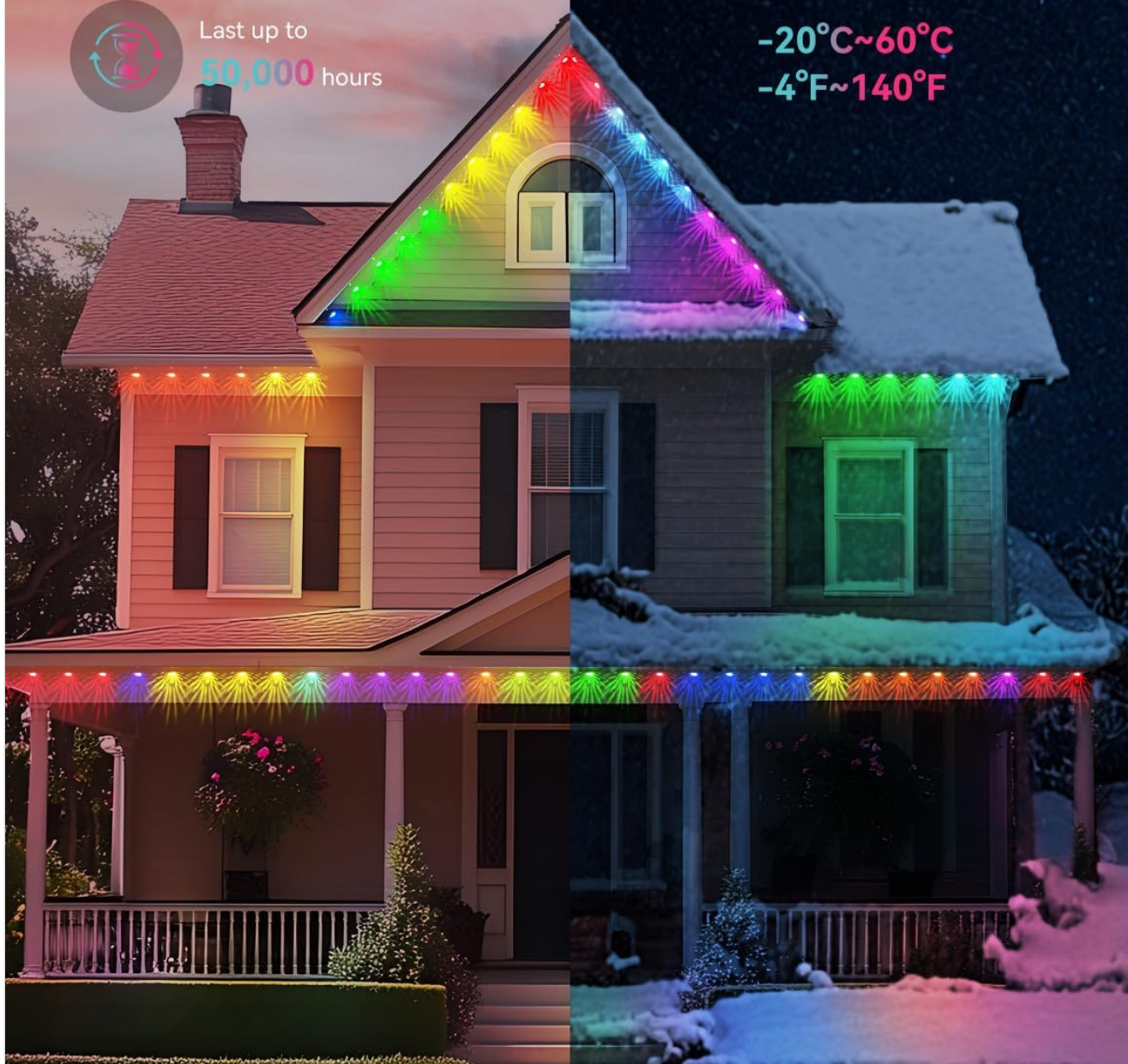
Image: Illustration of the lights' durability, showcasing their performance in both summer and winter conditions.