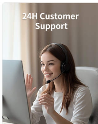
Image: LemonNova's 24-hour customer support is available to assist you.