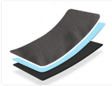
Image 2.1: Illustration detailing the three-layer protection system of the Lictin pad.