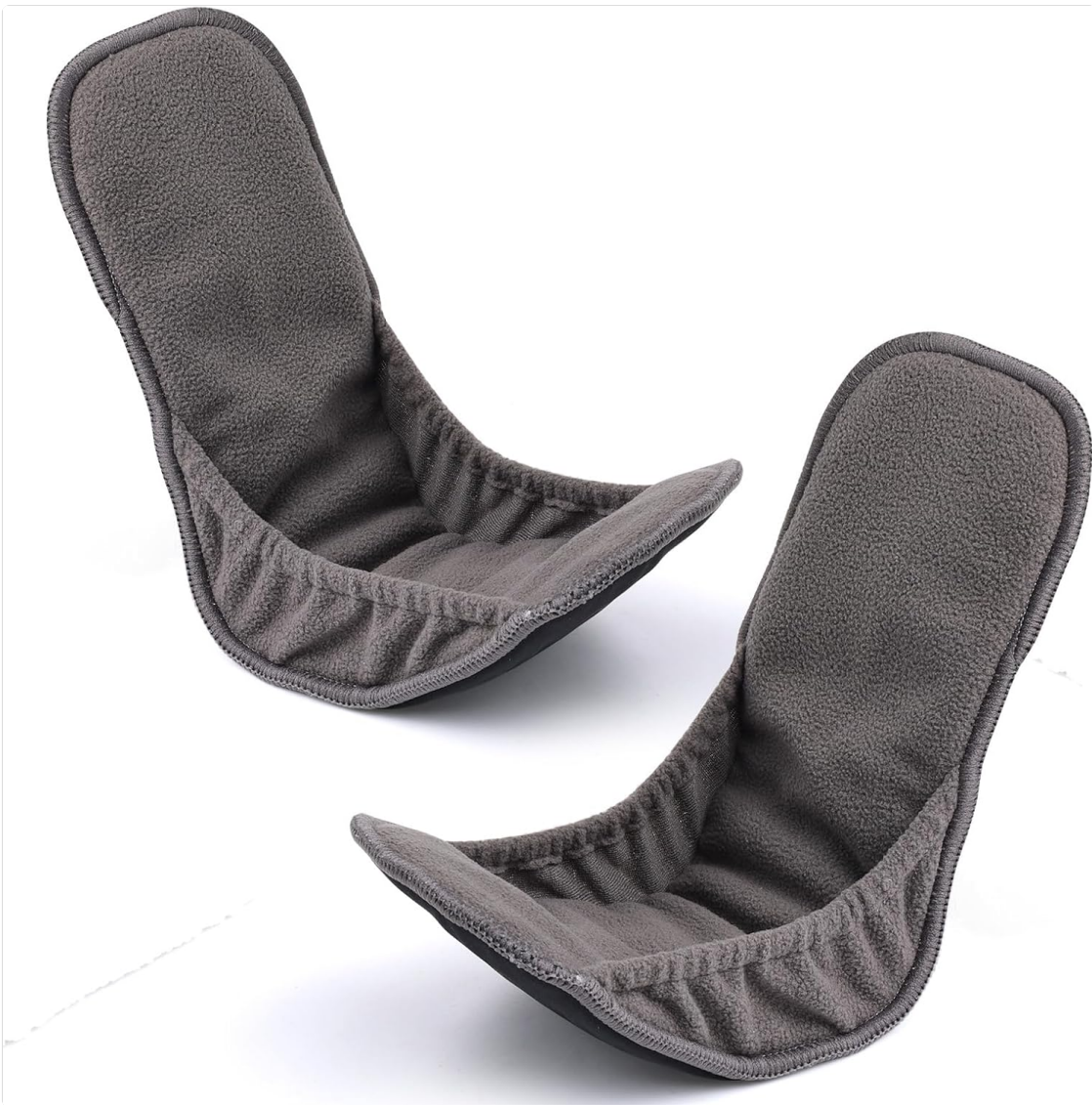
Image 1.1: Two Lictin Reusable Incontinence Pads for Men, showcasing their ergonomic design.