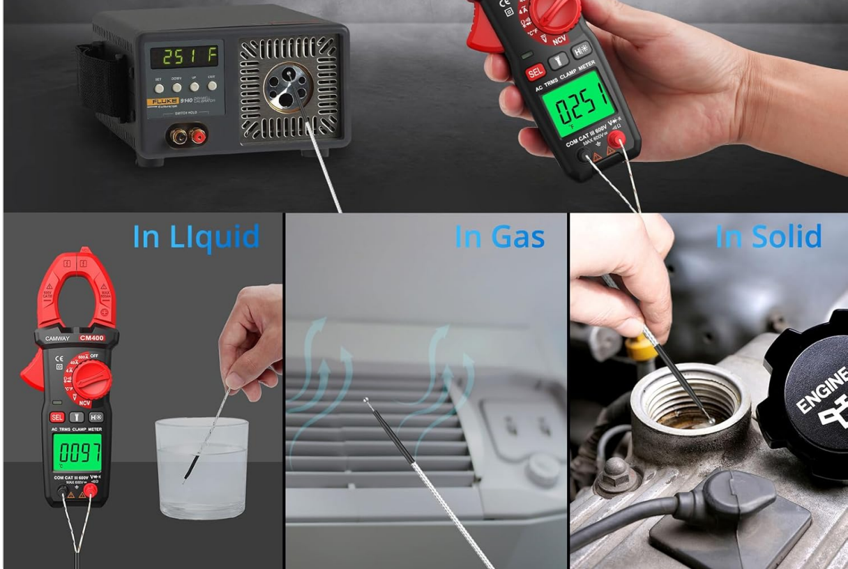
Image: The CAMWAY Digital Clamp Meter connected to a K-type thermocouple, demonstrating temperature measurement in various applications such as liquid, gas, and solid materials.