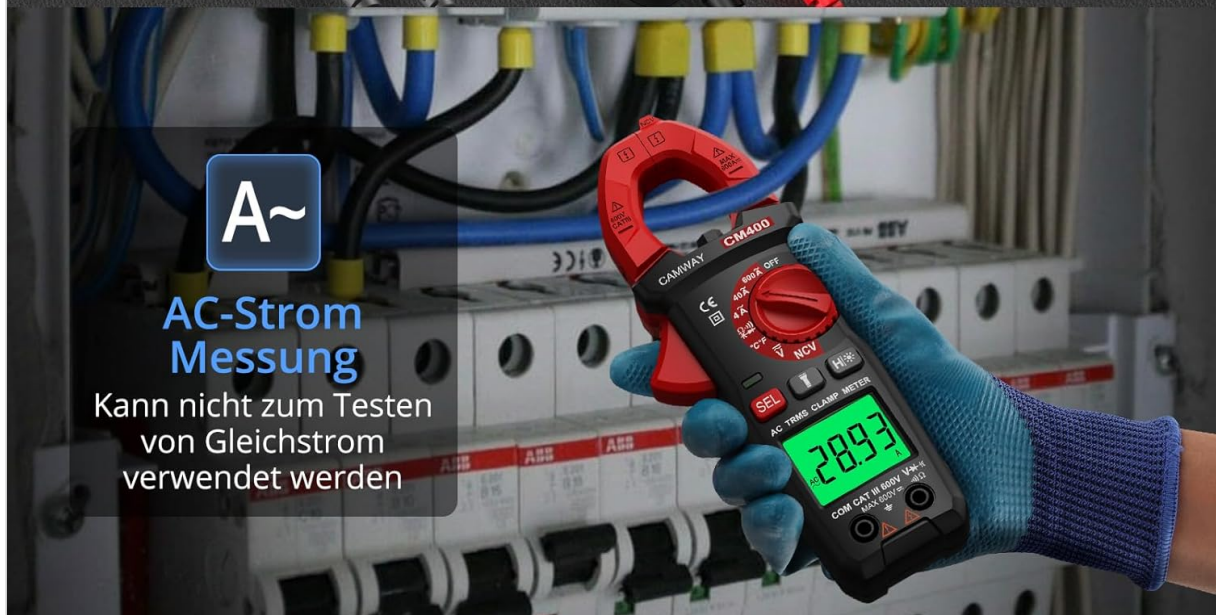
Image: The CAMWAY Digital Clamp Meter displaying an AC voltage reading while test leads are inserted into a wall outlet, and a separate image showing the clamp measuring AC current on a wire.