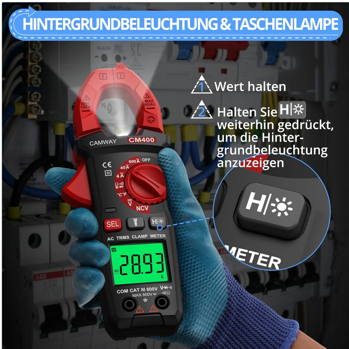
Image: The CAMWAY Digital Clamp Meter with its large backlit LCD screen displaying a reading and the built-in flashlight illuminated, demonstrating its utility in dark environments.