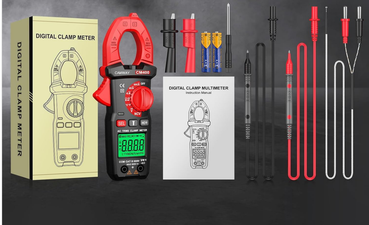
Image: Contents of the CAMWAY Digital Clamp Meter package, showing the meter, red and black test leads, a K-type thermocouple, two AAA batteries, the user manual, a soft zippered pouch, and a small screwdriver.