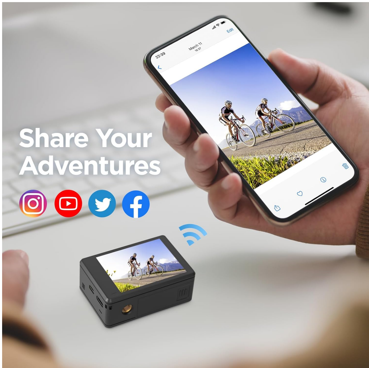
Image: A person holding a smartphone displaying images and videos captured by the action camera, illustrating the Wi-Fi and app control feature for sharing adventures.