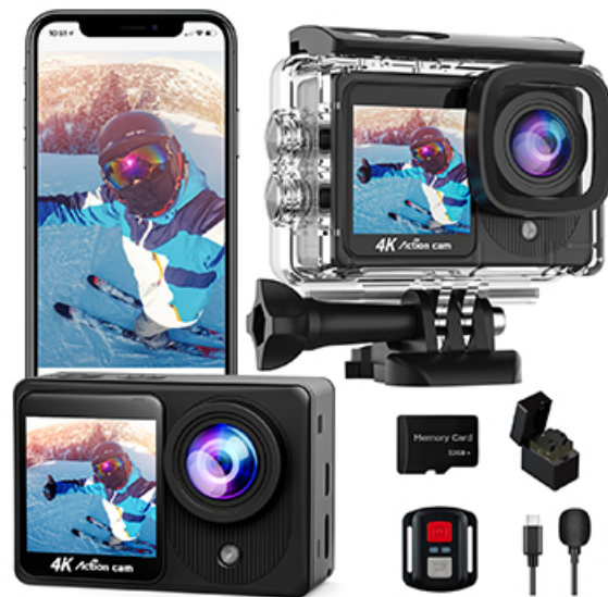
Image: The Yolansin Action Camera with an external microphone plugged into its port, indicating enhanced audio recording capability.

Connect the included external microphone to improve audio quality. Note that the external microphone cannot be used simultaneously with the waterproof case due to the case's sealed design.