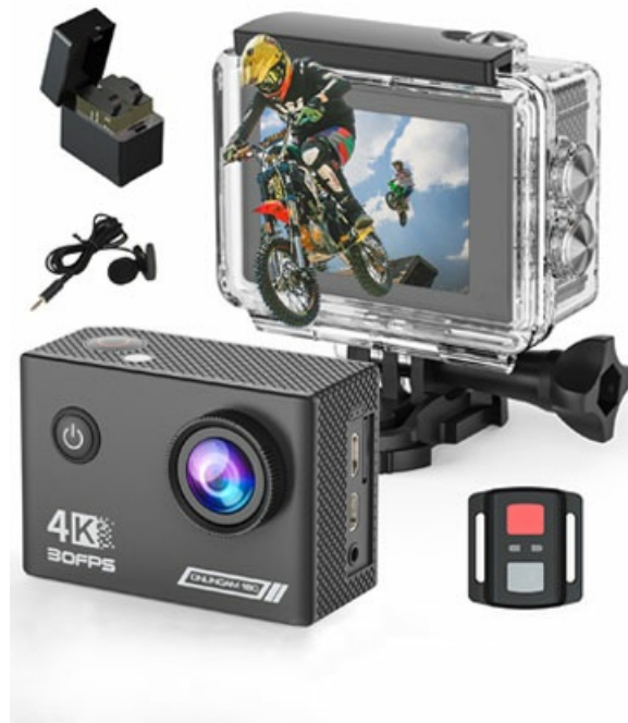
Image: The Yolansin Action Camera positioned next to its compact 2.4G remote control, used for wireless operation.