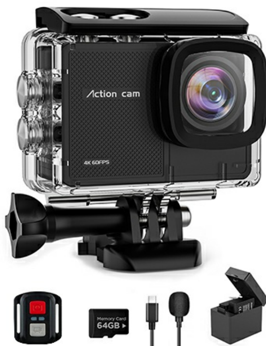
Image: The Yolansin Action Camera securely enclosed within its transparent waterproof housing.