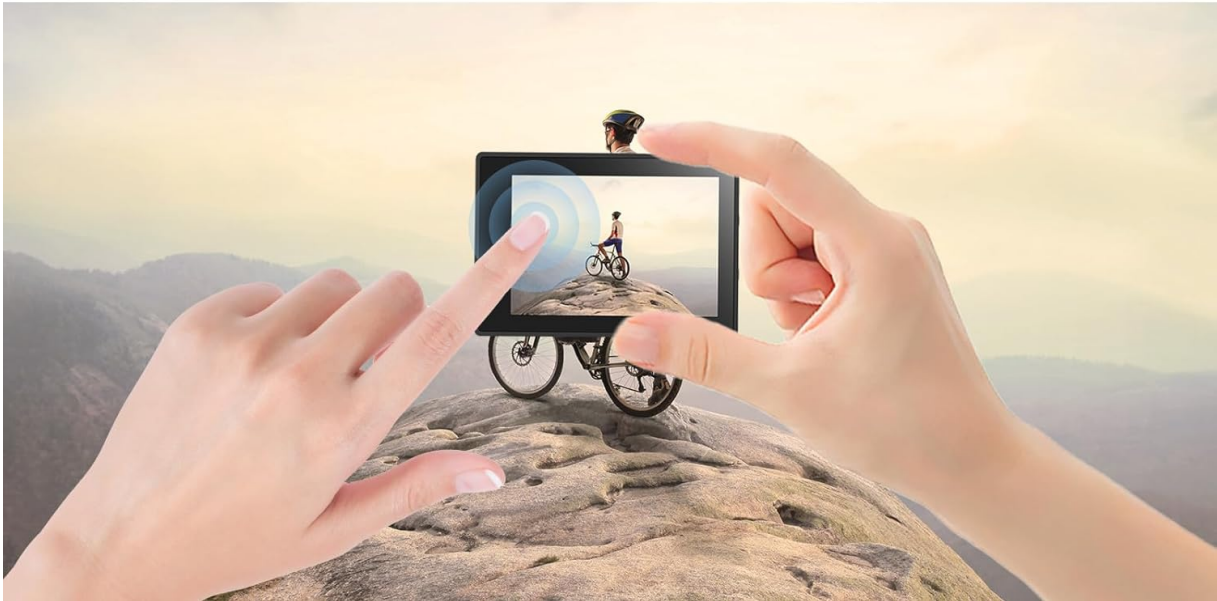
Image: The Yolansin Action Camera highlighting its color front screen and 2-inch touchscreen, demonstrating their use in different scenarios.