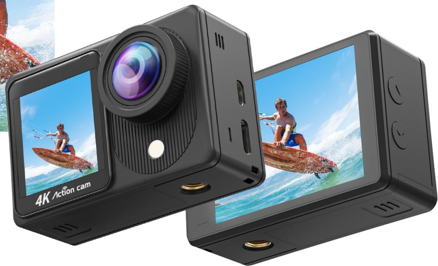
Image: The Yolansin Action Camera shown capturing scenes in both landscape (16:9) and portrait (9:16) orientations.