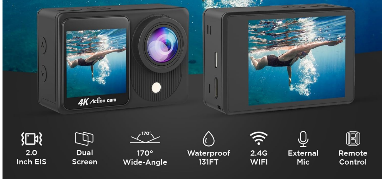
Image: The Yolansin Action Camera displaying its dual screens and icons representing features like 2.0-inch EIS, Dual Screen, 170° Wide-Angle, 131FT Waterproof, 2.4G WiFi, External Mic, and Remote Control.