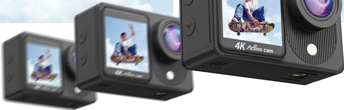
Image: A visual comparison showing the difference in stability between footage captured with Electronic Image Stabilization (EIS) enabled and disabled.