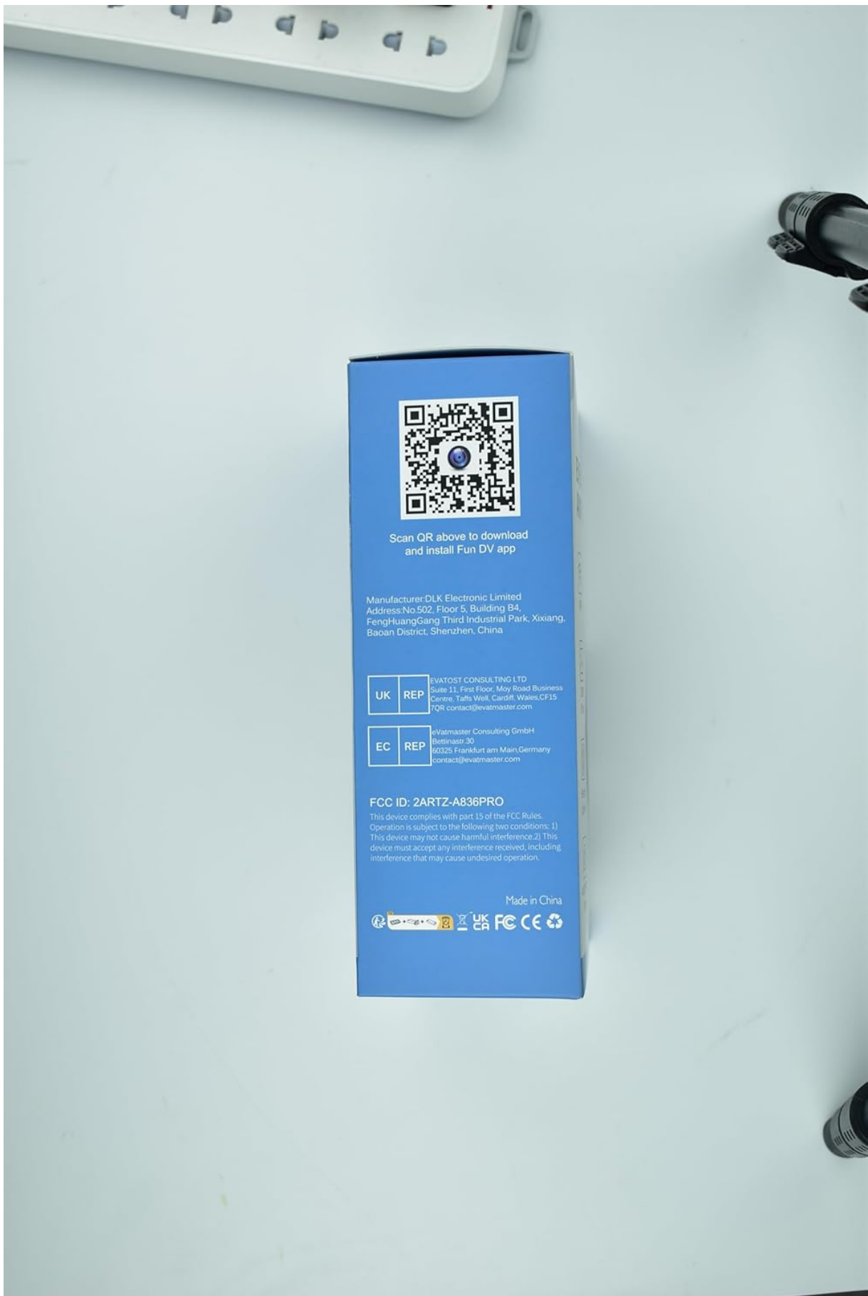
Image: A QR code on the product packaging, which can be scanned to download the FUN DV application for smartphone connectivity.