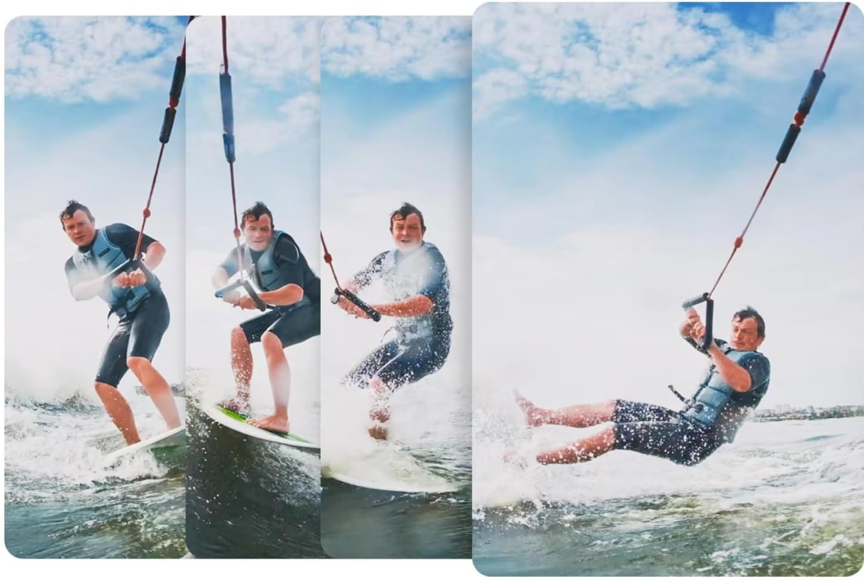
Image: A sequence demonstrating the pre-recording feature, showing frames captured before and during a watersports activity.