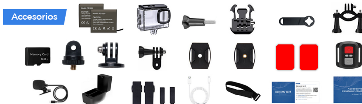
Image: A comprehensive display of all accessories included with the camera, such as batteries, charger, waterproof case, remote control, and various mounts.