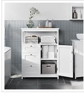
Image: Illustration of the adjustable shelves within the cabinet, showing three possible height settings for flexible storage.

The internal shelves can be adjusted to three different heights. To adjust, carefully remove the shelf, reposition the shelf pins to the desired height, and then place the shelf back onto the pins.