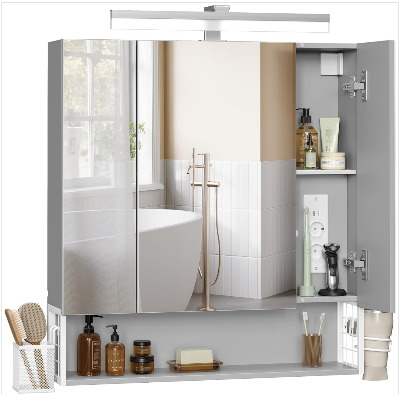
Image: The VASAGLE Bathroom Mirror Cabinet installed in a bathroom, showcasing its design and functionality.