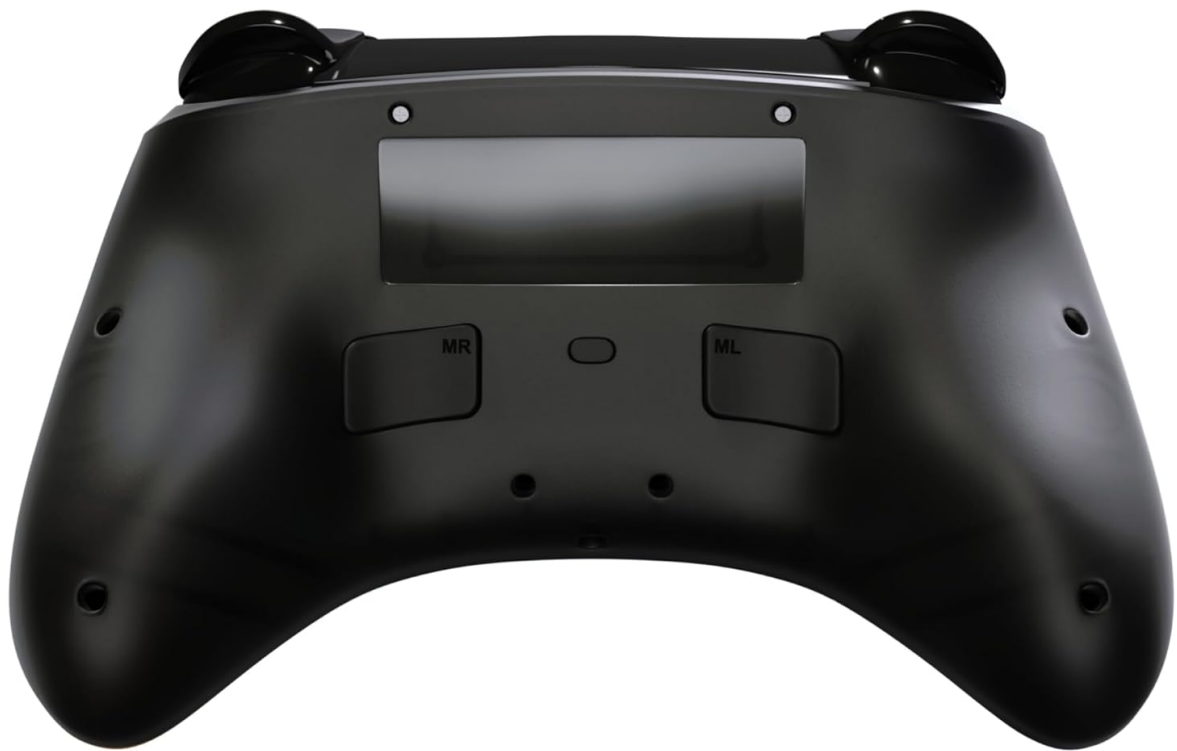
Rear view of the controller, highlighting the programmable macro buttons (MR and ML) and the USB-C charging port.