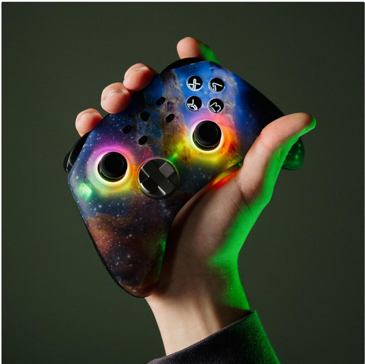
An illustrative graphic demonstrating the 8 available LED colors and 3 dynamic lighting modes (Aurora Wave, Breathing Effect, Stick Follow) of the controller.