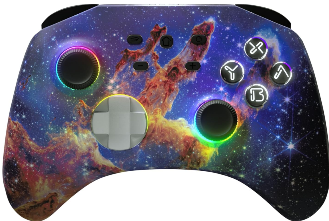
Front view of the Surge Gamepad Pro (Pillars of Creation) Wireless Controller, showcasing its unique cosmic design and illuminated thumbsticks.