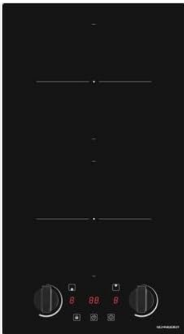
Image 1: Front view of the SCHNEIDER Domino Induction Hob SCDI30M, showing its sleek black glass surface and two control knobs at the bottom.