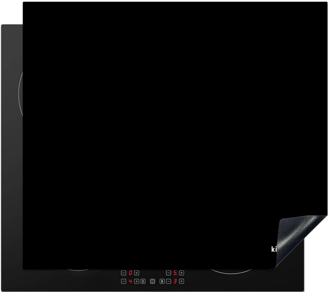
Image: The KitchenYeah Induction Hob Protector placed on an induction cooktop, demonstrating its protective coverage.