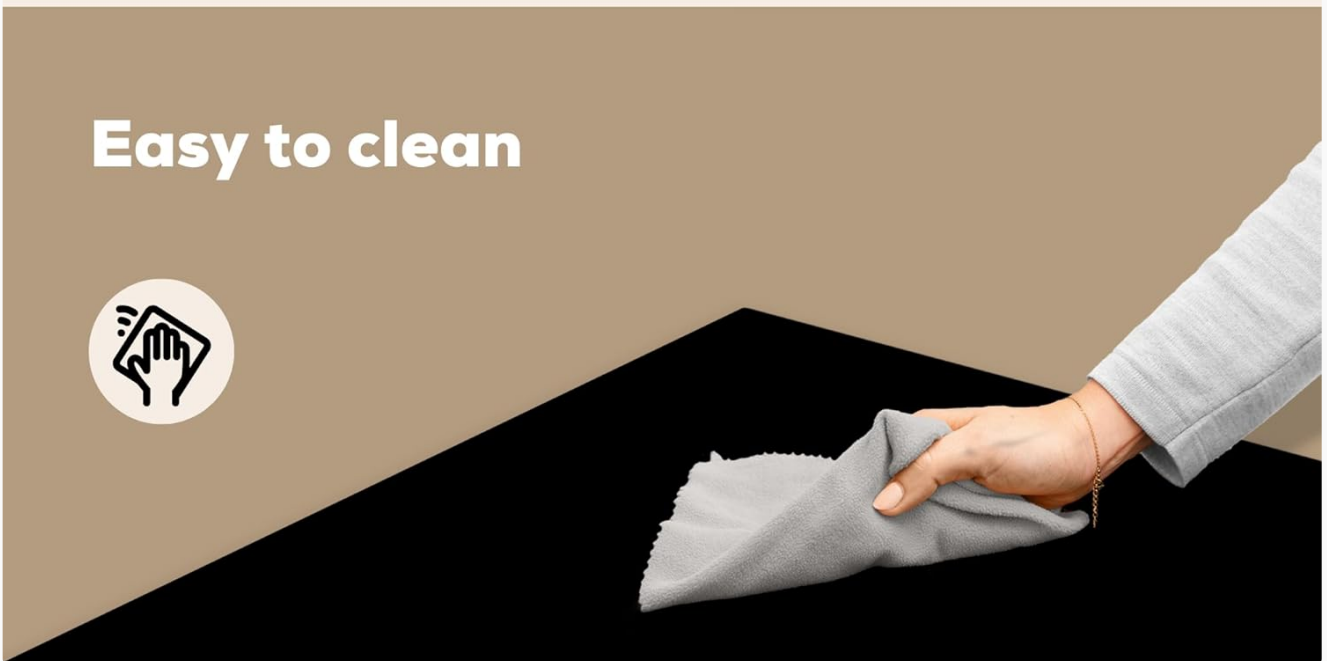
Image: A hand wiping the surface of the induction hob protector with a cloth, highlighting its easy-to-clean, dirt and water repellent properties.