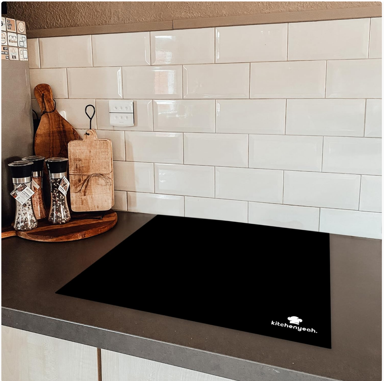
Image: The induction hob protector laid flat on a kitchen counter, ready for use or placement on the hob.