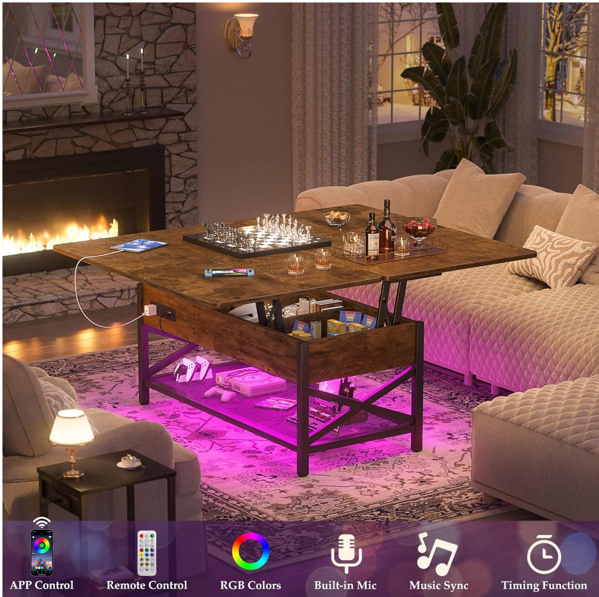
Image: The coffee table is shown with its LED lights set to a purple hue, illustrating the customizable lighting feature and its effect on the room's ambiance.