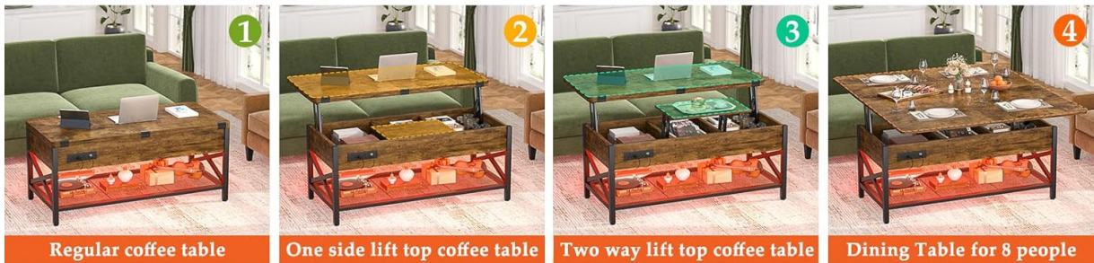
Image: The coffee table is shown with its lift-top extended, demonstrating its use as a dining or workspace. The image highlights the multi-functional desktop.