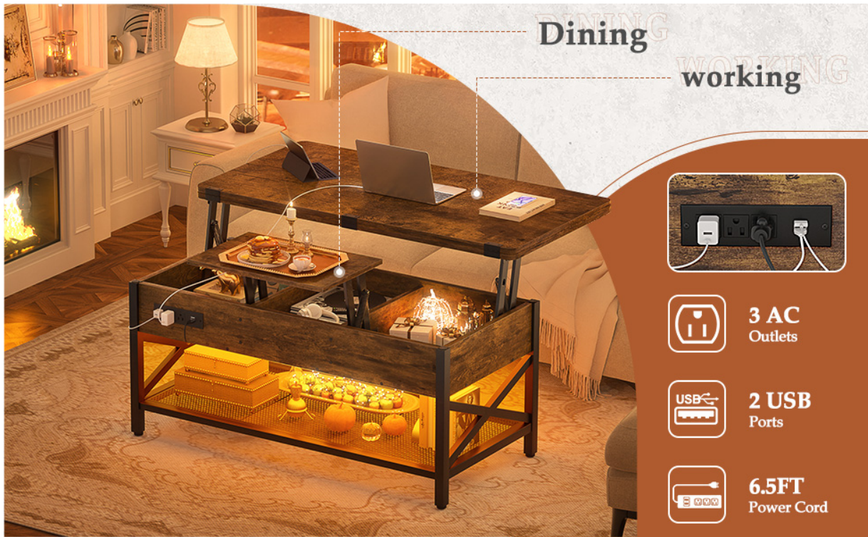
Image: This image provides a detailed view of the power strip, showing the 3 AC outlets and 2 USB ports, along with the 6.5FT power cord.