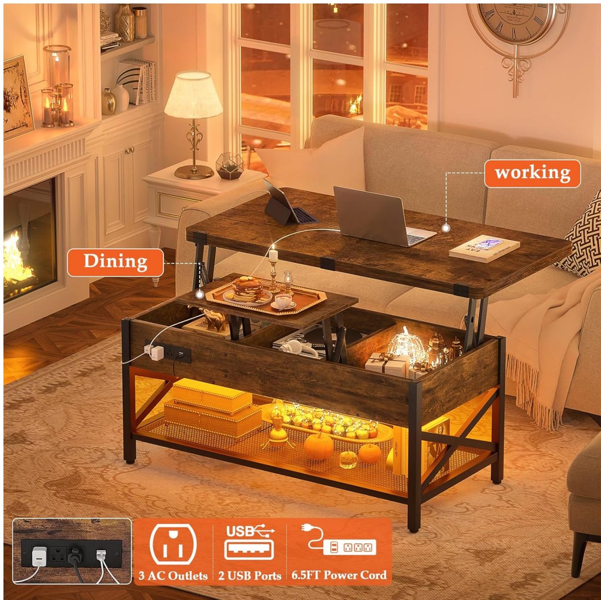
Image: This image illustrates the table's dual functionality, serving as a dining table during the day and a coffee table with ambient lighting at night, emphasizing its adaptability.