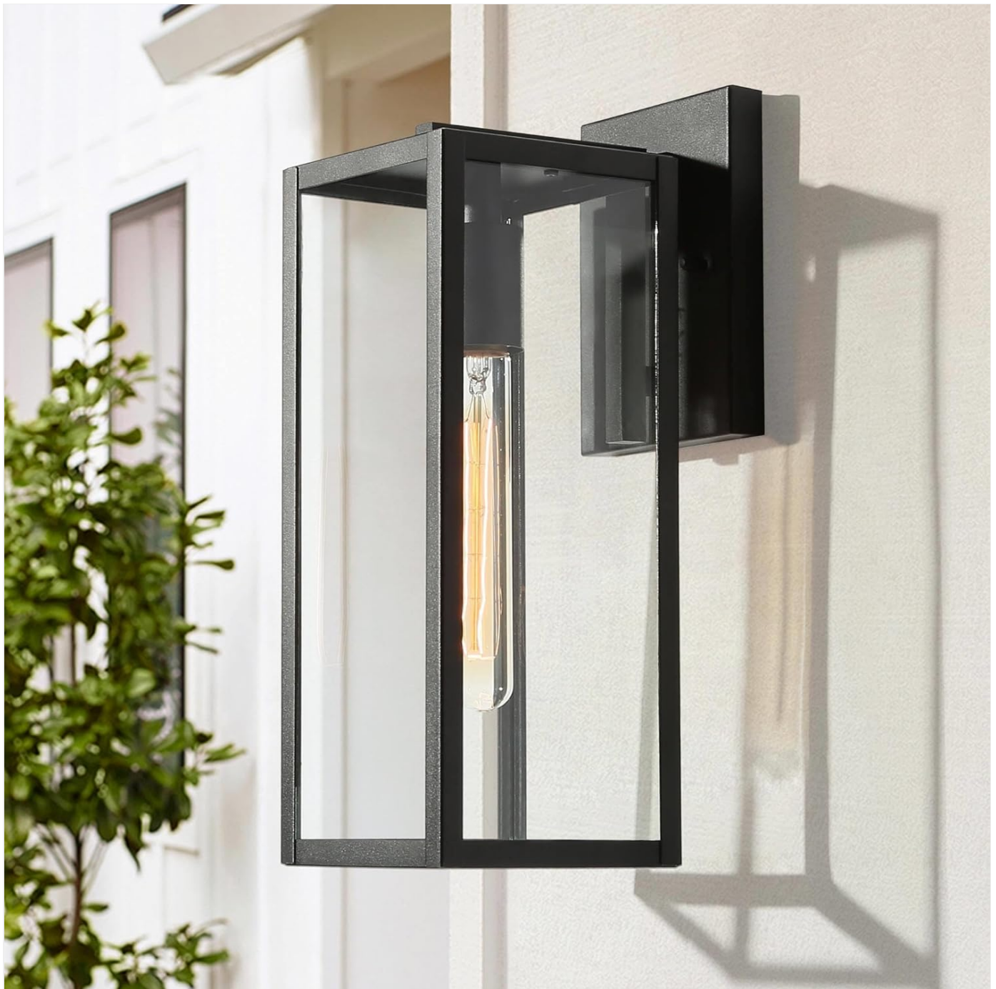
Image 1.1: The classy leaves Black Outdoor Wall Light, showcasing its modern rectangular design with clear glass and a black frame, installed on a house exterior.