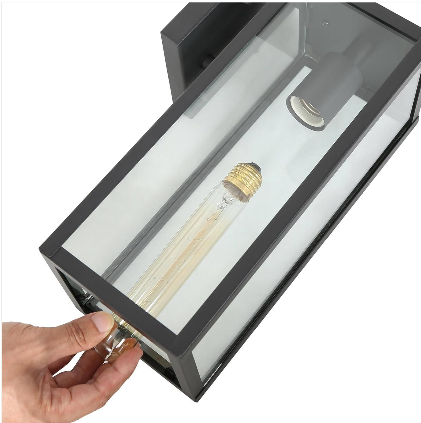
Image 3.1: A hand demonstrating the easy bulb installation into the E26 socket through the open bottom of the fixture.