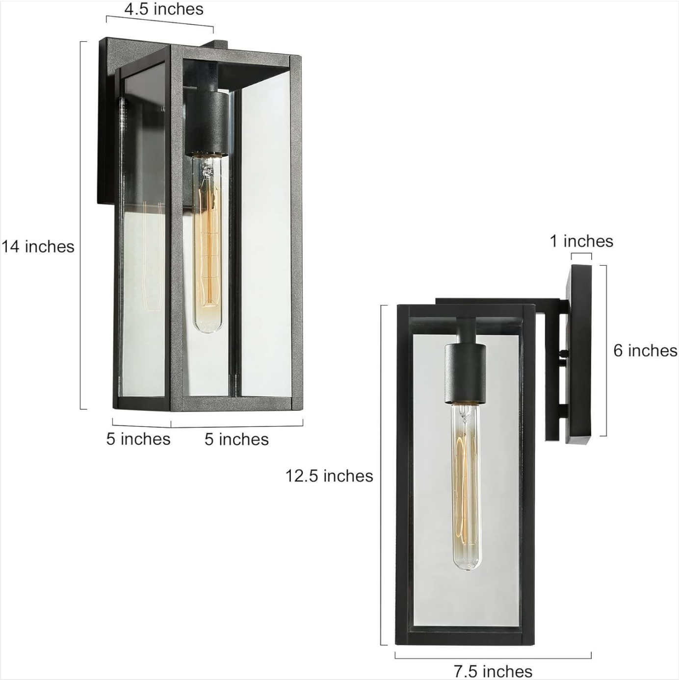
Image 7.1: Dimensional diagram of the outdoor wall light, illustrating its height, width, and depth from the mounting surface.