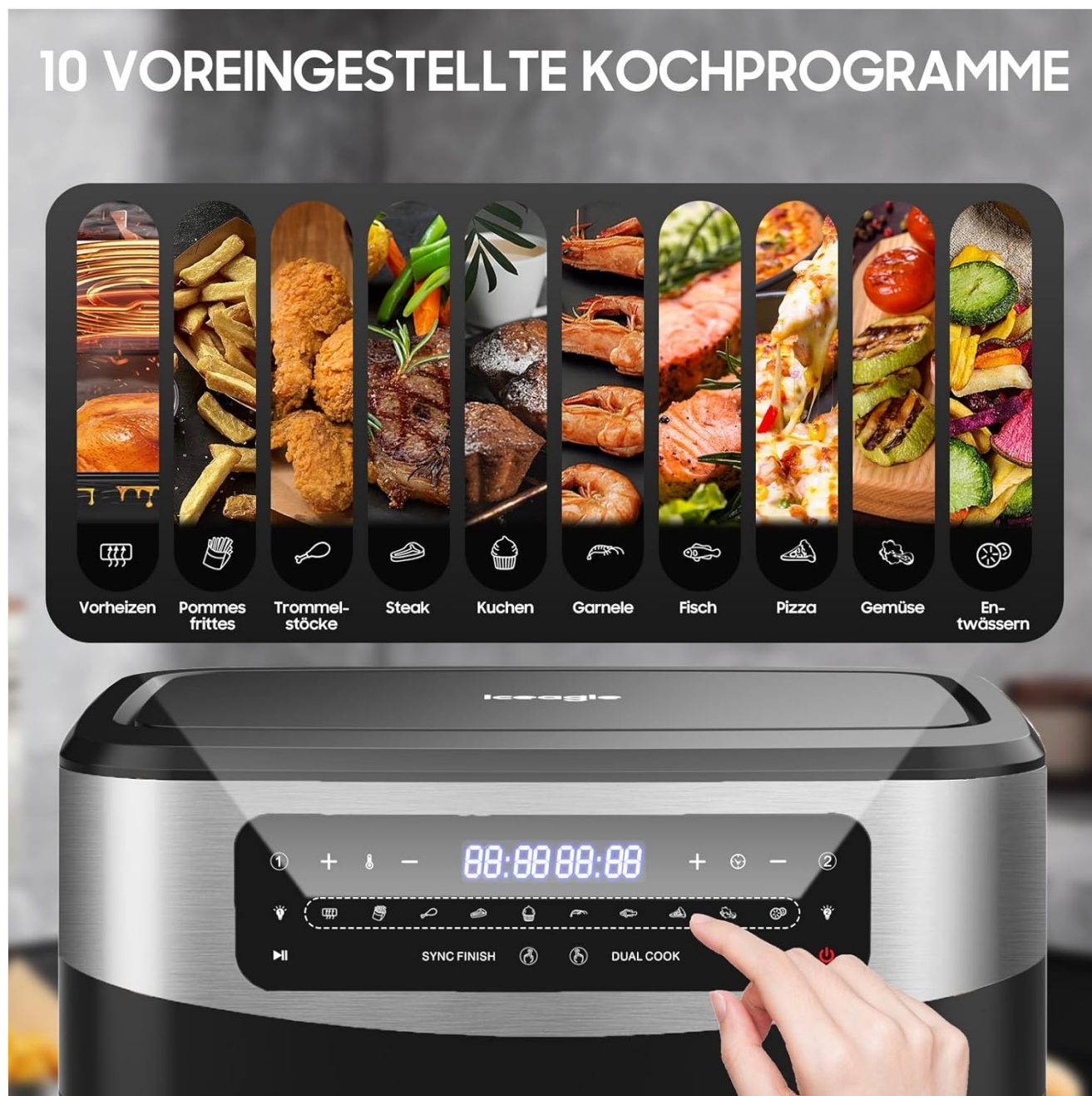
Figure 5: The control panel illustrating the 10 preset cooking programs available for selection.

The LED touch panel allows you to control all functions of the air fryer. It displays time, temperature, and selected programs.