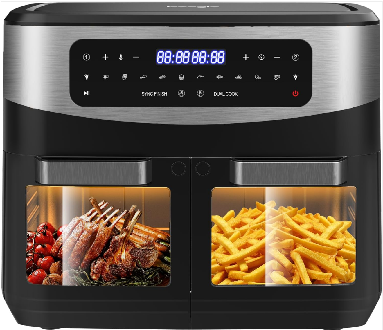
Figure 1: Front view of the Iceagle 12L Dual Basket Air Fryer, showcasing the control panel and transparent cooking windows with food inside.

The Iceagle 12L Air Fryer features a sleek design with a user-friendly LED touch panel and two independent cooking zones, allowing for versatile meal preparation.