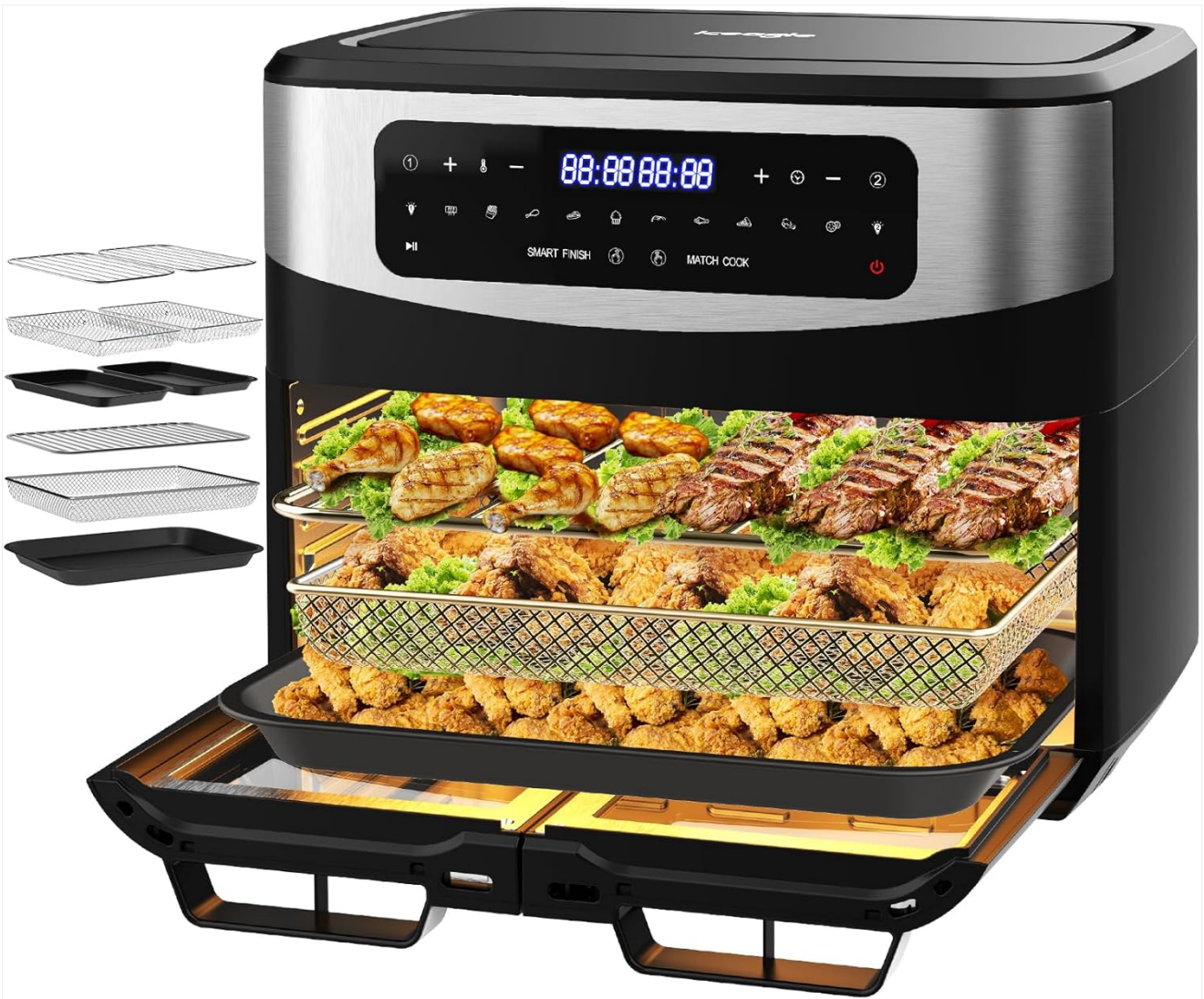
Figure 2: The air fryer displayed with various cooking accessories, including racks and trays, highlighting its versatility.