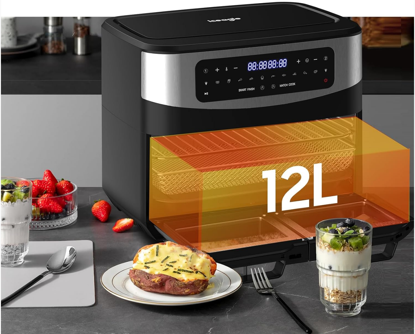
Figure 3: The air fryer demonstrating its large 12-liter capacity, suitable for family-sized meals.