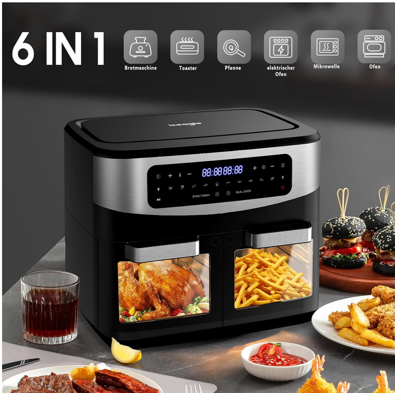
Figure 4: Illustration of the air fryer's multi-functional capabilities, including icons representing toaster, oven, and microwave functions.