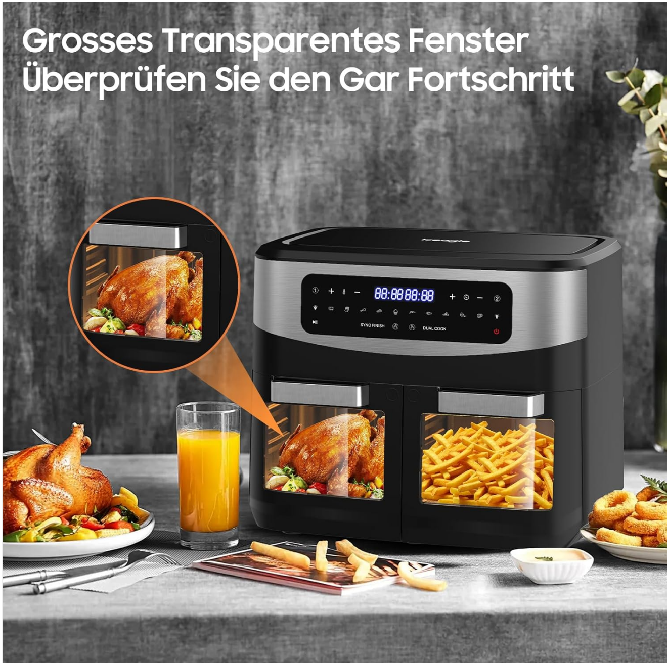
Figure 7: The transparent window feature in action, allowing visual monitoring of food as it cooks inside the air fryer.

The transparent viewing window allows you to check on your food without interrupting the cooking cycle.