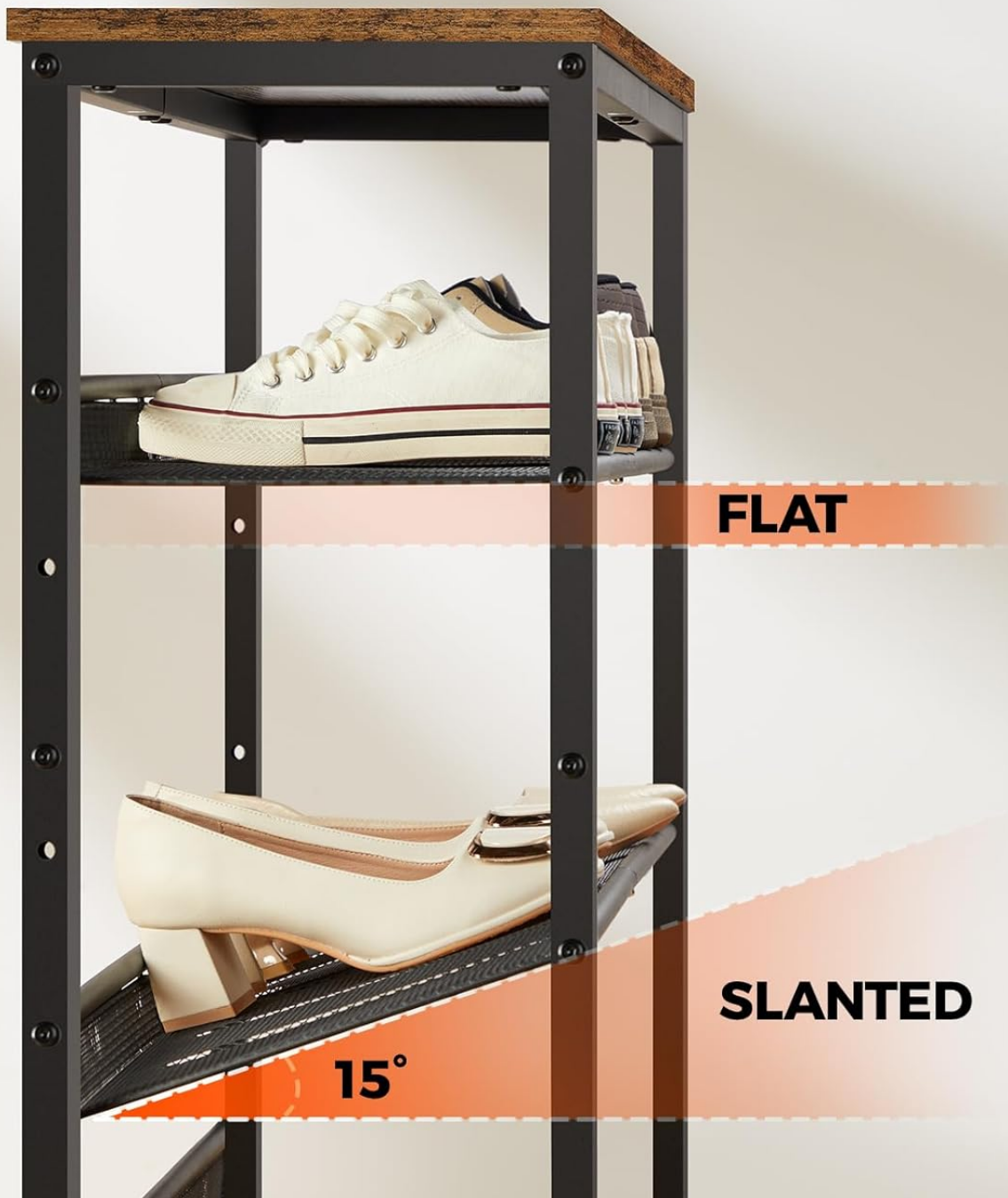
Image: Illustration of the two shelving assembly options: flat for general storage and slanted for easy shoe access.