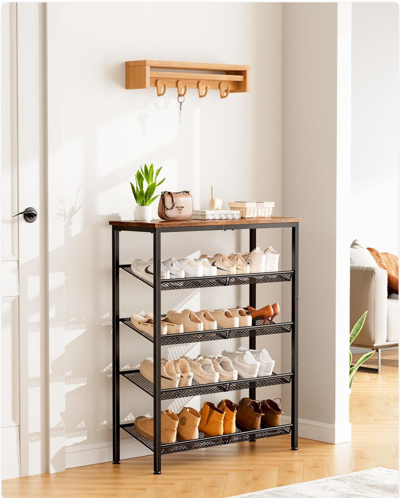
Image: The shoe rack in use, demonstrating its capacity for organizing multiple pairs of shoes in an entryway setting.