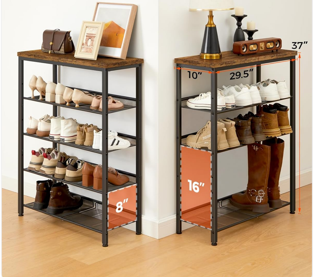
Image: Visual representation of the shoe rack's dimensions (Depth, Width, Height) and internal shelf spacing.