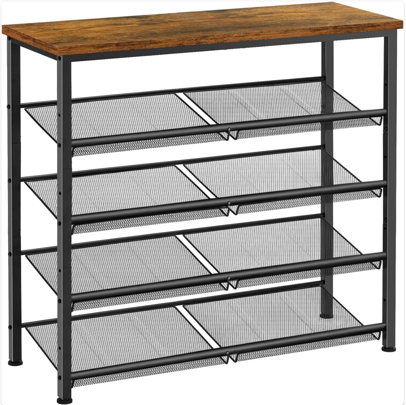
Image: The Pipishell 5-Tier Shoe Rack, showcasing its rustic brown wooden top and black metal mesh shelves.