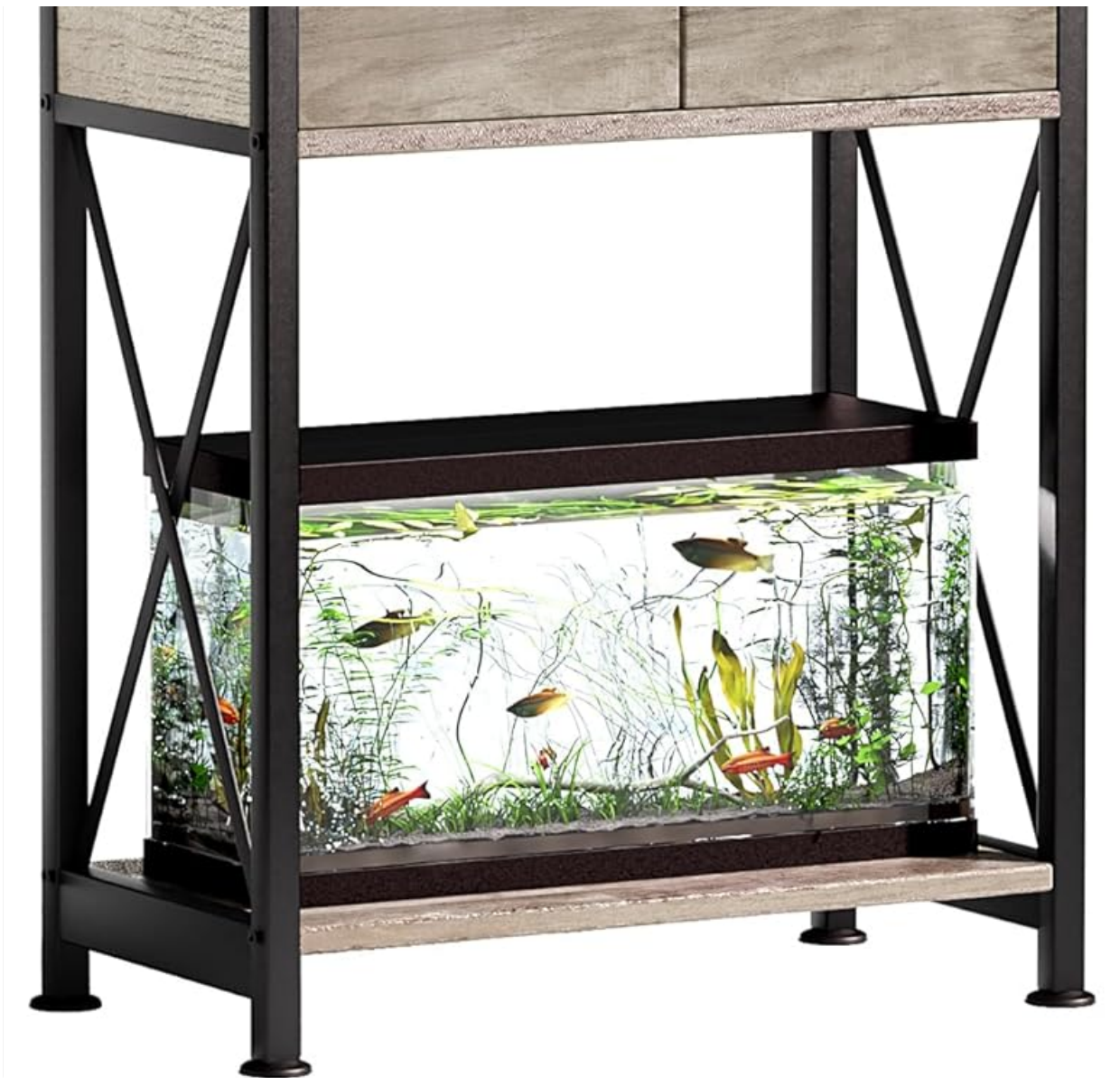
Image: The Herture Fish Tank Stand, showcasing its two-tier design with aquariums on both levels.