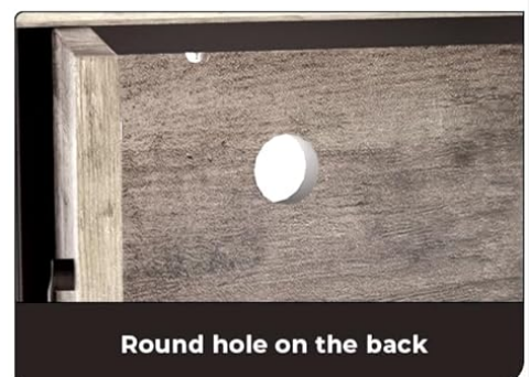
Image: Features like the cabinet interior, adjustable feet, and cable management hole are highlighted.