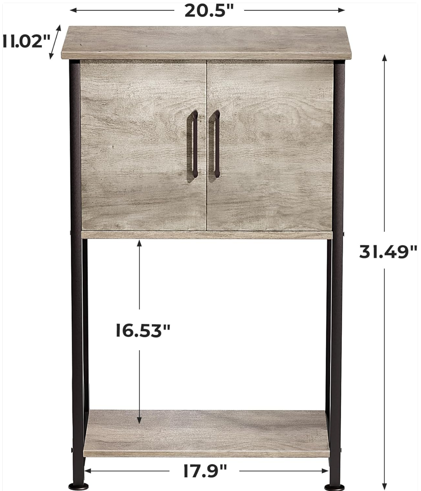
Image: Detailed dimensions of the fish tank stand.