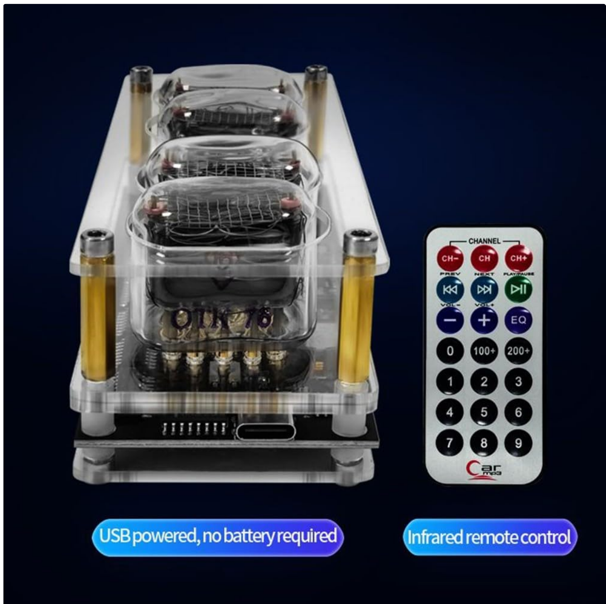
Image: The SPORTARC IN-12 Nixie Tube Clock alongside its infrared remote control, illustrating its USB power capability (no battery required) and remote operation.