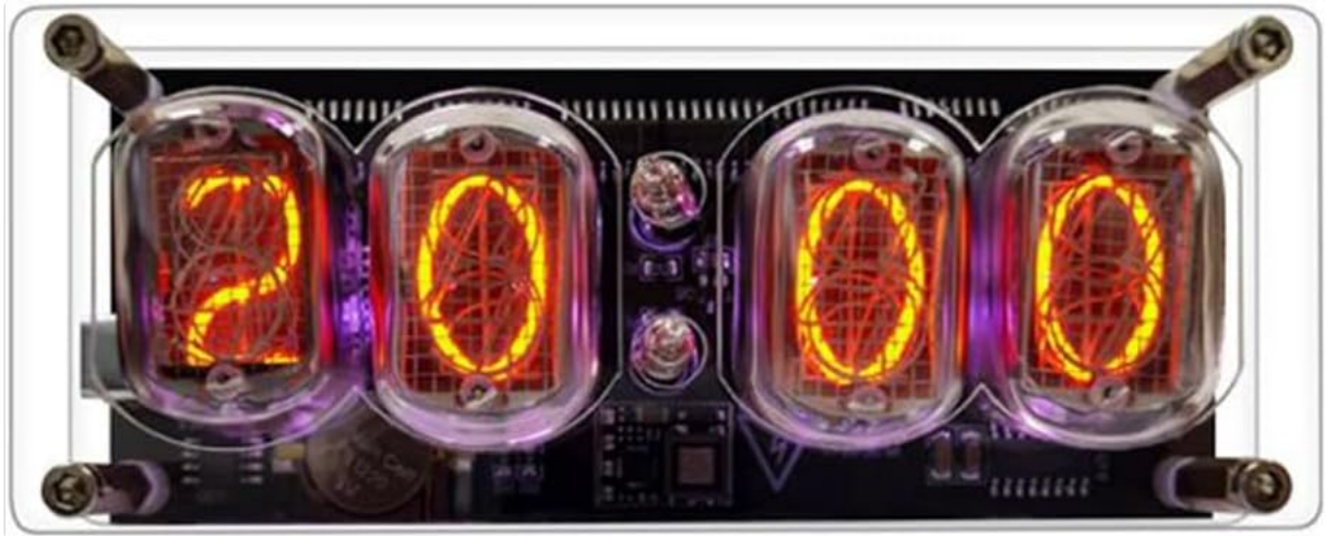
Image: A top-down view of the SPORTARC IN-12 Nixie Tube Clock, showing the illuminated Nixie tubes displaying numerical digits.

Note: Due to variations in remote control designs, refer to the button labels on your specific remote for exact functionality.