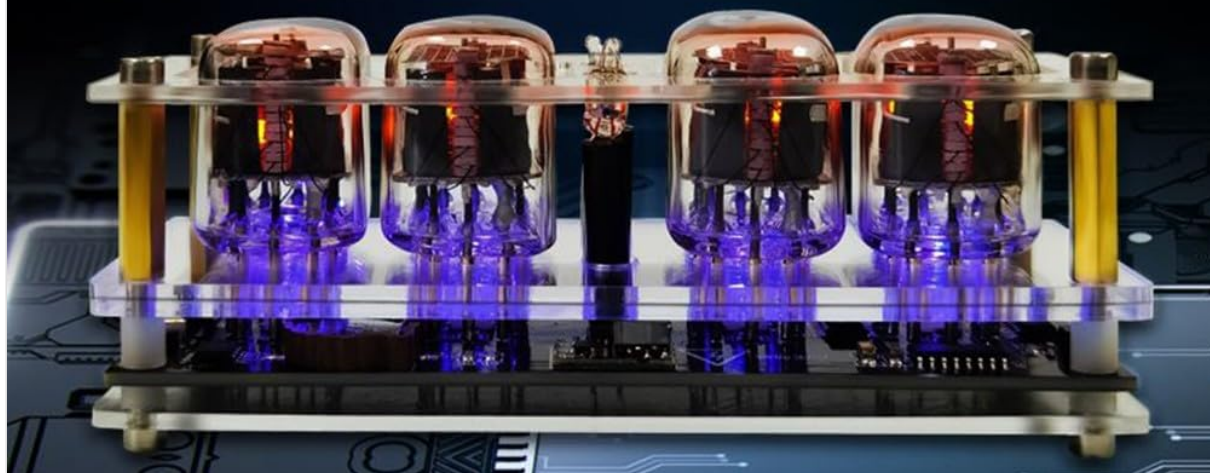
Image: A close-up of the SPORTARC IN-12 Nixie Tube Clock highlighting its high precision chip, which ensures accurate time and date display with minimal annual error.