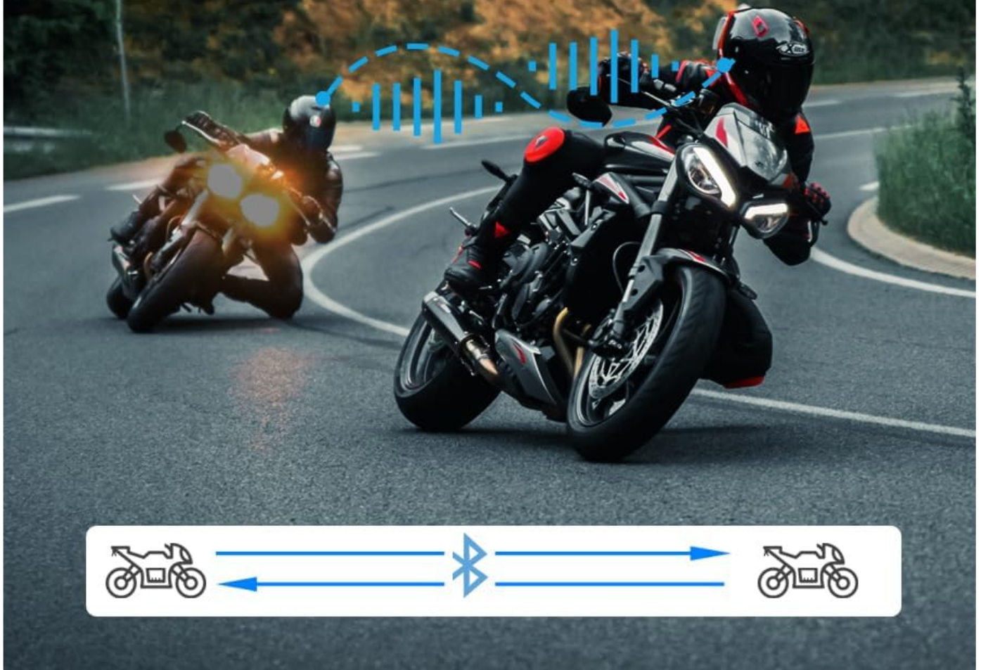
Image: Two riders on motorcycles, illustrating the two-way intercom communication feature.