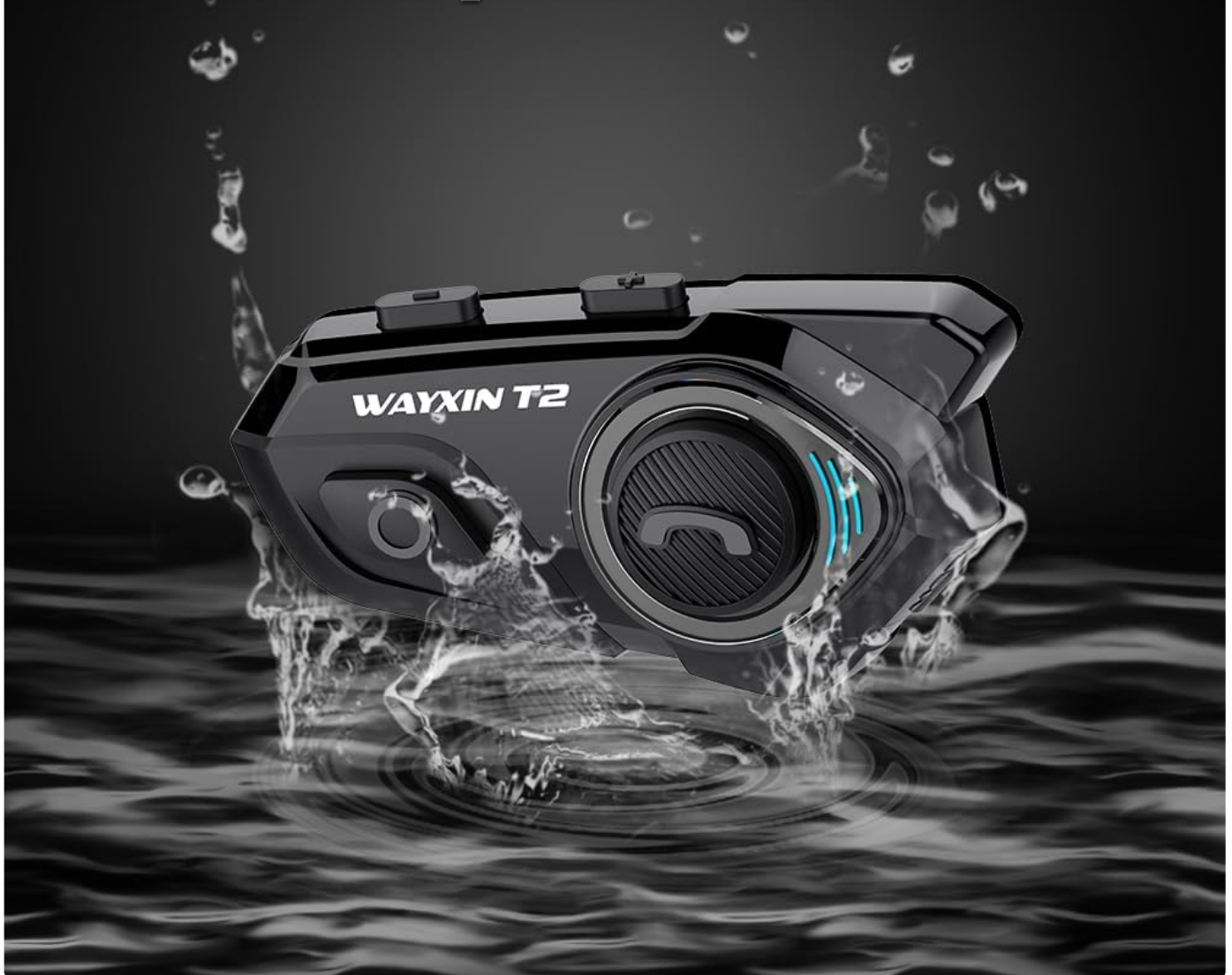
Image: The T2 headset shown with water splashing, highlighting its IP67 waterproof feature.