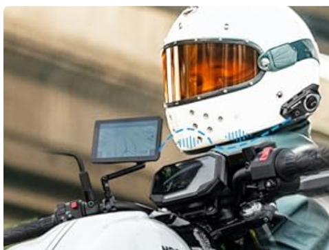
Image: A motorcycle helmet with the T2 headset installed, connected to a GPS device, demonstrating integrated use.