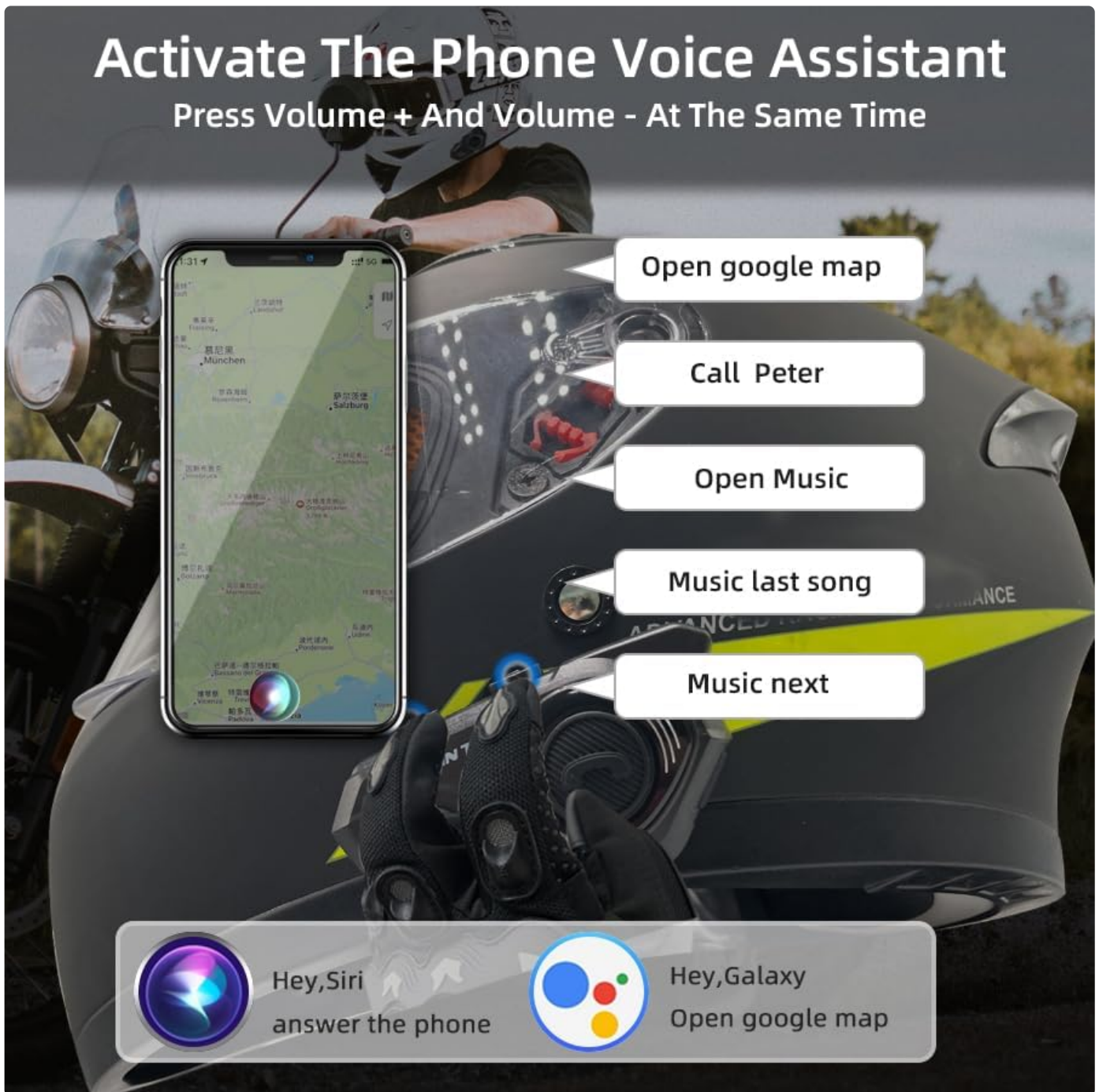
Image: A helmet with the T2 headset, showing a smartphone screen with voice assistant commands, highlighting the voice control feature.