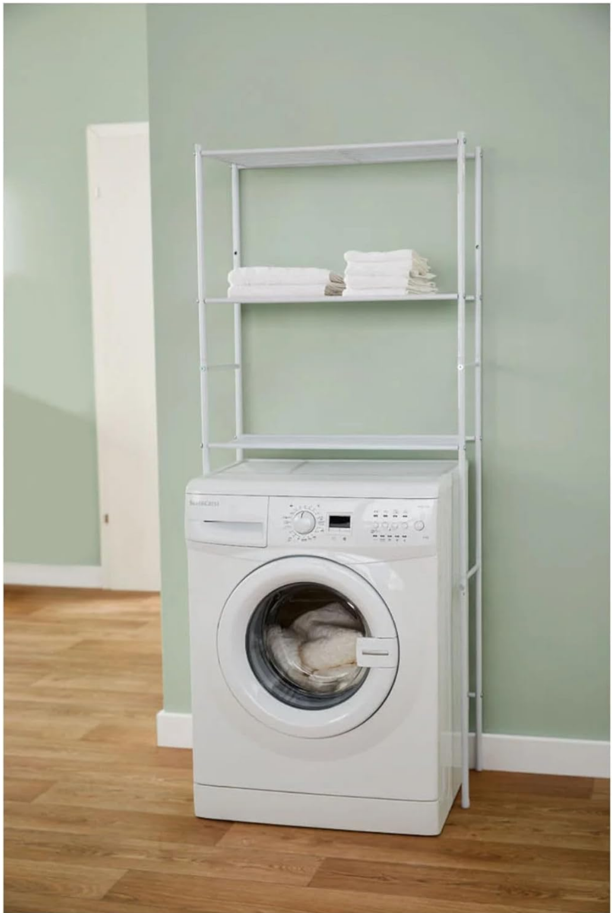
Figure 2: The over-rack installed above a washing machine, demonstrating its intended use for maximizing vertical storage space in a laundry area.