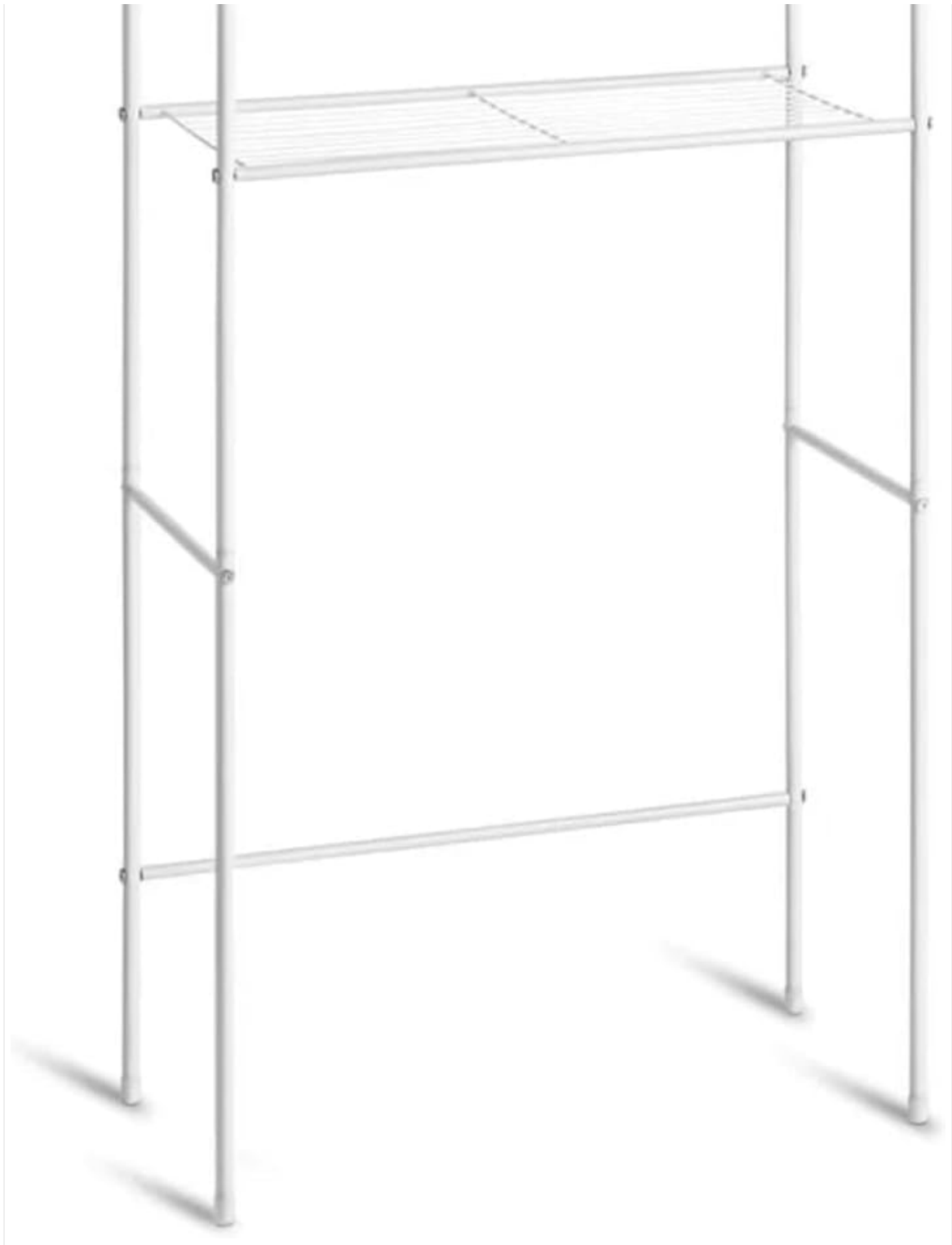
Figure 1: The Livarno Home Washing Machine Over-Rack, fully assembled and ready for use. This image shows the white metal frame with three horizontal shelves.