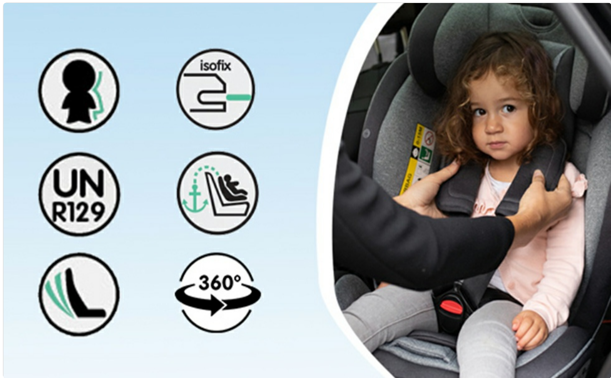
Image: A child seated in the Nania Dune car seat, with an adult adjusting the 5-point harness for a secure fit. Safety icons are visible in the background.