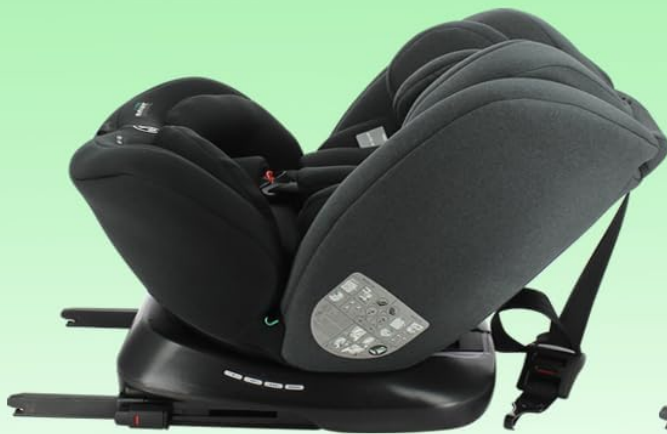
Road back 40-105 cm