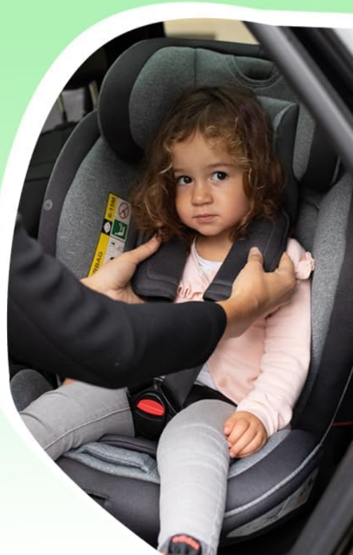
Image: The Nania Dune car seat demonstrating its 360-degree swivel feature, with an inset showing a child being secured in the seat.