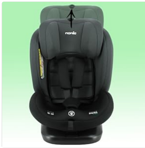
Image: The Nania Dune car seat with its headrest shown in different height positions, illustrating the adjustment mechanism.