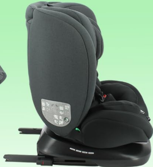
Front road From 76 cm

Image: Comparison of the Nania Dune car seat installed in rear-facing (left, for 40-105 cm) and forward-facing (right, from 76 cm) positions.