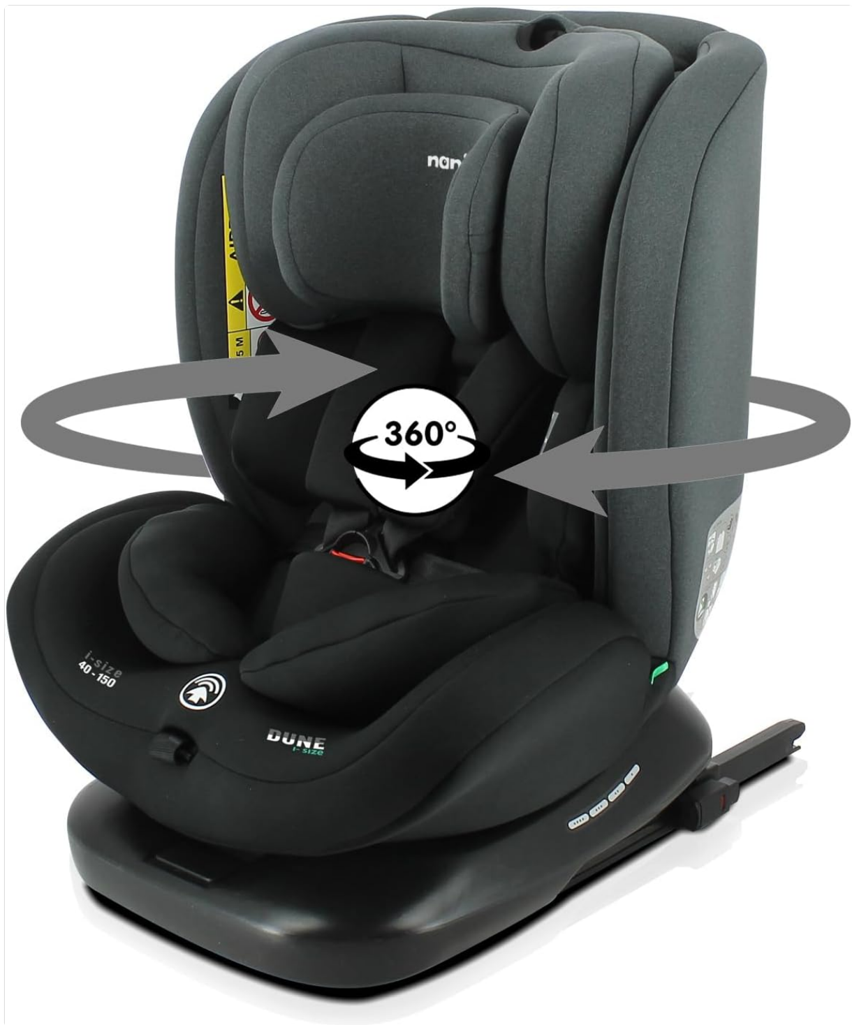
Image: The Nania Dune car seat, illustrating its 360-degree swivel capability with circular arrows.