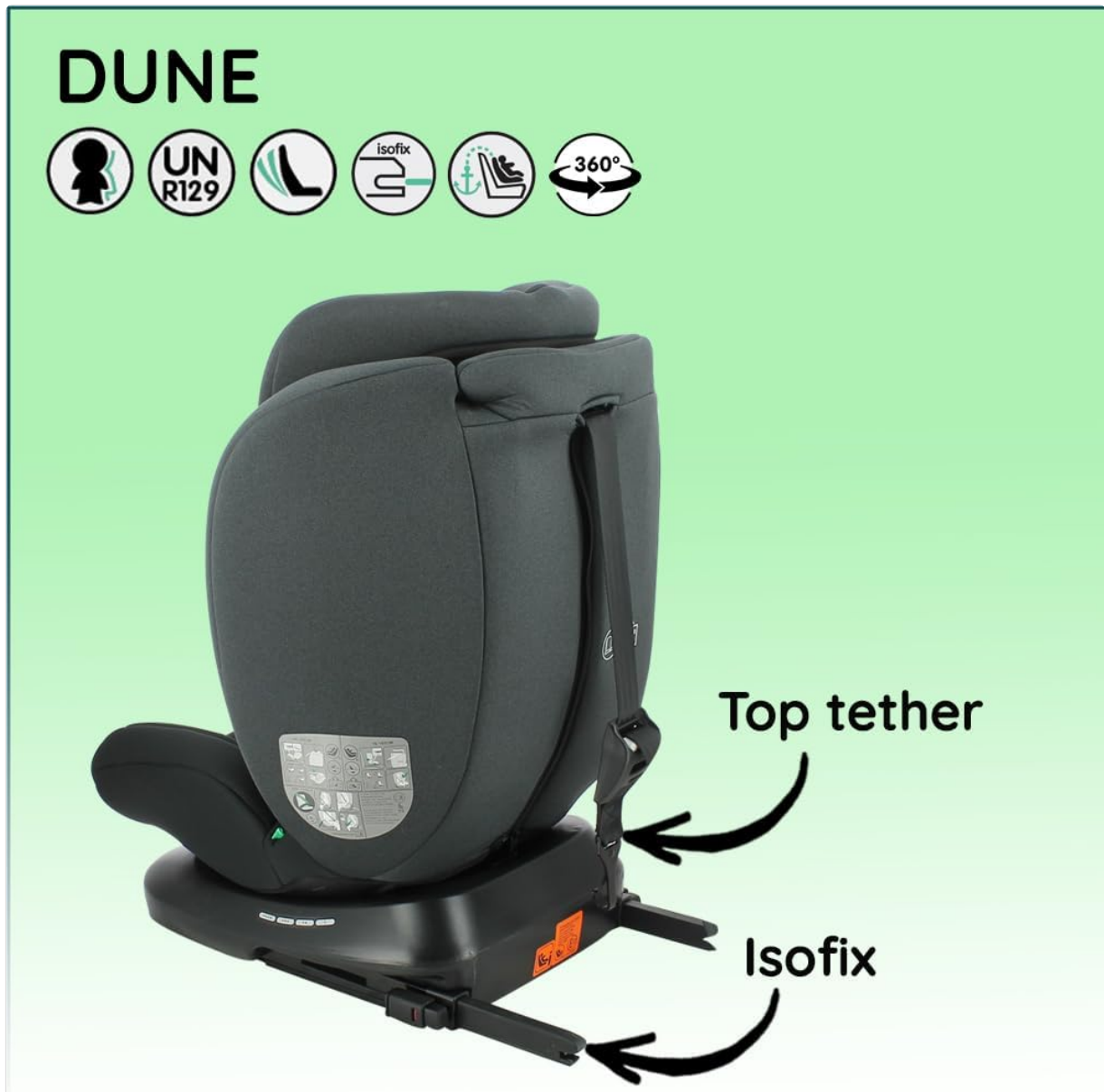
Image: Close-up view of the Nania Dune car seat base, highlighting the extendable ISOFIX connectors and the Top Tether strap for secure vehicle installation.