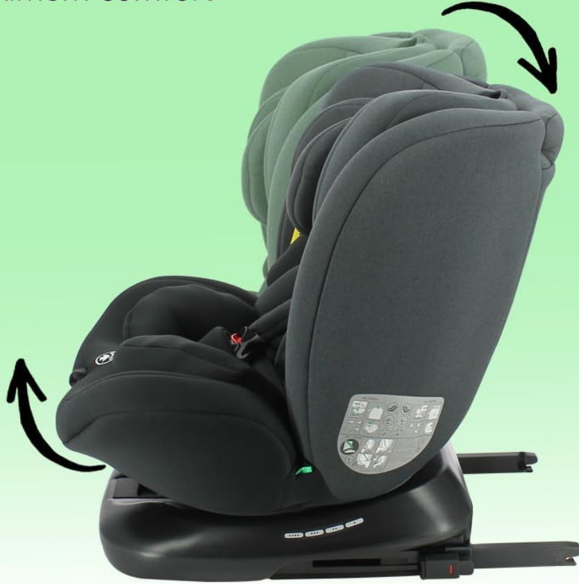
Image: The Nania Dune car seat shown in various recline positions, indicating its adjustability for comfort.